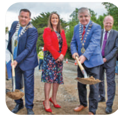
CHAPEL ROAD Page 6