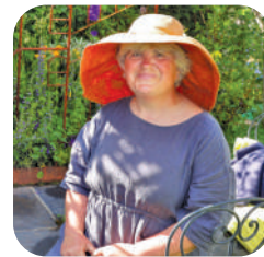
BLOOM Page 8