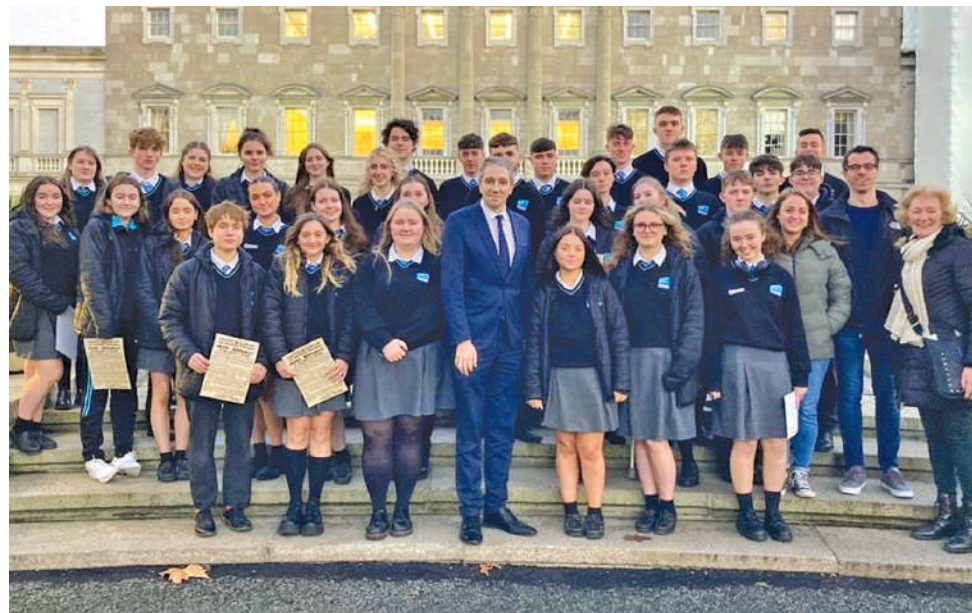
Tánaiste Simon Harris with students from St. David's Secondary School.

The funding will also bolster ICT capacity across the county. Harris said, "Over €1 million for ICT will ensure that schools primary, secondary, and special schools can equip their students with the digital skills necessary to succeed in today's fast-evolv-