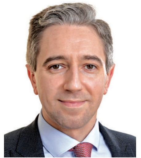
Tánaiste Simon Harris.

"Secondly, it's about making our local towns and villages more vibrant and more attractive places to live, work, visit and raise a family. I look forward to visiting these projects very soon and I want to congratulate everyone involved."