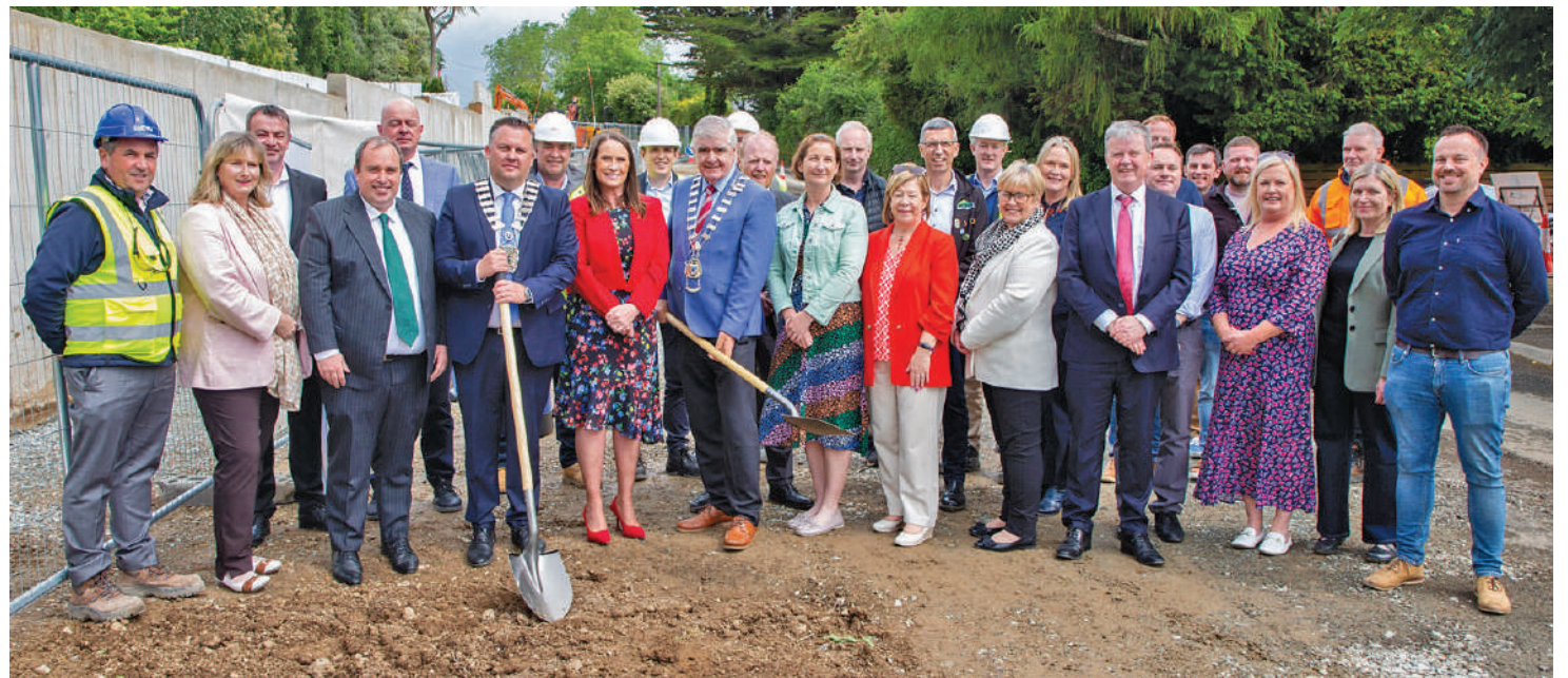
All attendees at the sod turning ceremony.