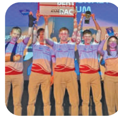
RED KITE RACING Page 12