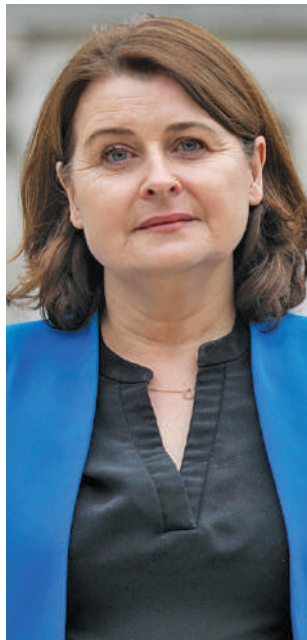
Jennifer Whitmore TD.

Social Democrats TD Jennifer Whitmore has raised the ongoing annual issues in the school bus transport system in Wicklow in the Dail, warning the Minister for Education to put measures in place now to ensure a workable school bus system is available to Wicklow students for the start of the next academic year.