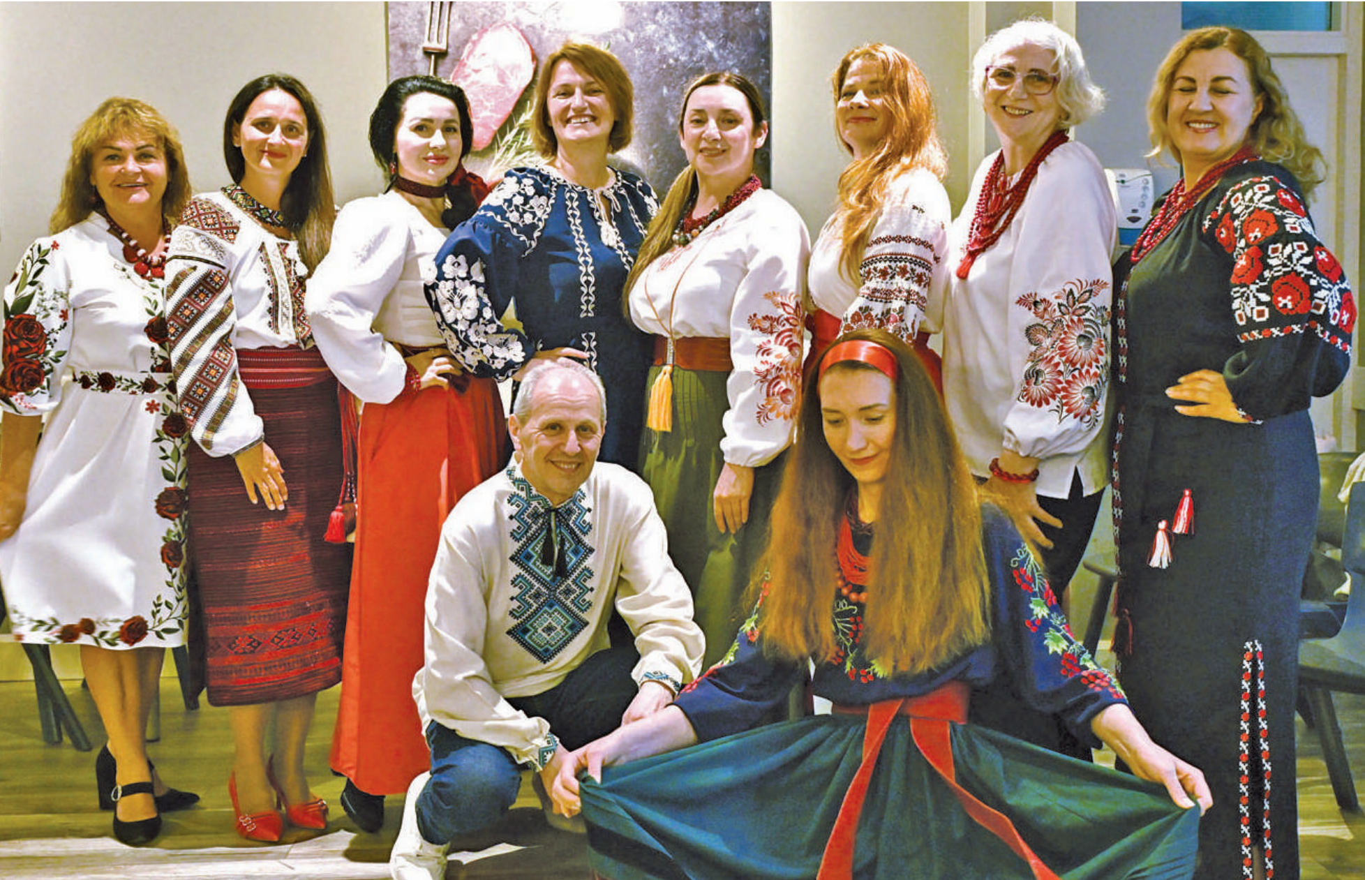
The event featured performances from BIFE students, staff, and a host of Ukrainian artists, highlighting the vibrancy and resilience of Ukrainian culture.