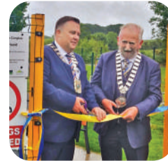
BALTINGLASS PARK Page 8