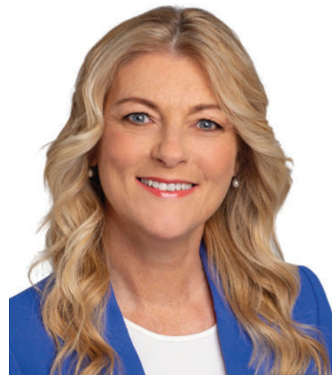
Ireland South MEP Cynthia Ní Mhurchú.

Ní Mhurchú has described the dramatic increase in the number of power outages as requiring an explanation from ESB Networks. "Customers deserve an explanation as to why they are facing more power cuts when they are paying the second highest electricity prices in Europe. The least Irish customers deserve is more investment in the infrastructure that delivers that electricity."