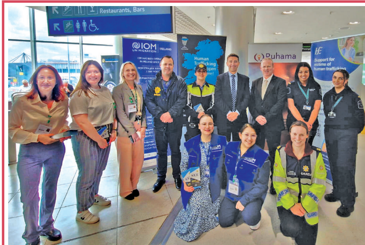
Pictured are the HSE Dublin South & Wicklow Anti Human Trafficking Team (AHTT) supporting a major day of action at Dublin Airport on Thursday, 15th May along with other support agencies. The event was the first in a planned programme of action to highlight and tackle human trafficking and improve identification and support. The HSE Dublin South & Wicklow AHTT were present to support the event and provide advice around how the AHTT team is supporting identified victims of human trafficking.