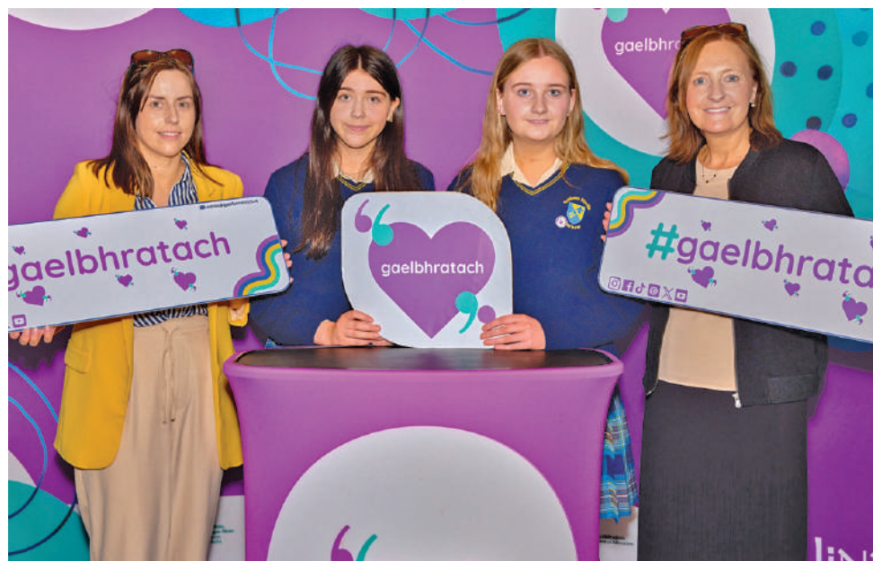
Photographed at the Gaelbhrtach awards ceremony was the coiste Gaelbhrtach from Colaiste Bhride, Carnew.

language use and learning while promoting Irish in meaningful, self-directed ways.