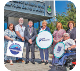
CELTIC TIDE Page 13