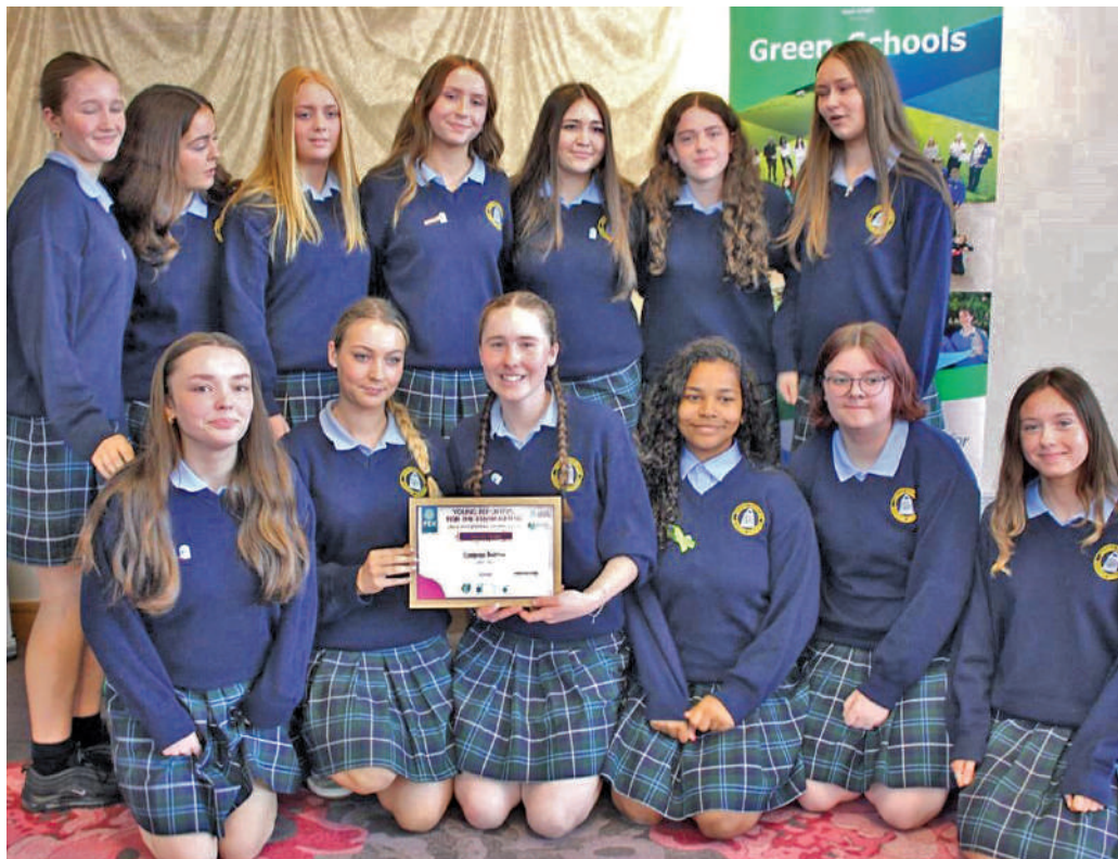
Students from Coláiste Ráithín received an honourable mention for their video reel on fast fashion at the Young Reporters of the Environment Awards.