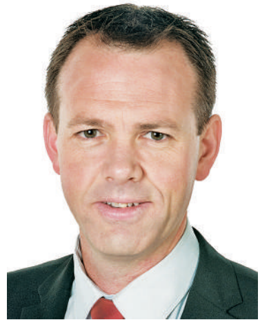
John Brady TD.

Deputy Brady is calling on the government to immediately introduce a ban on future rent increases to give renters a break and stop the current crisis from worsening further. If this government is serious about addressing the ever-worsening housing crisis, it must step in now and freeze rents. Anything less is a betrayal of the thousands of people who are struggling every single day, just to keep a roof over their heads. Renters need protection - not more broken promises."