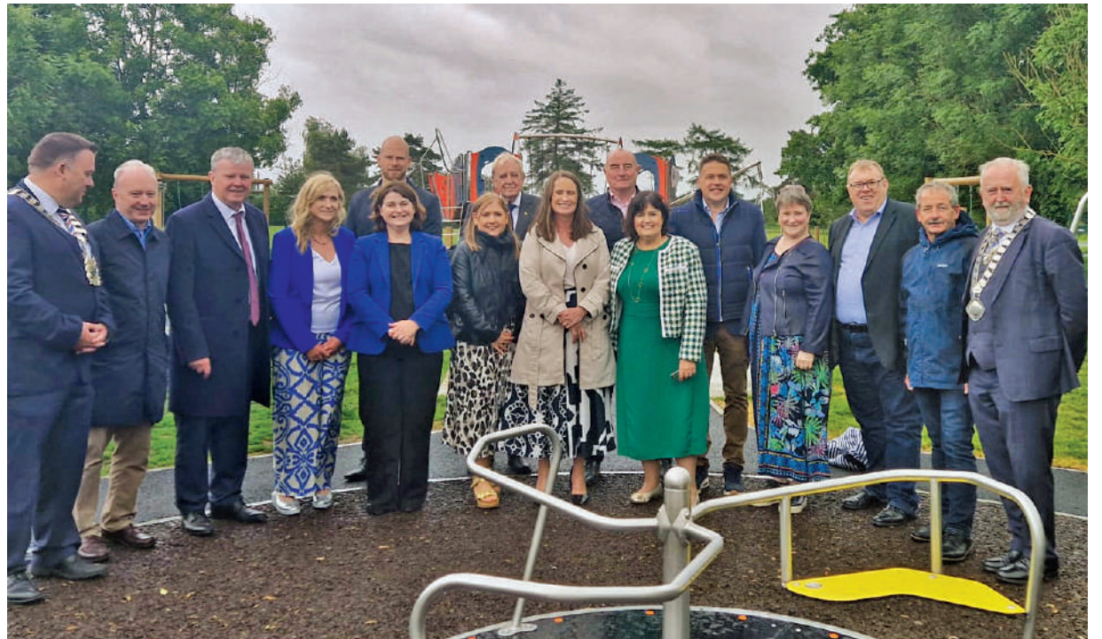
Local Elected Officials and members of Wicklow County Council.