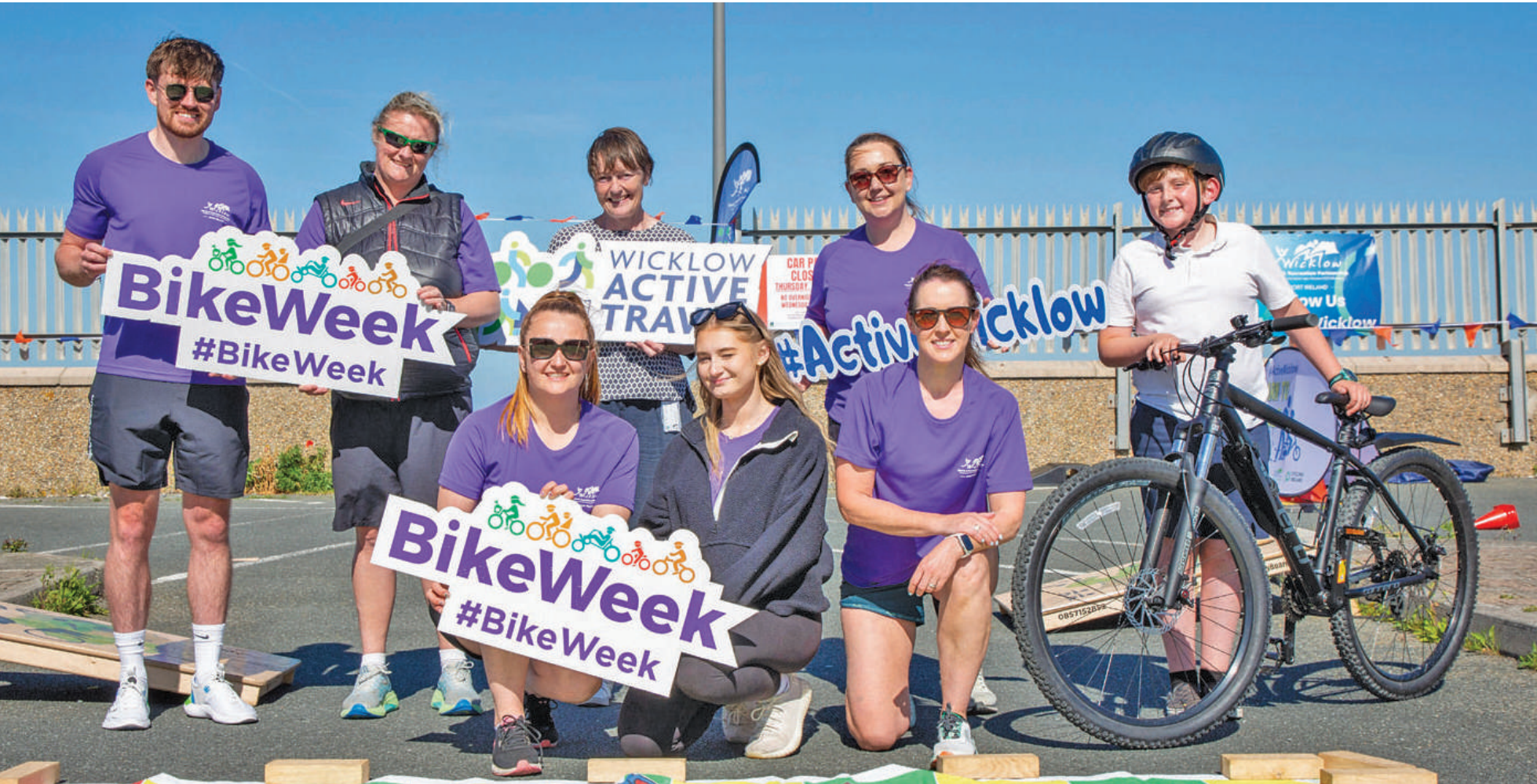
The Wicklow Sports Partnership team at the Wicklow Sports Partnership Bike Week event in the Murrough Car Park, Wicklow Town.

county's commitment to promoting healthy lifestyles, active travel, and inclusive community events.