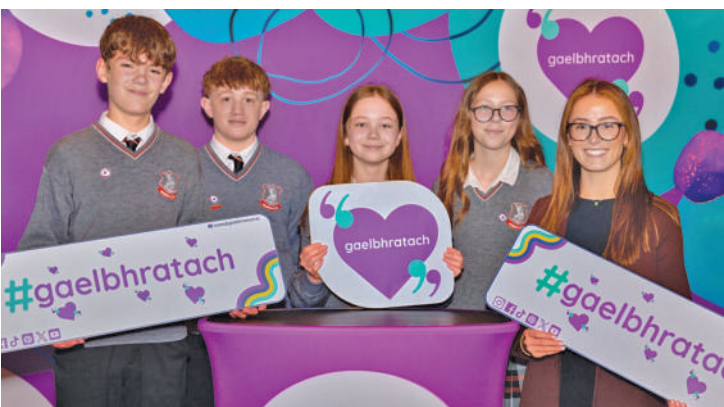
Photographed at the Gaelbhrtach awards ceremony was the coiste Gaelbhrtach from Woodbrook College.