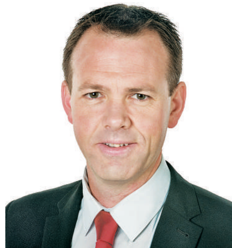
John Brady TD.

He expressed his willingness to work collaboratively with the Minister and relevant stakeholders to facilitate the acquisition and integration of the land in the National Park.