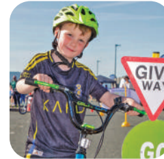
BIKE WEEK Page 10