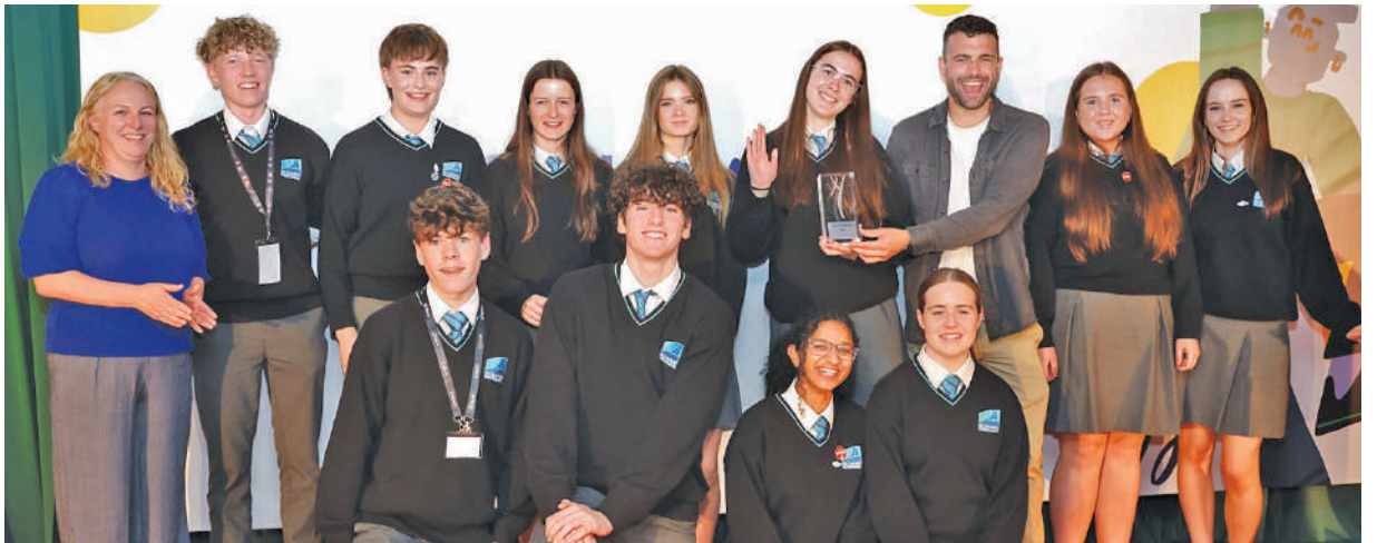
Students from St David's Holy Faith Secondary School, who won an Advocacy Award for their 'Get Voting' project which aims to increase democratic engagement amongst the younger generation.

For more information about Young Social Innovators, see www.youngsocialinnovators.ie .