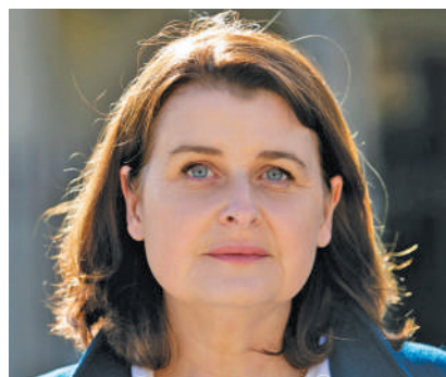
Jennifer Whitmore TD.