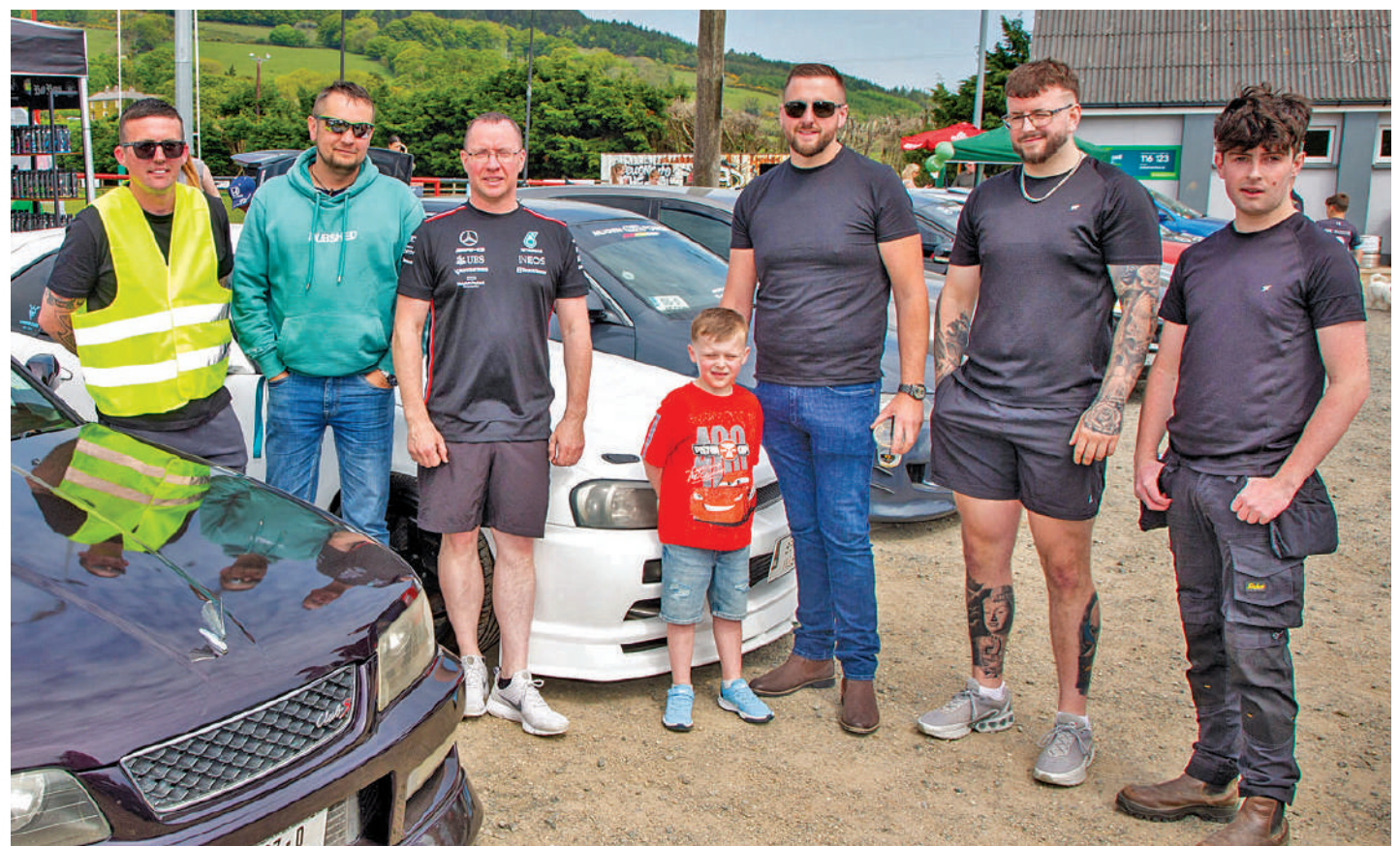
The Cars and Coffee Team at the Arklow Cars & Coffee Charity Car Show in aid of Futures in Mind (formerly Talk to Tom), at Arklow Rugby Club.