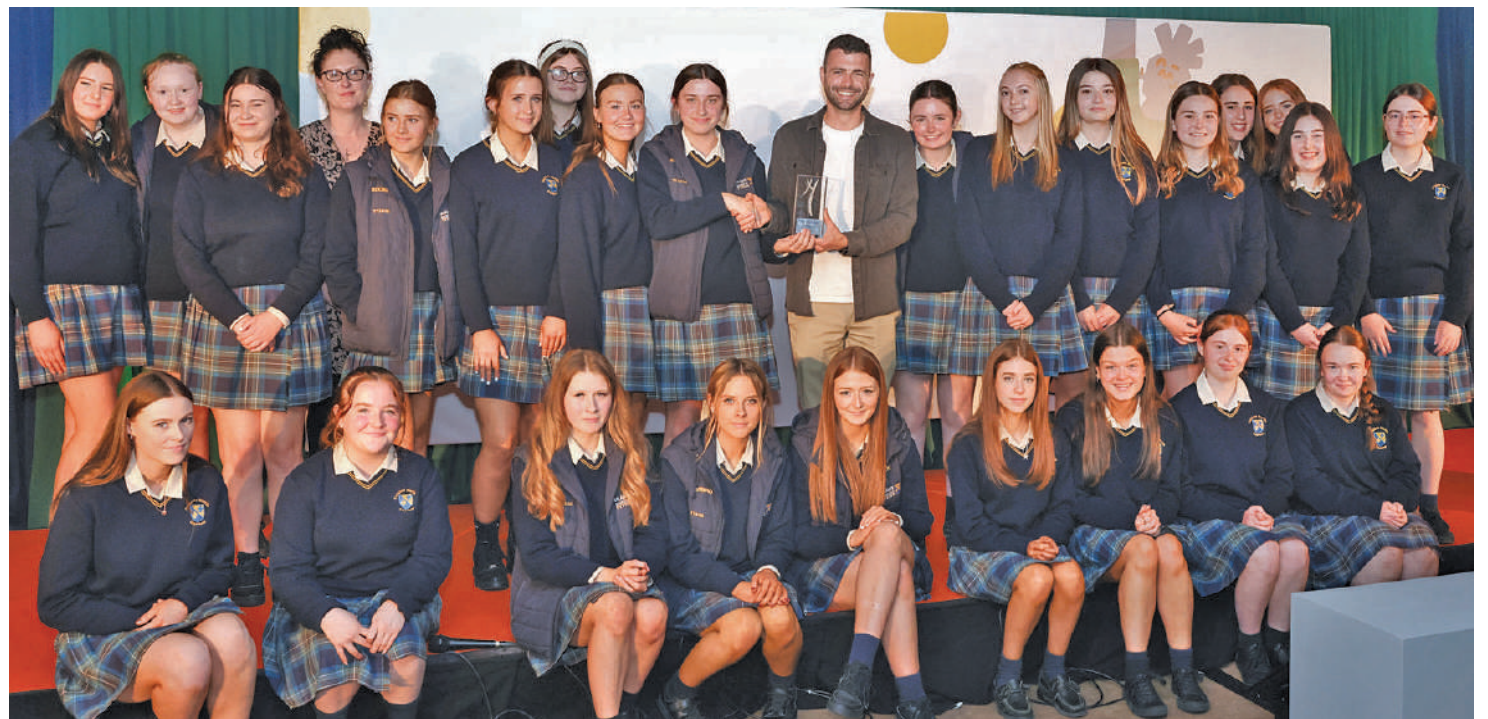
Students from Colaiste Bhride Carnew, who won the Spirit of YSI Award for their 'Take a Stand, Change the Band' project, which saw them tackle challenges they identified with the junior cert grading system.