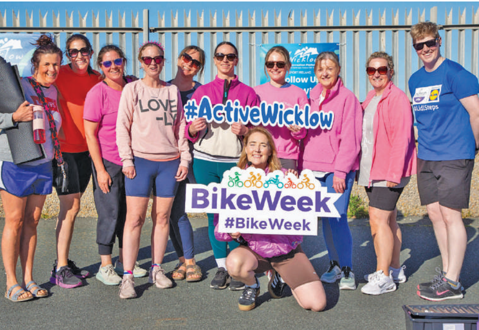
The Disco Yoga Dancers at the Wicklow Sports Partnership Bike Week event in the Murrough Car Park, Wicklow Town.

was incredible. It's days like this that remind us of the power of sport and recreation to bring people together."