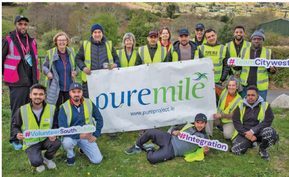
Friends of the South Dublin Uplands Pure Mile Team.