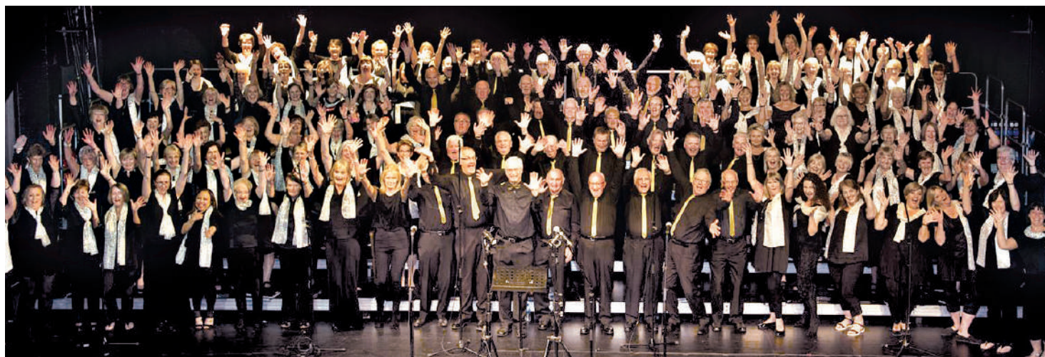
Bray Community Choir.