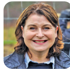
GLEN OF THE DOWNS Page 5