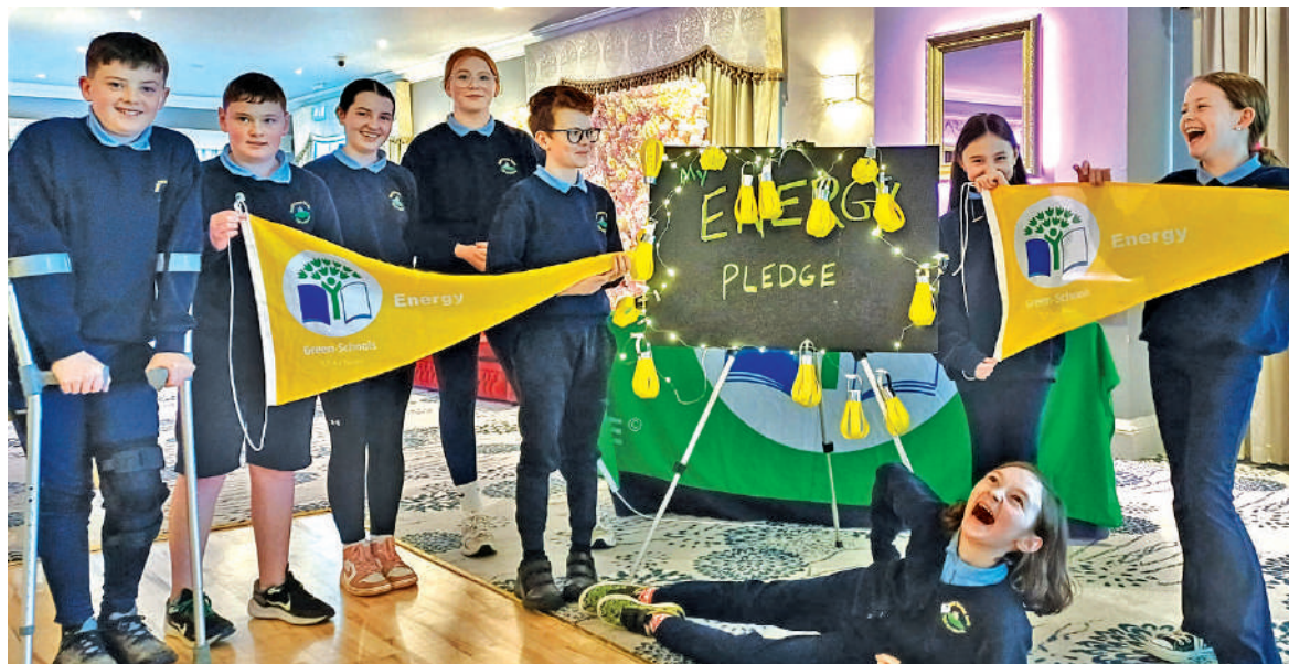
Students from Scoil Treasa Naomha attending the workshop.