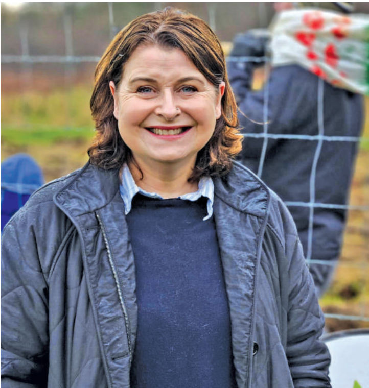
Jennifer Whitmore TD.

called for the Government to use the Climate and Nature Fund for this purchase. Since then, Deputy Whitmore has been working with local residents and Tanaiste Simon Harris to get this over the line, but progress has stalled. "I am calling on the Government to get things moving on the public purchase of the Glen of the Downs. This is a once in a lifetime opportunity to greatly expand our ancient woodland and enhance the Glen of the Downs nature reserve, and the Government must stop dragging its feet," Deputy Whitmore concluded.