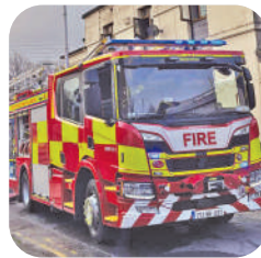
BRAY FIRE Page 3