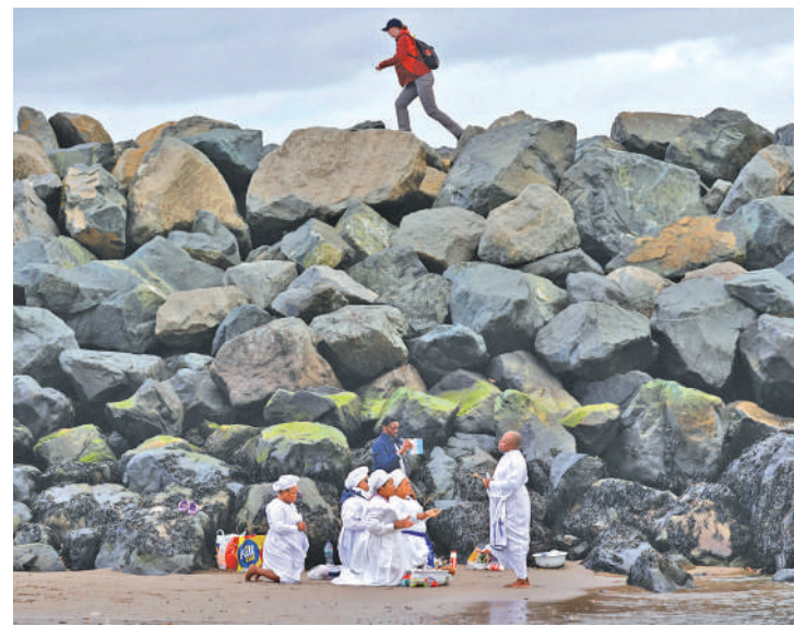
Daily Life - 3rd place winning

Awards were presented across 11 distinct categories - News, Daily Life & People, Sports Action, Sports Feature, Portrait,