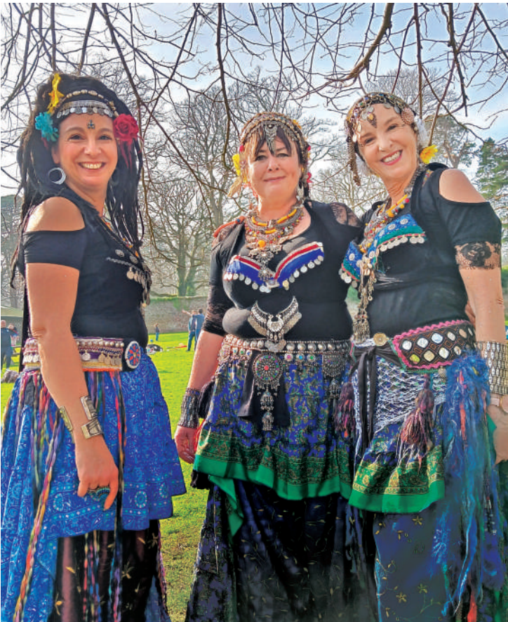
Zoryana Dancers at Tree Festival at Belmont Demesne.