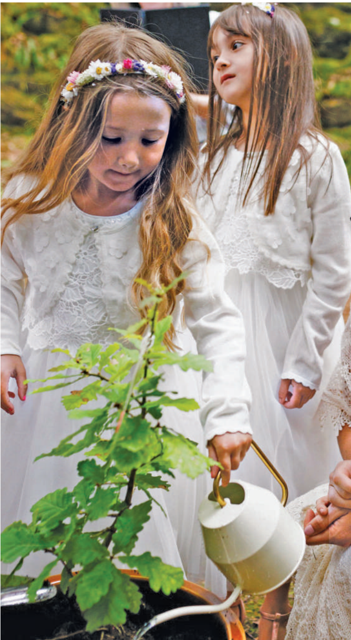
Winning photo from St. Laurence O'Toole's National School, Roundwood.

Michael Healy-Rae T.D., Minister of State for Forestry, Farm Safety and Horticulture said, "I want to commend Coillte and the Tree Council of Ireland on this initiative. Planting trees and spending time in forests is so very beneficial for our health and well-