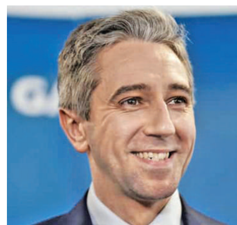
Tánaiste Simon Harris TD.

"Life after retirement should be active, connected, respected, secure, and independent, just as it is before. We need to be bolder and more ambitious in how we achieve this. Under Fine Gael in