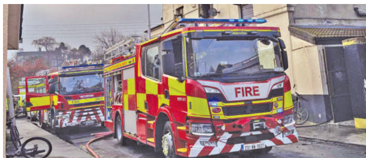
Fire crews on the Lower Dargle Road last Monday.