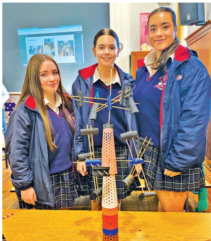
Students at St Mary's College, Arklow.