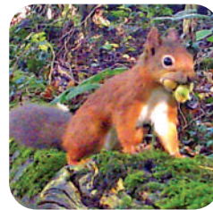
WOODLANDS Page 8