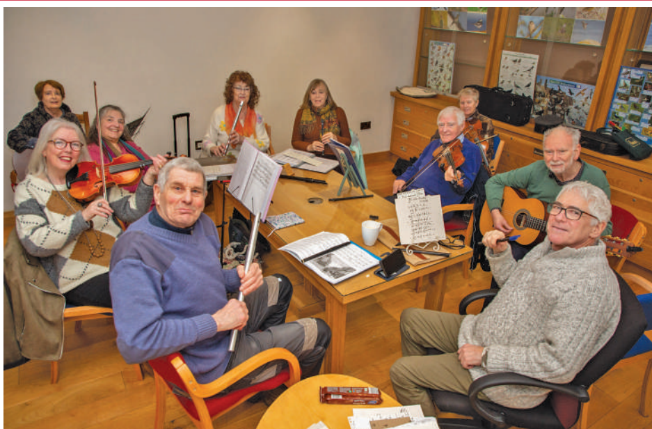
Pictured are members of the Session 55 music group which meets on Fridays in Ashford Heritage Centre from 11am to 1pm. The group is for amateur musicians aged over 55.

www.wicklowtimes.net or email info@localtimes.ie and we will email you a copy!