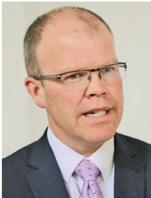
Aontú Leader Peadar Toibin TD.

Aontú Leader Peadar Tóibín TD has criticised the government 'for declaring war' on neutrality after the Tánaiste admitted Irish troops could be deployed as part of EU missions once legislation that the Cabinet approved last week to dismantle the triple lock, is approved.