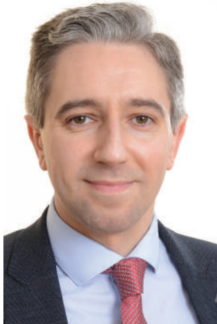
Tánaiste Simon Harris TD.

"On top of this these projects boost local tourism, reduce congestion, and promote healthier lifestyles, as well as enhance the county's reputation as a hub for sustainable transport."