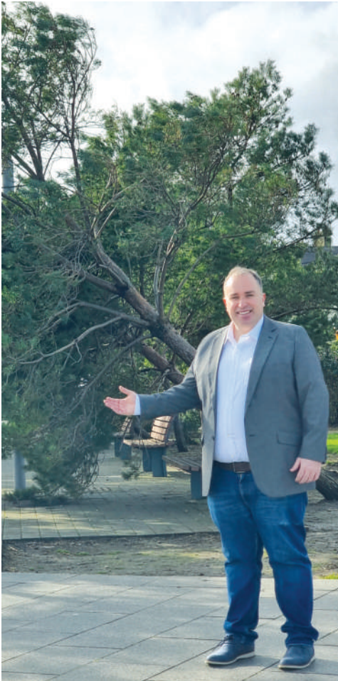
The damaged tree before repairs.