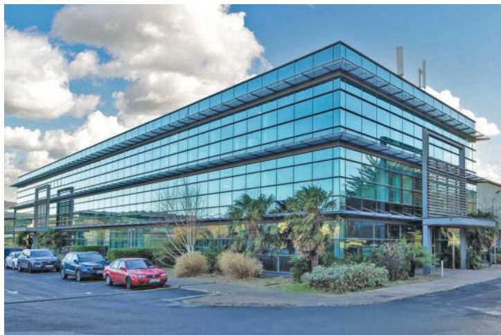
A 10,000 sq.ft Regus branded business centre will open at the former Oriflame facility in the IDA Business Park, Southern Cross Road, Bray.

With explosive market growth as companies of all sizes adopt hybrid working for the long-term, it is predicted that 30% of all commercial real estate will be flexible workspace by 2030. With International Workplace Group, partners are able to capitalise on this fast-growing sector, while being supported by International Workplace Group's unparalleled experience. Hybrid working offers companies a significantly lower cost base with an average saving of €11,000 per employee.