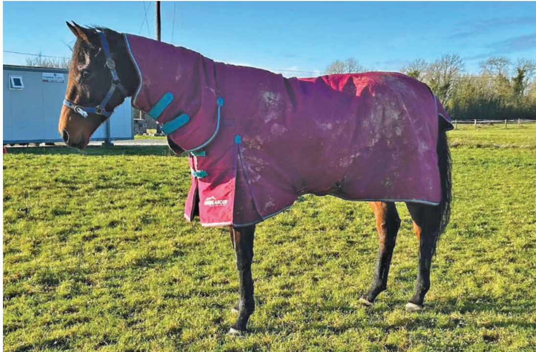
Dash on the road to recovery.

The ISPCA is appealing for homes for 25 rescued ponies, donkeys, and horses, currently in care and ready to find their forever homes.