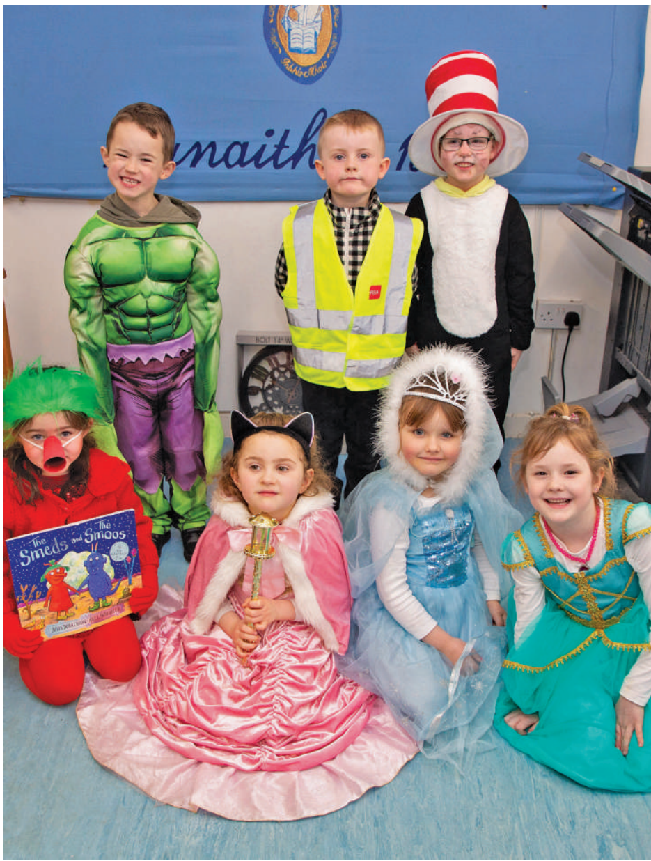
Naíonáin bheaga celebrating World Book Day at Gaelscoil an Inbhir Mhóir in Arklow last Thursday.

This funding is part of a broader €360 million investment in walking and cycling infrastructure for 2025, which includes €74.5 million allocated specifically for Greenways.