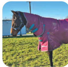
ISPCA APPEAL Page 4