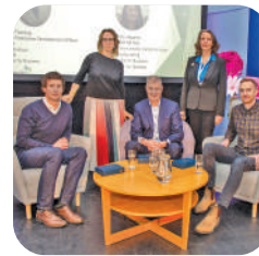
LEAN FOR BUSINESS Page 6