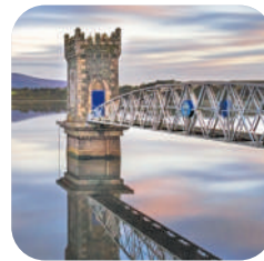
VARTRY TRAILS Page 11