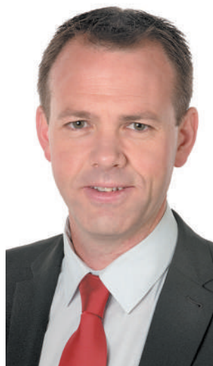
John Brady TD.

Sinn Féin TD John Brady, has called on Wicklow County Council and the Department for the Environment to take immediate action to secure the 21-acre site at Magheramore Beach, which is due to go to public auction later this month.