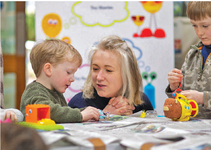
PlanIt Play workshop in Enniskerry.