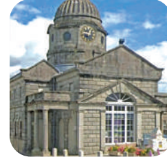
HISTORIC BUILDINGS Page 10