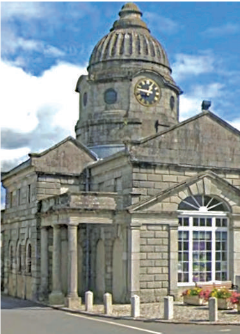
Market Square, Dunlavin.