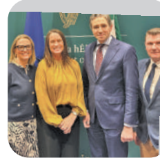
CLIFF WALK Page 3