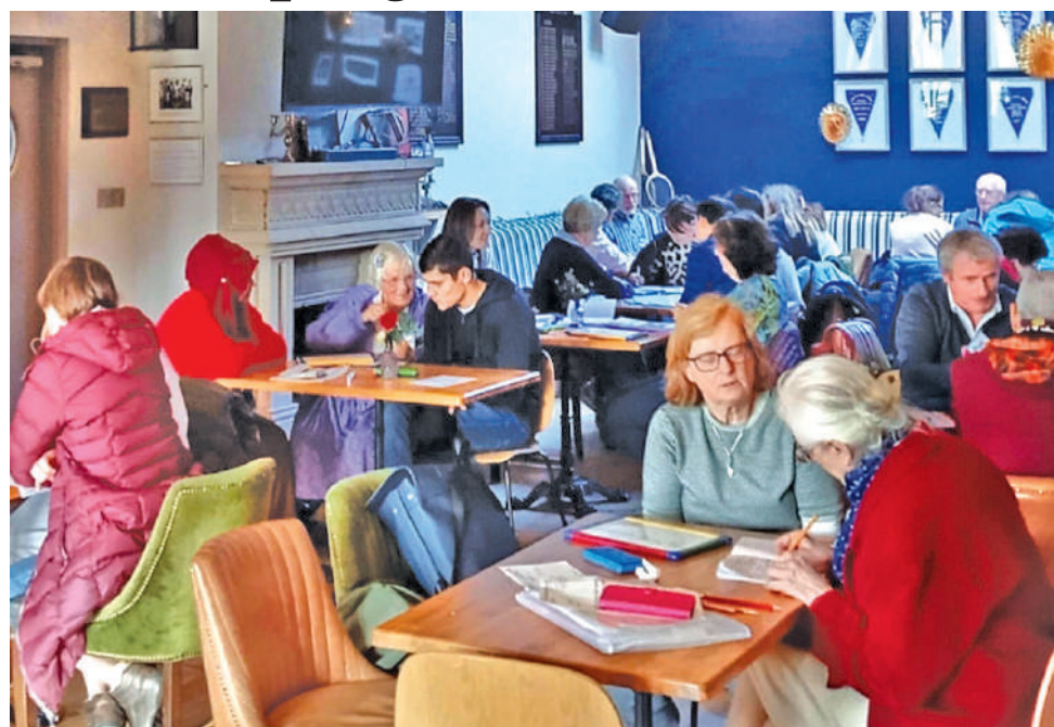
Failte Isteach's free conversational English classes.

This programme is resourced through the Social Inclusion and Community Activation Programme (SICAP) which is co-funded by the Irish Government, through the Department of Rural and Community Development, and the European Social Fund Plus under the Employment, Inclusion, Skills and Training (EIST) Programme 2021-2027.