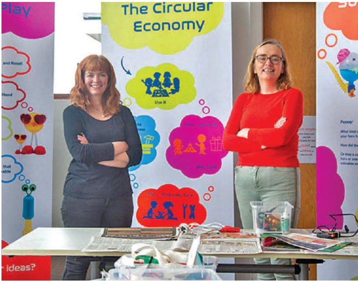
PlanIt Play workshop in Greystones.

The Wicklow Library service supported the project through facilitating the delivery of the workshop in Enniskerry, Bray, Ballywaltrim, Greystones, Wicklow, Arklow, Rathdrum, Tinahely, Baltinglass and Blessington. Bray Librarian Vita Coleman said “Bray Library was delighted to host Plan-It-Play workshops in 2024. The combination of thoughtful preparation and playful exploration resulted in a dynamic, creative and fun experience for all participants who came away with practical and accessible ways to step out of linear patterns of consumption and into the circular economy. This is especially relevant to the