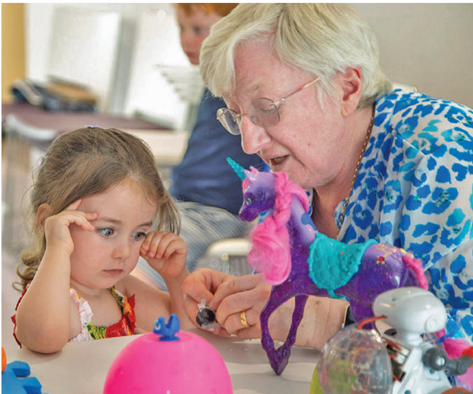
PlanIt Play workshop in Wicklow Town.