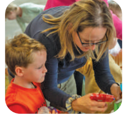
CLIMATE ART Page 14