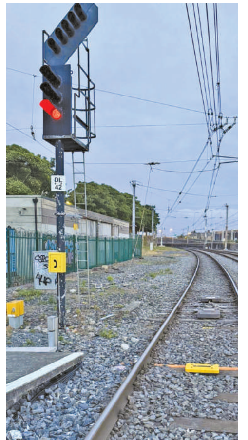
Irish Rail signalling equipment.