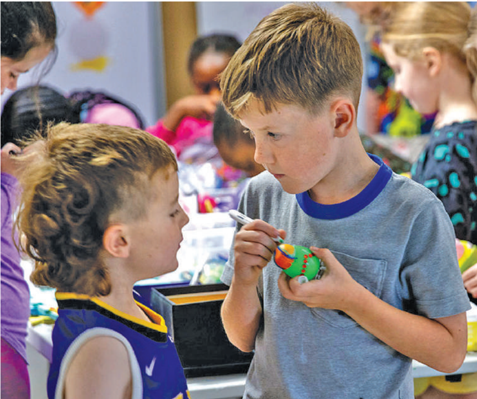
PlanIt Play workshop in Baltinglass.