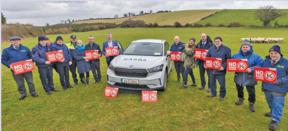
IEA members launching the 2025 'No Dogs Allowed' campaign in Newcastle

8. Authority to apply the legislative obligations to dogs in border regions owned by persons not resident in the State.