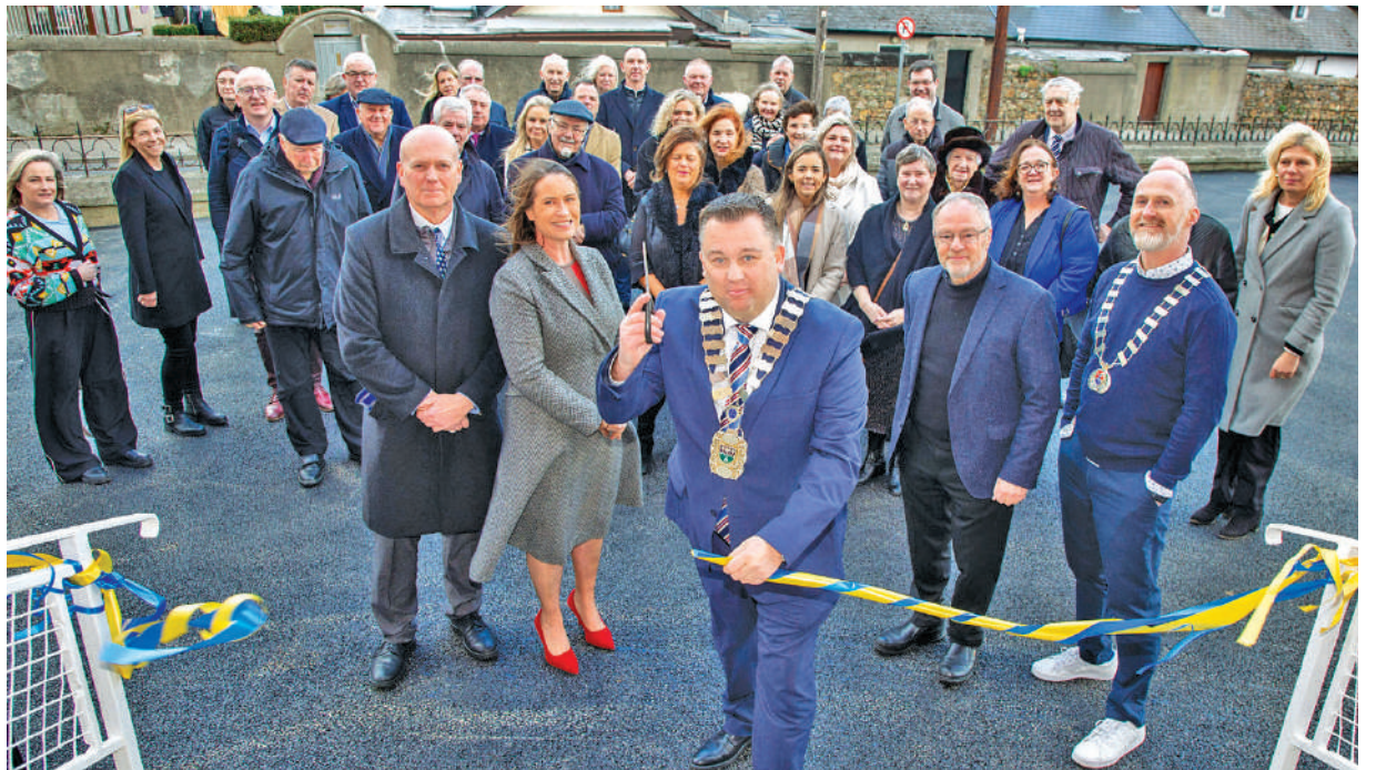
Wicklow County Council officials, members of the Holy Redeemer Parish and local elected councillors, celebrating the opening.