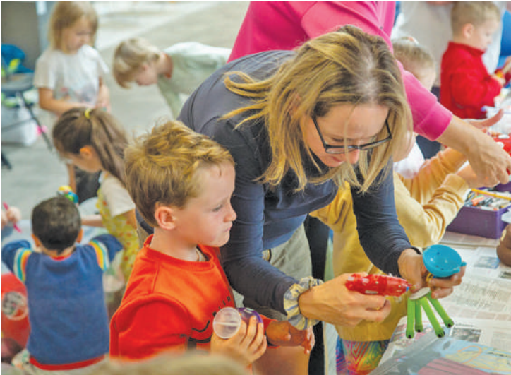
PlanIt Play workshop in Arklow.

The PlanIt Play project is a collaboration between art and science with the aim of seeking some solutions around making toys more environmentally friendly while having fun. The PlanIt Play book launch took place Mermaid Arts Centre on February 15th.