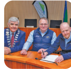
CHAPEL ROAD Page 6