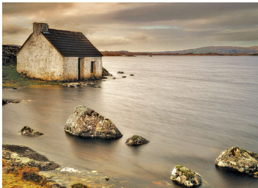
Joe Silke came first place in the 'Heritage on the Coast' category as part of the 2024 Clean Coasts Love Your Coast Photography Competition. "Fisherman's Hut" taken in Connemara, Galway captures an ancient cottage beside one of the many loughs in South Connemara.

Building on Clean Coasts' 2025 theme of connection, the competition encourages photographers to capture the intersection of Ireland's captivating coastal beauty, rich heritage, and biodiversity, alongside the deep bond shared by those dedicated to protecting and preserving these vital blue spaces. This year we are asking photographers to think about how spending time by the coast fosters a deeper connection to ourselves, nature, and our communities when taking their photos.