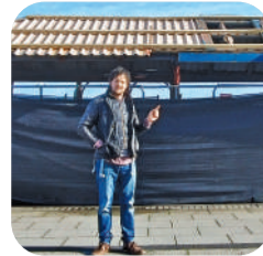
BRAY'S BENCHES Page 10