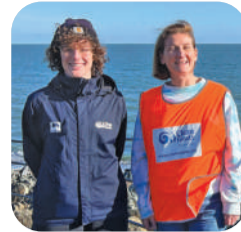
CLEAN COASTS Page 4