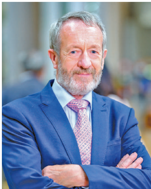
MEP Sean Kelly.

MEP for Ireland South and Leader of Fine Gael in the European Parliament, Sean Kelly, has urged Ireland's new Minister for Energy, Darragh O'Brien, to make the delivery of Ireland's Phase 1 offshore wind projects a critical priority for his Department. Highlighting the transformative impact of these projects on Ireland's energy security, competitiveness, and transition to net zero, MEP Kelly called for urgent action from the Minister to ensure they are accelerated.