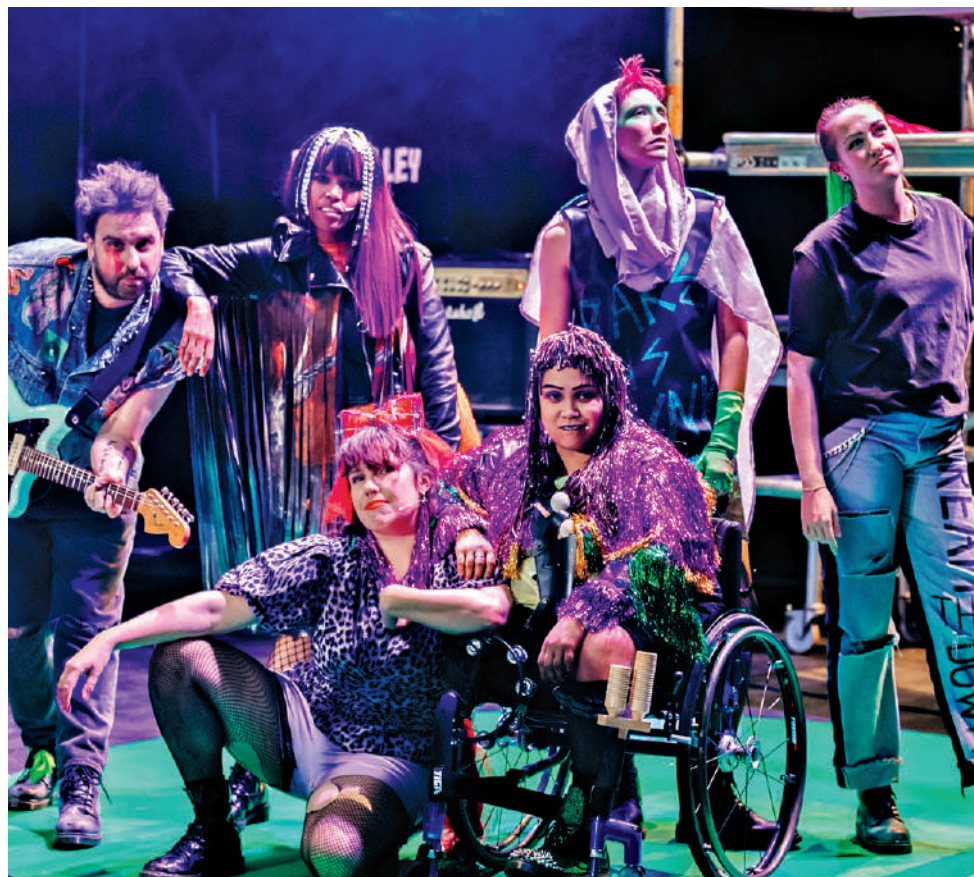
Moxie Brawl present Punk Alley.

and anything could happen. Book through mermaidartscentre.ie or call Box Office 01 272 4030.