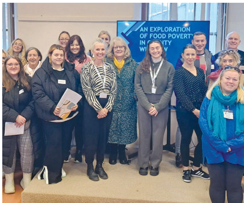
Participants at the The Food for Thought think tank event in Bray.

tical ways to enhance food provision for those in need. Many participants expressed appreciation for the opportunity to connect with other