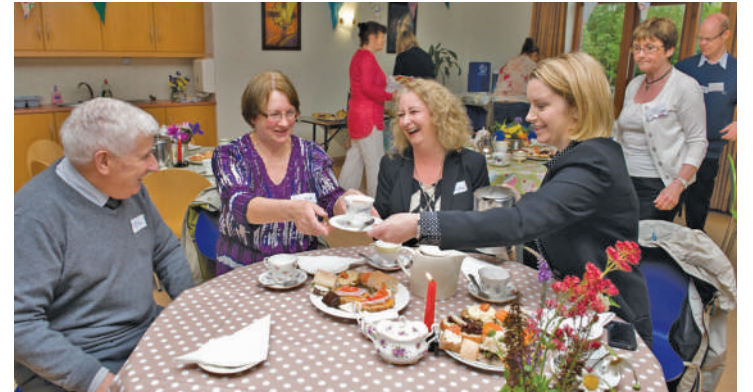
A memory café event in full swing.

Dementia can be a challenging condition for both individuals and their loved ones. But there is support available, and one great way to connect with others facing similar experiences is by attending a Dementia Café.