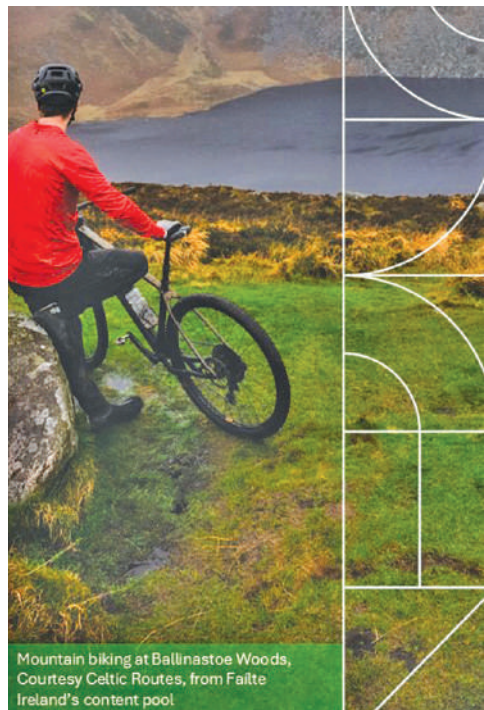
Mountain biking at Ballinastoe Woods