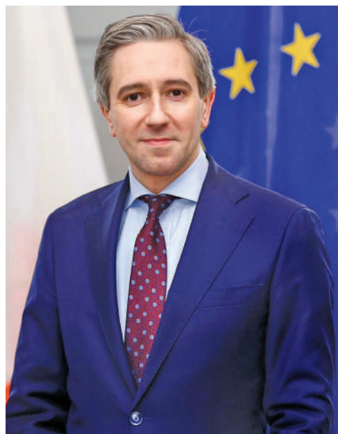
Tánaiste Simon Harris TD.