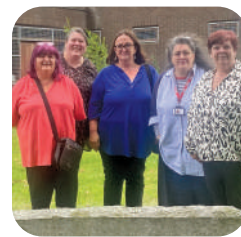
BRAY COURTHOUSE Page 8