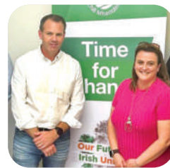
BRADY SELECTED Page 6