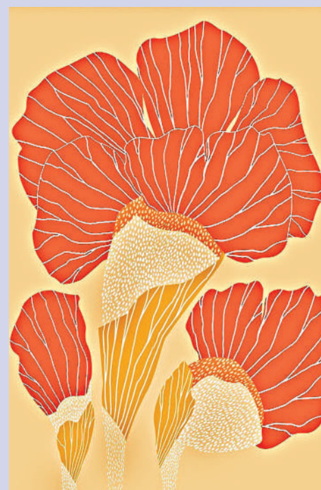
'First Bloom' by Stephanie Sloan.

highlights include two solo shows at Wilton Gallery, Dublin in 2020 and 2021 and inclusion in groups shows Twenty One at Mermaid Arts Centre, Bray 2023 and Adspatium in Gavle, Sweden 2022 and Woolwich Print Fair, London 2023.