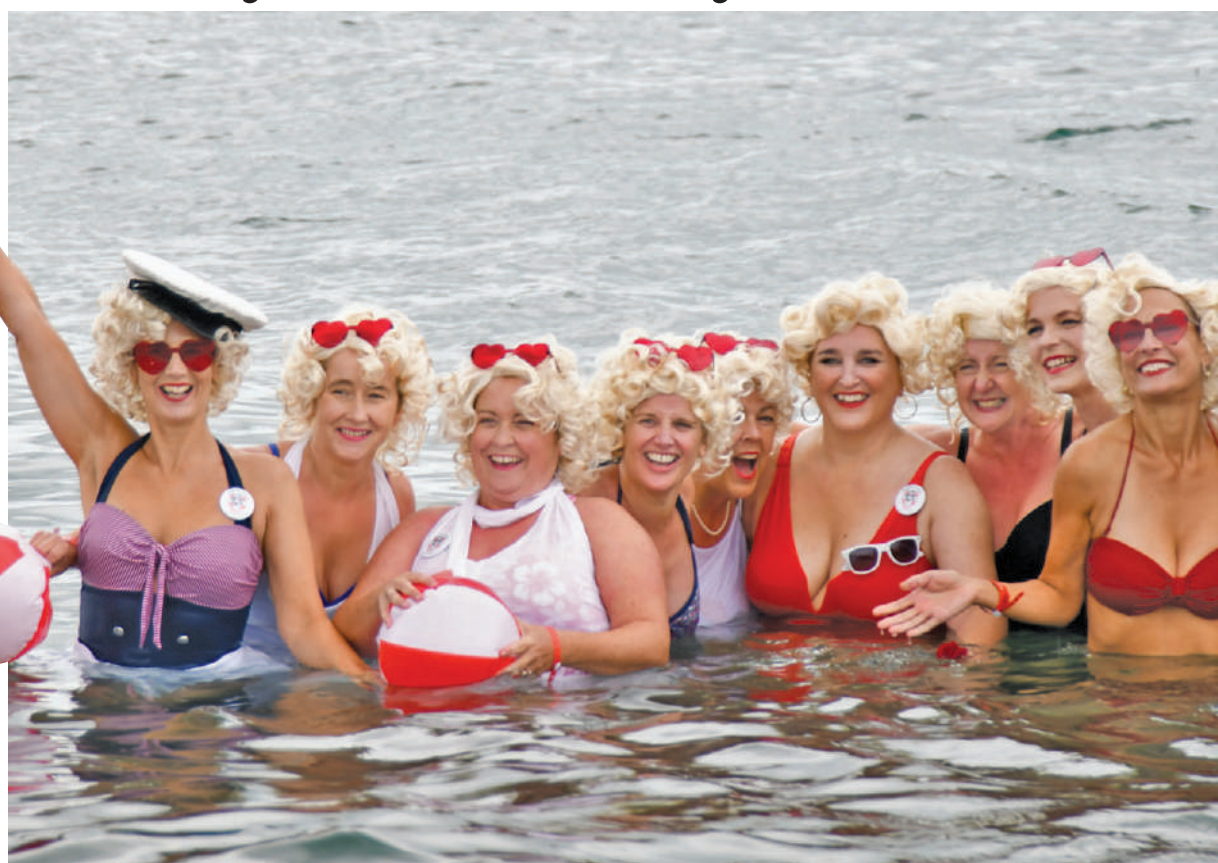
Some of the magnificent Marilyns who took part in the Mater Paddle inaugural event held in Bray by the Mater Hospital Foundation.

You can support women's cancer care by donating at www.materfoundation.ie/marilyn .