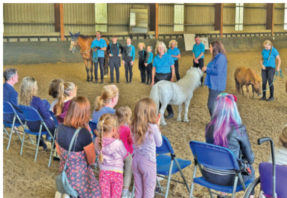
Vaulting & Outreach Team with staff, students, ponies and patrons of Festina Lente.

Festina Lente was this year's Positive Strides equine charity at the RDS Dublin Horse Show, an initiative sponsored by Mannon Farm to celebrate and raise awareness of the positive impact of equestrianism on society. Introduced in recent years and growing significantly year on year, Positive Strides helps to highlight the positive impact of engaging in equestrian activities for physical and mental wellbeing.