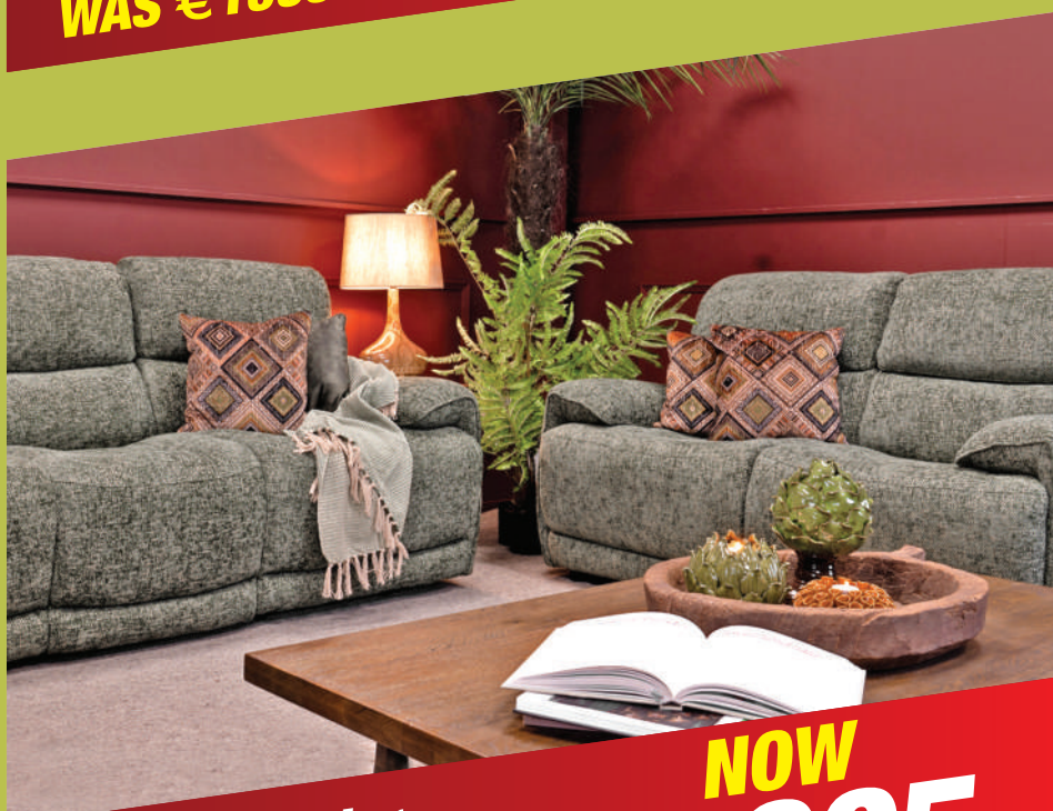
Selene 2 Seater fixed sofa WAS €1435