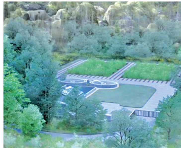
Aerial view of the site of proposed Avoca wastewater treatment plant.

Mr Delaney added, "This project showcases Uisce Eireann's drive for innovation and commitment to sustainability. Constructing new reed