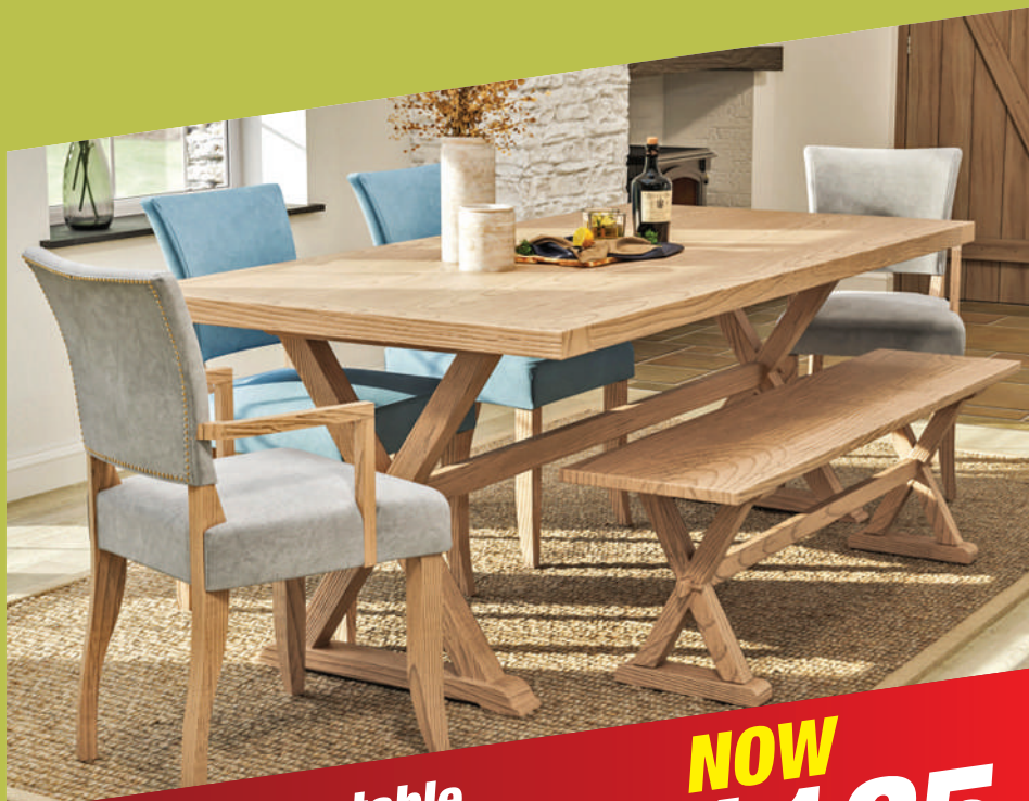
Valent dining table 2.1M WAS €1395