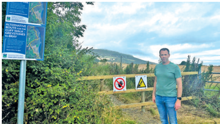
John Brady TD at the Bray to Greystones Cliff Walk.

"I have written to the Minister for Tourism Catherine Martin stressing the importance of the cliff walk to the Greystones and Bray areas, and the need for the necessary work to be carried out as soon as possible, to allow the cliff walk to be reopened as soon as it is possible to do so. The walkway is a valued tourist attraction, and as a route through sites of natural beauty enjoyed by local people."