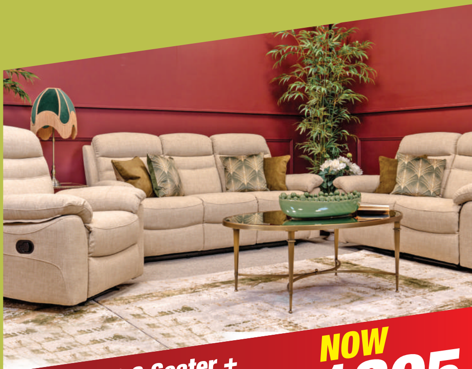
Arvo 3 + 1 3 Seater + Armchair WAS €2290