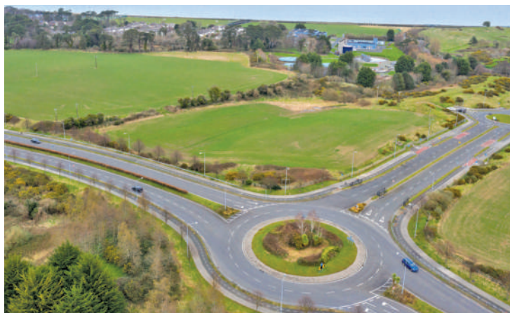
The site of the new media campus in Charlesland.

not acceptable that the government be allowed to wash its hands of its responsibility for ensuring that the Media Campus is completed. Not only is there significant taxpayer investment to the tune of €24 million, but there is also social investment by the people of the Greystones area, and a reputational and future skills investment by the Irish Film and Media industry. The government needs to step up here and do its job."