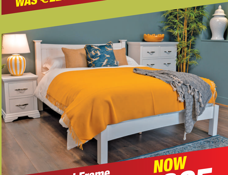
Layla 3ft Bed Frame (Photo shows Double) WAS €595