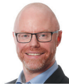
Minister Stephen Donnelly.

Minister for Health Stephen Donnelly has welcomed improved health service connectivity for customers travelling from Wicklow to St Vincent's Hospital.