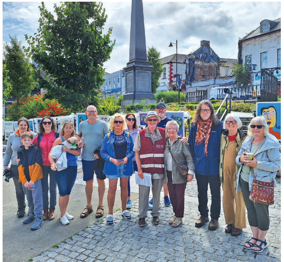
Group which took part in recent Heritage Trail walk.

For further information on the Wicklow Town Heritage Trail, visit www.wicklowtown.ie .