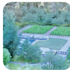
AVOCA WASTEWATER Page 13