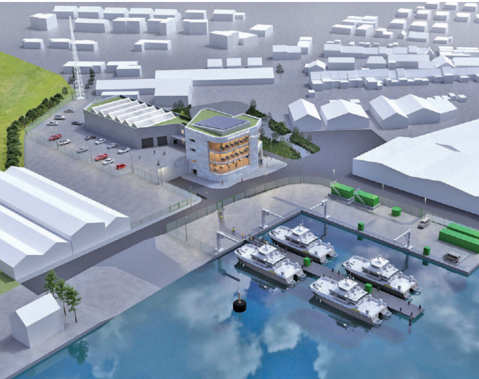
Architect impression of O&M base for Arklow Bank Wind Park.

Tel: 01 286 8119 Mobile: 087 664 1866 www.marrakeshltd.com