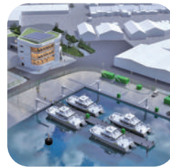
SSE WIND FARM Page 6