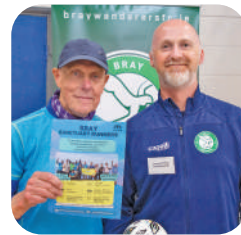
WELLBEING FAIR Page 4