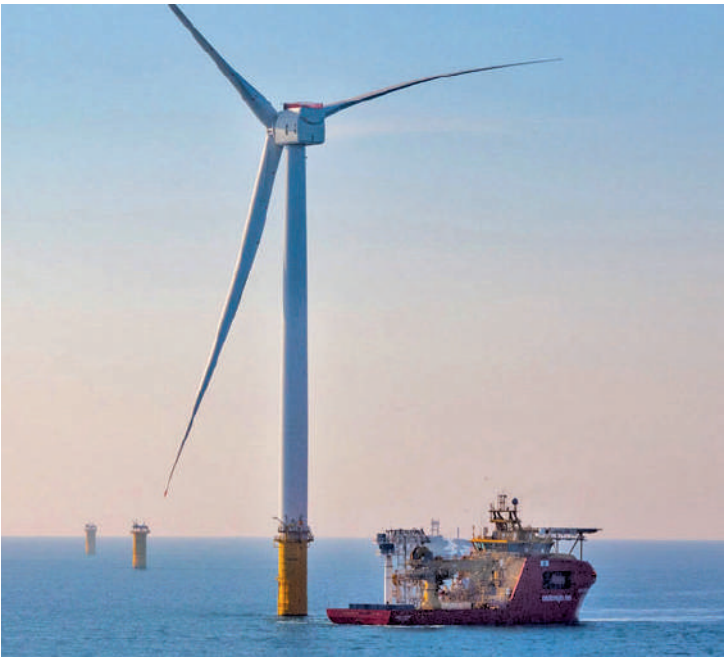
Dogger Bank Wind Park.