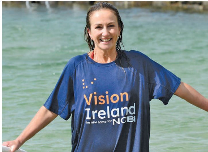
Vision Ireland Dip at Dawn ambassador Lorraine Keane.