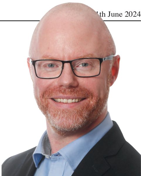
Minister Stephen Donnelly.

responses to the healthcare needs of the population, and we must deliver improvements that respond to changing demographics. "I'm confident that this plan will help to deliver a better service for people across the South East. We're building on the significant developments in the region in the last few years and with additional capacity in acute inpatient beds we are moving closer to our goal of ensuring that people receive the right care in the right place at the right time."