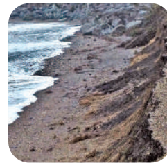
MURROUGH Page 5