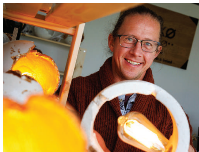
Maciej Grzechowink, Kaiko Studio.

The exhibitor from Wicklow was Linda Lexdina, founder and co-owner of Kaiko studio. Kaiko were delighted to announce the launch of their new Cherry Red Collection; Cherry Red Concrete spheres. Embrace the cherry red colour trend to create a striking and inviting atmosphere that reflects contemporary style. Also new to Bloom is Kaiko's exciting new collection of geometric leaf earrings and necklaces. Elevate your style with their brass earrings featuring a captivating fusion of delicate leaves and geometric shapes. These earrings exude a sense of modern sophistication and natural allure.