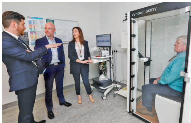
Minister for Health Stephen Donnelly T.D. visiting staff and patients in the Integrated Care Hub, Bray

To date, the respiratory team in the hub have referred 33 patients to the HSE's smoking cessation service. QUIT smoking services are available in multiple locations, including the Bray Hub, and offer in-person support and access to free nicotine replacement therapy (NRT). The service also accepts self-referrals.