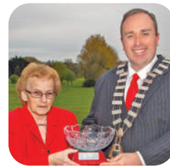
GREYSTONES AWARDS Page 10-11