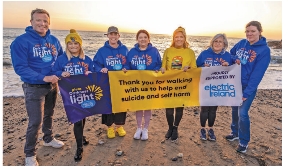
The Greystones Darkness Into Light organising committee

By participating in the event, supporters can make a real and tangible difference, as the €26 sign-up fee for Darkness Into Light can enable Pieta to answer two calls to their 24/7 helpline, providing immediate support and guidance to those in crisis.