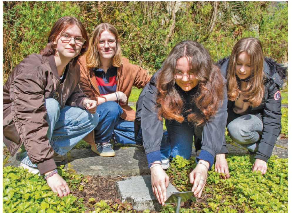
Students from Eichendorffschule tending to the graves of German soldiers in Glencree.