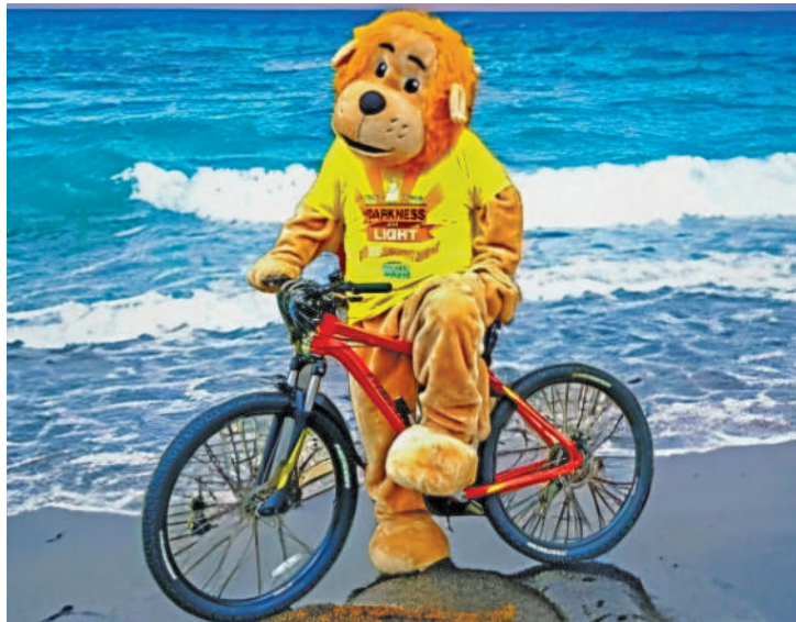
Leo the Lion getting in some practice for the 2024 Darkness into Light charity walk/run for Pieta.