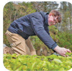
GLENCREE VISIT Page 12