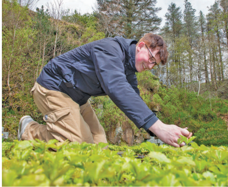
One of the visiting German students places a new QR code on one of the graves at the German Graveyard in Glencree

For the third time, students and teachers from the Eichendorffschule in Wolfsburg, Germany, visited the German War Cemetery in Glencree on Saturday 20th April, to honour and preserve the memories of those buried there.