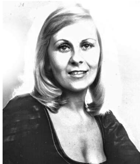
Eurovision '74 promo photo