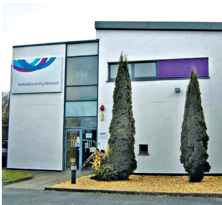
National Learning Network, Bray