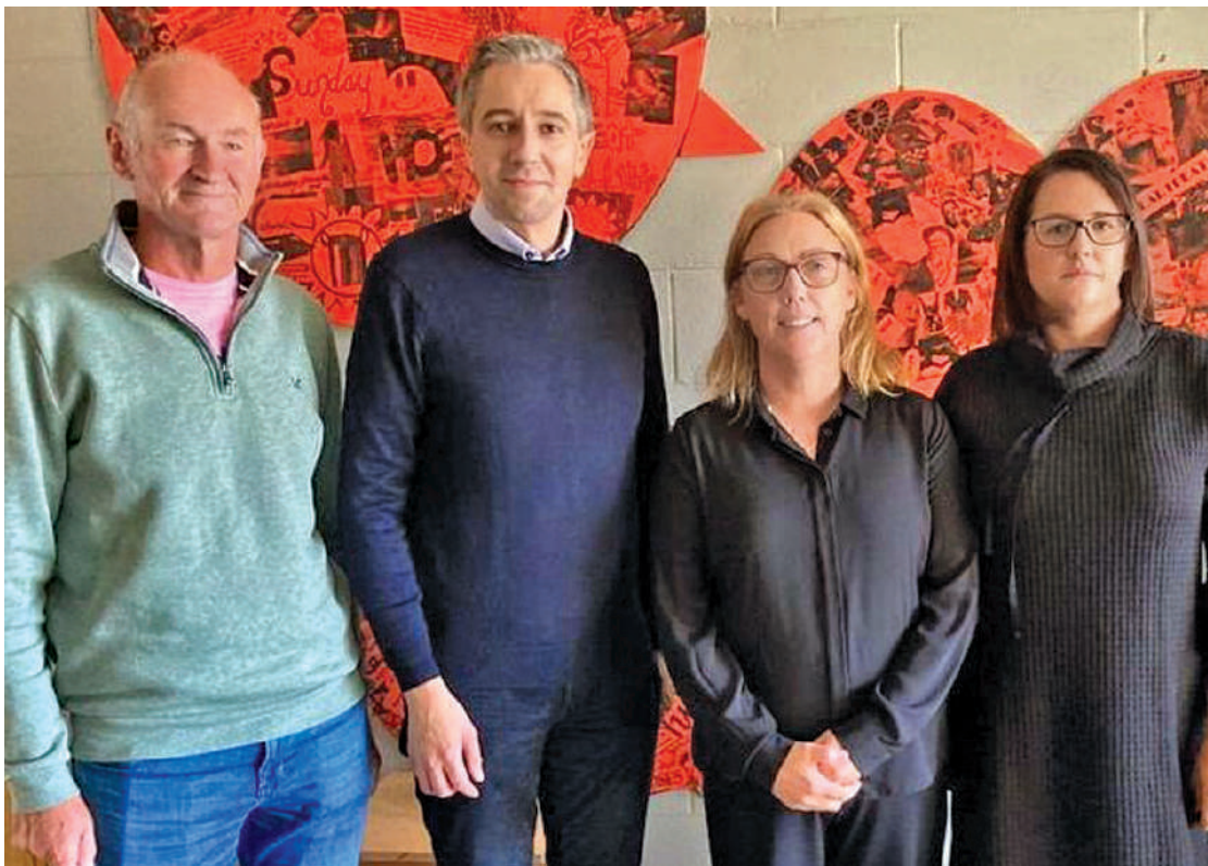
An Taoiseach Simon Harris with members of staff from Newcourt School in Bray

An Taoiseach Simon Harris concluded: "I want parents of with children with additional needs to know that as Taoiseach I will continue to stand on their behalf so that their voices are heard. What I want to see is schools delivering across the county comprehensive national curriculum subjects at both junior and senior cycles, which are specifically designed to build on individual strengths, fostering progression and smooth transitions for students. One of my core values is Equality of opportunity and the people of Wicklow can count on me to deliver on my promise for a more equal Ireland."