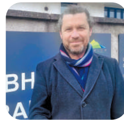
LIBRARY FUNDING Page 8