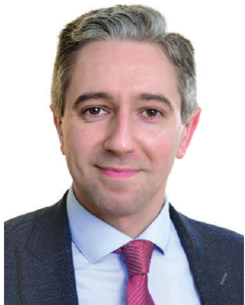
An Taoiseach Simon Harris

Construction of the new Ballywaltrim Library is expected to span approximately 18 months. During this period, the current library will relocate but continue to serve the community with minimal interruption. Further details on the construction will follow in due course.