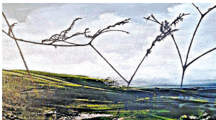
Silent Wind by Paula Kearney

The paintings themselves marry the two mediums of oil paint and graphite. The brush cre-