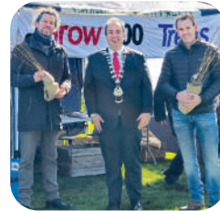
TREE FESTIVAL Page 2