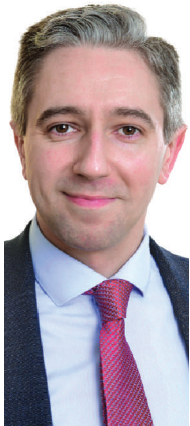
Minister Simon Harris

The new leader of Fine Gael has said businesses will continue to be supported and their challenges will be responded to at a meeting with a party representative group.