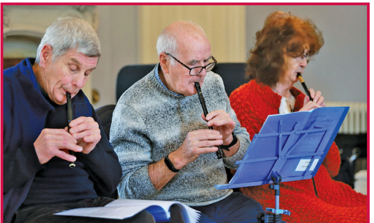
Making music again - County Wicklow residents aged 55 and over have been reconnecting with the instruments they use to play with the Rosanna Trio as part of the Wicklow Teaching Residency, a partnership with Wicklow County Arts Office and Music Network. Last week in Clermont House, Rathnew, 15 residents from the Wicklow area graduated from the Wicklow Teaching Residency.

According to Sinn Féin TD John Brady, a letter from the Attorney General Rossa Fanning makes it clear that the amendment is based on a single decision by Wicklow County Council regarding a planning application by Cairn for 98 units in Greystones. Deputy Attorney General's letter suggests that the wording of the amendment, based on the wording contained in the decision by Wicklow County Council, would not be appropriate for other Local Authorities and may need further amendments. It has been revealed that Minister for Housing Darragh O'Brien's political advisor met with representatives of Cairn construction following the decision of Wicklow County Council to refuse planning permis-