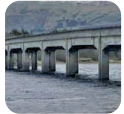
BLESSINGTON PLAN Page 10