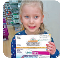
LIFE CHANGER Page 4