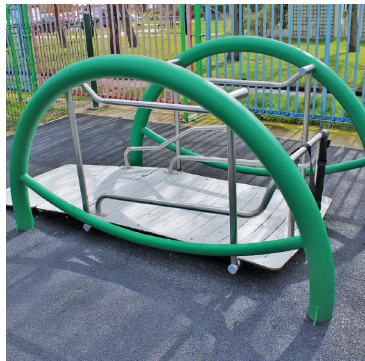
The newly installed inclusive swing in Seaview Playground