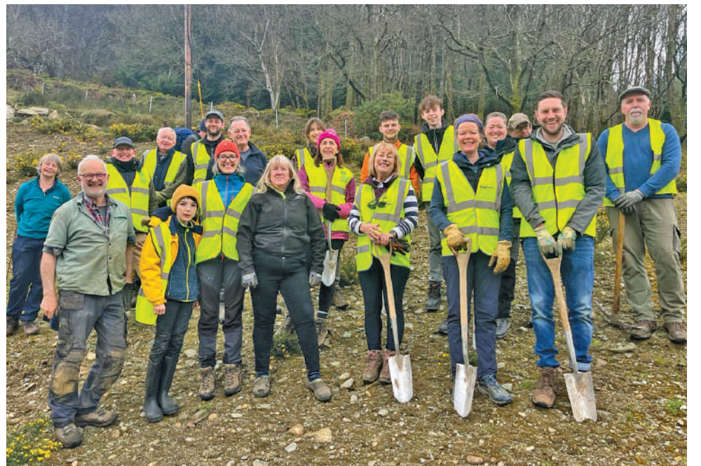
ReWild Wicklow and Laragh and Glendalough Tidy Towns Volunteers Planting Trees at Glendalough

already undertaken. If elected to Wicklow County Council in June I will campaign to have the funding allocated to the Tidy Town groups increased, as it is such a good return on investment for maintaining our towns and villages and making them enjoyable places to live."