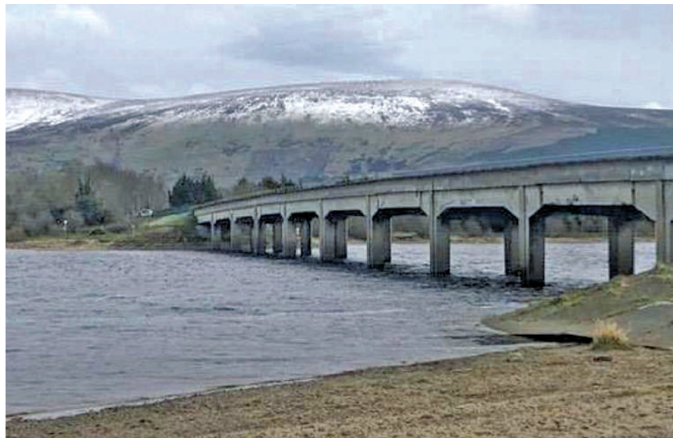
Vallemount Bridge, Blessington