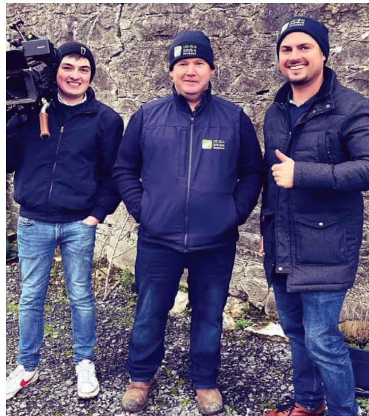
Filming The Future of Food