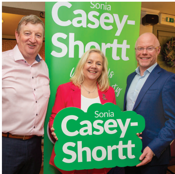
Sonia Casey-Shortt with Senator Pat Casey and Minister Stephen Donnelly, at her campaign launch in Kavanagh's, Roundwood

15% below market rates, and the serviced sites program, both of which serve as exemplary models for future development.