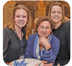
MADE IN WICKLOW Page 13