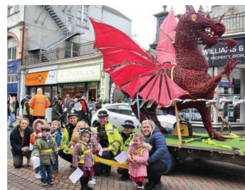
Holyhead's Red Dragon, Holyhead police and Holyhead children pictured at last year's St. David's Day Holyhead Parade

The RMS Leinster was an Irish ship operated by the City of Dublin Steam Packet Company. She served as the Kingstown-Holyhead mailboat until she was torpedoed and sunk by a German submarine on 10 October 1918. The Greystones/Holyhead Twinning Partnership is now in its twelfth year.