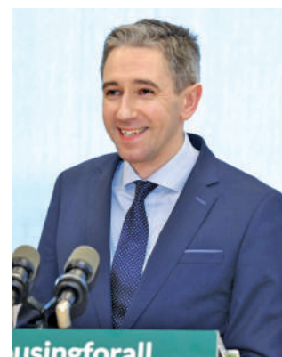
Minister Simon Harris

"Last year we started these programmes with a small number of courses and today we announce over 40 new courses starting in