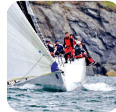
ROUND IRELAND Page 8