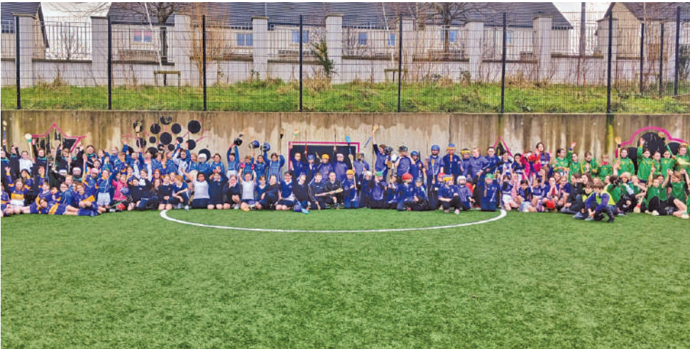
Young camogie players at the blitz in Greystones

Our Young Whistlers from various schools did a brilliant job with officiating the games. Credit must also go to all the teachers, SNAs and parents who volunteer to train and bring teams to events such as these throughout the year. Finally, a massive thanks has also to go to Greystones CNS who hosted the event on the day. The abundance of young camogie players in the North Wicklow area is a testament to the huge potential that lies within the future.