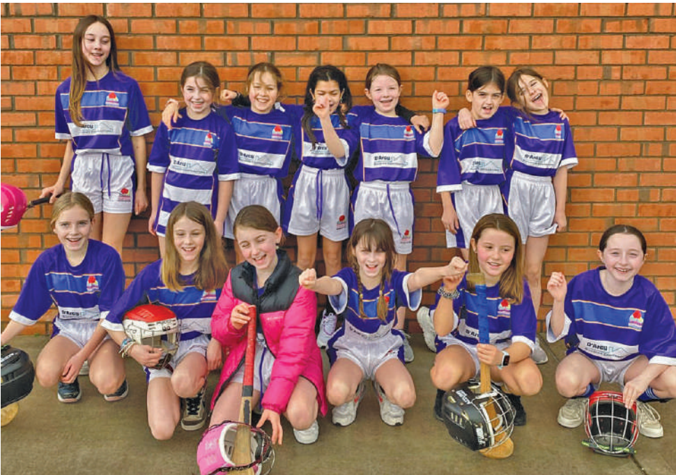
Greystones Community National School camogie team

There was a brilliant buzz in Greystones Community National School on Thursday 25th January as over 120 girls from 3rd and 4th class took part in a camogie blitz.