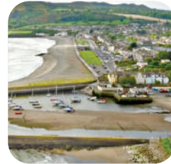
BRAY HARBOUR Page 6