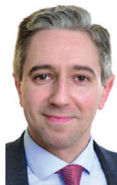
Minister Simon Harris