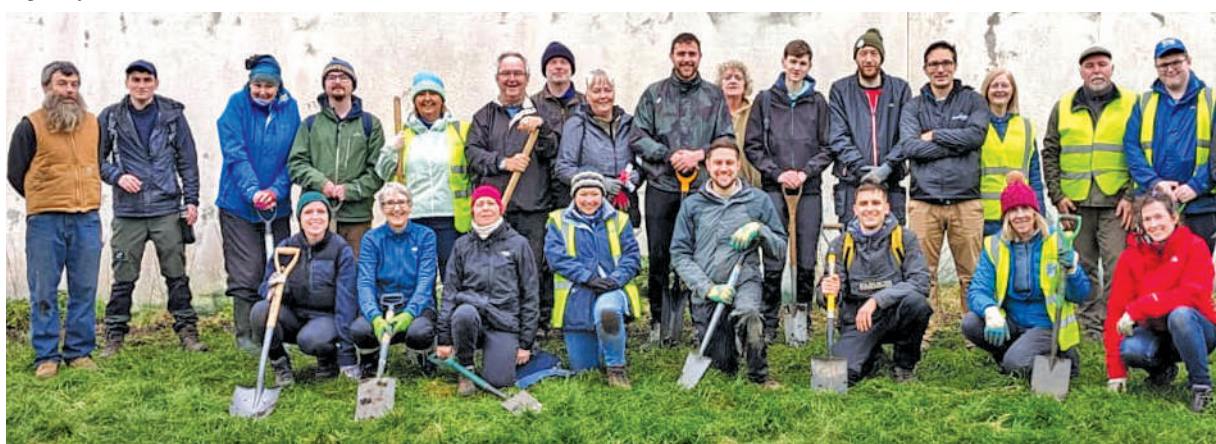
ReWild Wicklow volunteers planting 150 trees along the Leitrim River in Wicklow Town