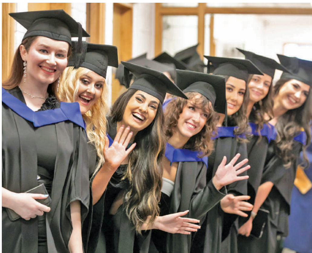
The final series of conferring ceremonies took place at South East Technological University (SETU's) campuses in Waterford and Carlow with the graduation of over 2,150 students and the awarding of two Honorary Doctorate awards. Pictured during conferring ceremonies at SETU's campus in Waterford were graduates of Bachelor of Arts in Applied Social Care.

Aligning with this year's global citizen theme, South East Technological University (SETU) is encouraging over 4,350 graduates to embark on their future path with a commitment to make a positive impact.