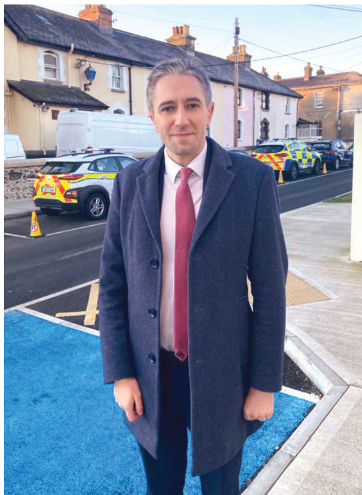
Minister Harris at Greystones Garda Station

Refurbishment works on Greystones Garda Station and car park resurfacing works are underway.