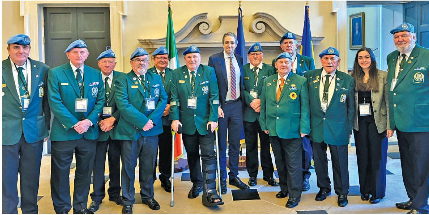
Minister Simon Harris with Wicklow UN Veterans Association members in Leinster House

Minister Simon Harris recently invited the Wicklow Branch of the Irish United Nations Veterans Association, Post 21, for a tour of the Houses of the Oireachtas, the Dail and the Seanad.