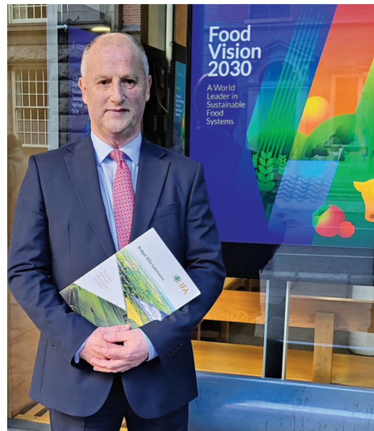
Senator Victor Boyhan

Senator Boyhan concluded his remarks by saying, "This government has committed to dramatically reducing emissions by 2030. We must ensure that rural Ireland is not left behind by incentivising people to make environmentally friendly choices that benefit them."