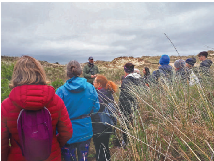
'Dawn in the Dunes' event for National Biodiversity Week (May 2022).

In a partnership between the Heritage Council and local authorities, the first heritage officers were appointed in 1999 in Kerry, Sligo and Galway with the aim of raising awareness of