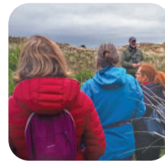
WICKLOW HERITAGE Page 15