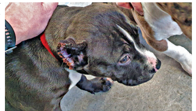
One of the American Bully pups with its cropped ears