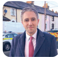
GREYSTONES GARDA STATION Page 9