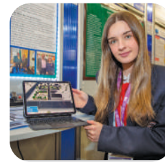
YOUNG SCIENTISTS Page 12