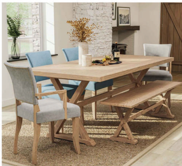
Valent Dining Table 2.4M