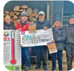
WILL'S PLAYGROUND Page 2