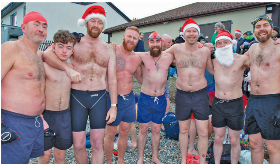
Some of the 'nippy dippers' at the St. Stephen's Day swim in Wicklow Town.

The book has a cover price of €20 with 100% of the proceeds going to the RNLI. It is available online from Nourish at https://lnkd.in/e_TtXj42 and also available to purchase in-store at 64 Wine and Caviston's Glashule Village and Cafe du Journal Monkstown. All stockists are selling the book at 0% commission.