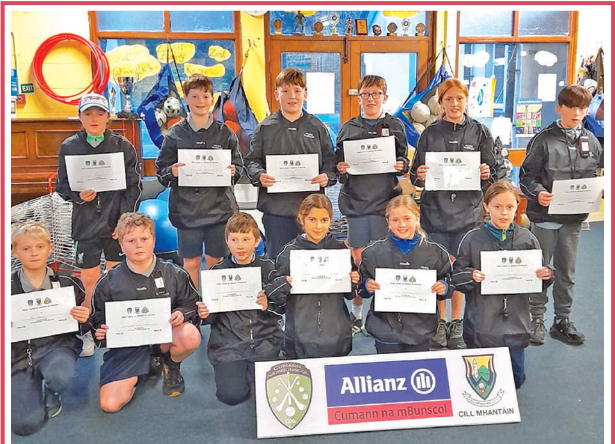
Cumann na mBunscol held a Young Whistlers referee course in Auhtrim for children in the south of the county. Well done to all the boys and girls who volunteered to be trained up as Young Whistlers and will be refereeing games in the future.