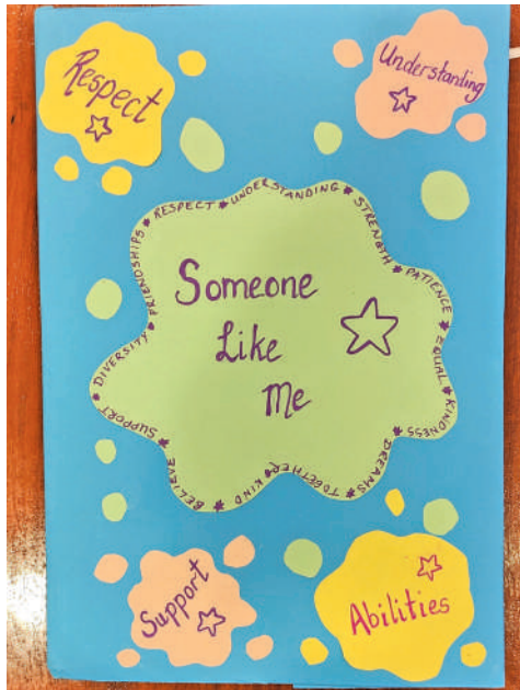
Senior entry COVER

Congratulating St Saviours National School and Scoil Mhuire Realt Na Mara Brittas Bay on being named County Winners, Minister of State with responsibility for disability, Anne Rabbitte T.D. said