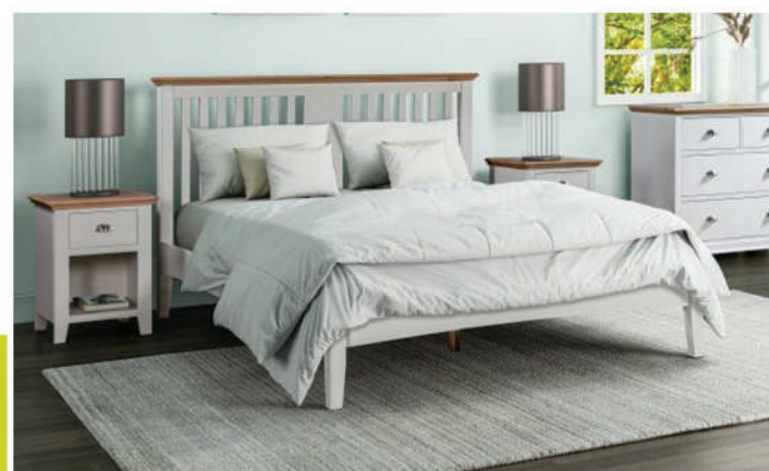
Angela 5ft Bed Frame WAS €749 NOW €445

We supply and stock a complete range of beds, bedroom furniture, divan sets, mattresses, sofa beds, wardrobes, dressers and dressing tables. With a variety on display in our furniture showroom in Bray and a large choice online, feel free to browse our extensive collection of quality beds and bedroom furniture.