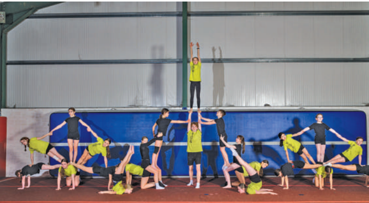
Arklow Gymnastics Club members performing an acrobatic gymnast lift

raising have already started. "We are working hard on the new routine for this event, which combines gymnastics, dance and acrobatic gymnastics," said the club.