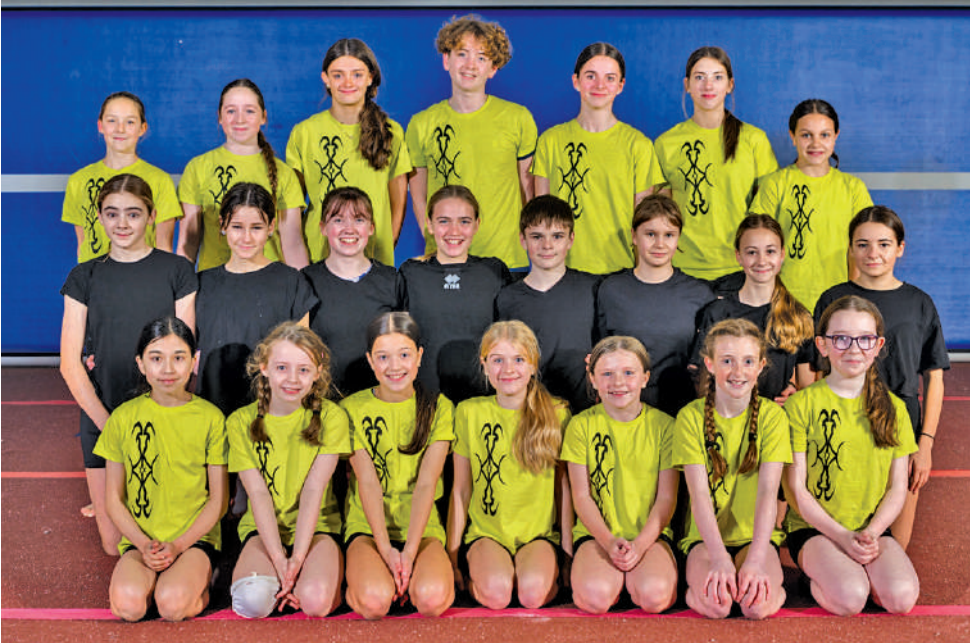
The Arklow Gymnastics Club squad members

Twenty-two gymnasts from Arklow Gymnastics Club are heading to Norway in July for EUROGYM 2024.