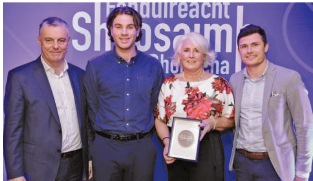
Blessington CLG (Kinvara), was a bronze medal for its exceptional efforts.

edges individual club achievements but also reinforces the importance of preserving and promoting the Irish language through sport.