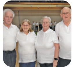
TOP BOWLERS Page 10