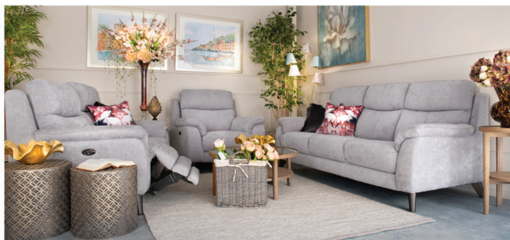
Raphael Fabric Power Recliner Package Deal 3 Seater & 2 Chairs WAS €5,085 NOW €2,995