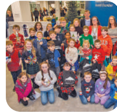
DECORATIONS Page 4