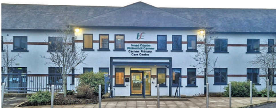
Carnew Primary Care Centre

If you attend the Stop Smoking Service, your local Advisor will arrange for you to access NRT through your GP or participating pharmacy. Your Advisor will keep in touch with you weekly for the first six weeks after you