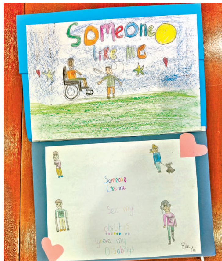
Senior entry inside

"This year we placed a special emphasis on nurturing a greater understanding