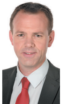
John Brady TD

"My number one wish for 2024 is that we will look back on it in the future as the year that Irish people showed the very best of what we are about. I want to see our future marked by positivity. One where every Irish citizen is given the opportunity to contribute. Where we work together to better our communities, and above all ensure that we bring about a better future for young people."