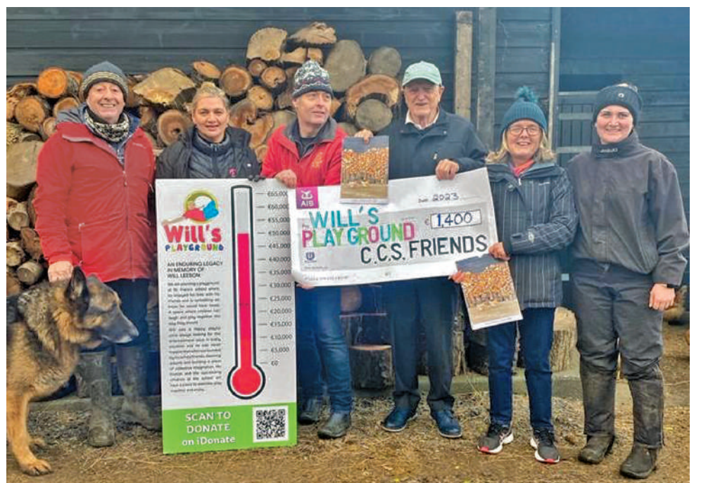
Pictured is the handover of a cheque from the patrons of Country Cottage Stables for €1400 which was raised from sales of a calendar.

The Committee have some more fundraising events planned for early 2024 to help bridge the €15,000 gap, but if anyone would like to donate to Will's Playground, please visit https://www.idonate.ie/fundraiser/willsplayground .