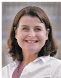
Jennifer Whitmore TD

too. My sincere thanks to the community, voluntary and state agencies working in all these areas for your empathy, passion and commitment. I'd like to take this opportunity to thank the staff of Wicklow County Council for their ongoing support and hard work and to wish everyone a wonderful Christmas and