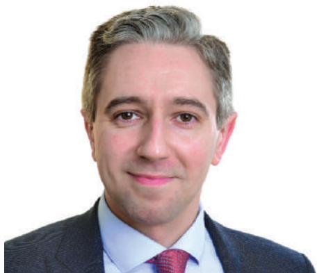
Minister Simon Harris

Wicklow's Local Enterprise Office will be running a course named the 'Start Your Own Business' programme in January, to help promote local business and encourage people looking to take the initiative in their local community.