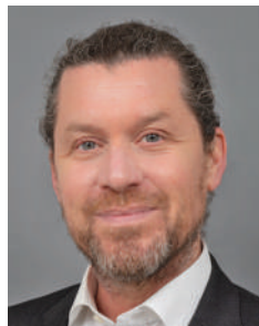
Steven Matthews TD

"One of the biggest challenges we face in Wicklow, as is the rest of the country, is access to affordable housing. This is a great county to live in, work in and raise a family in, but more and more, it has become unaffordable for far too many. I will continue to hold government parties to account on this issue. I hope 2024 will be a year of progress on the needs of Wicklow. I wish all Wicklow Times readers a happy and healthy Christmas and