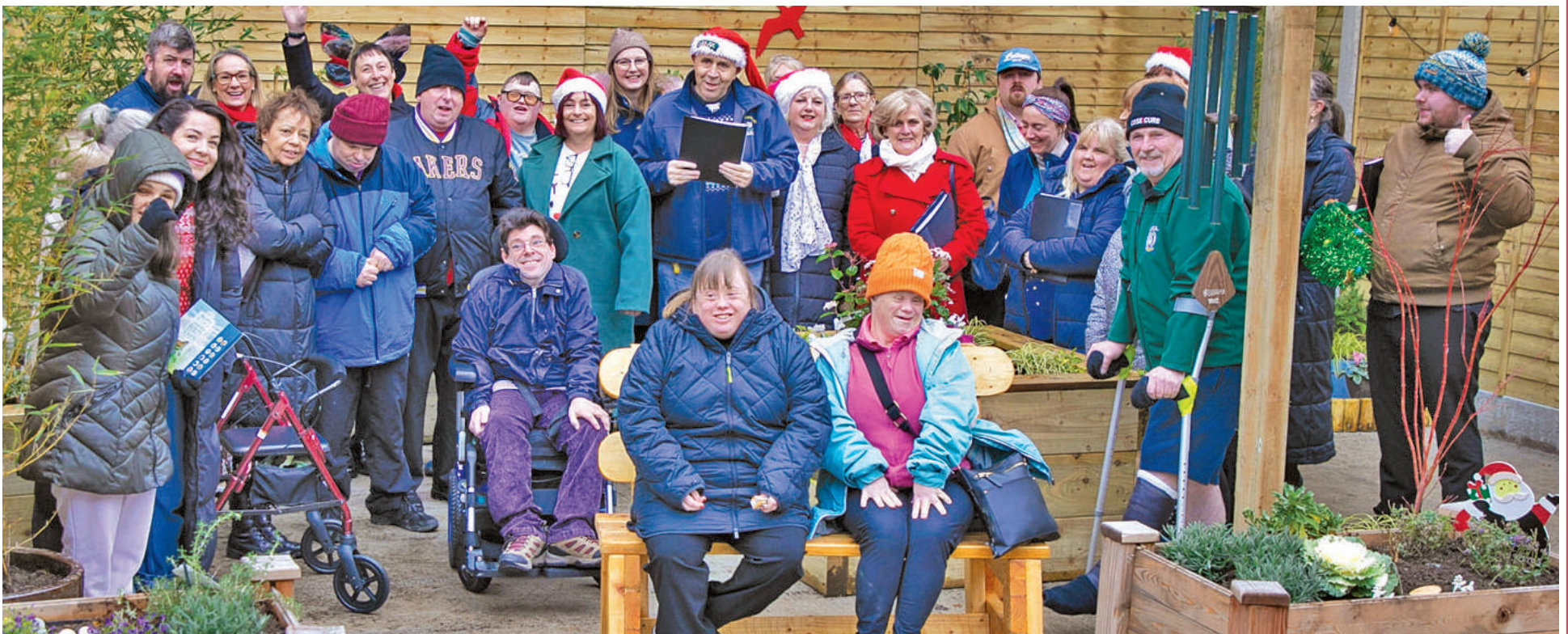
Staff and service users of Sunbeam House Services at the official opening of the Sunbeam House Sensory Garden in Bray.