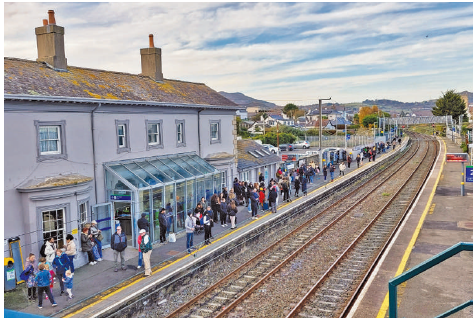
DART users left waiting on the platform in Greystones