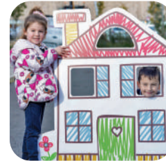
BRAY HOUSING Page 10