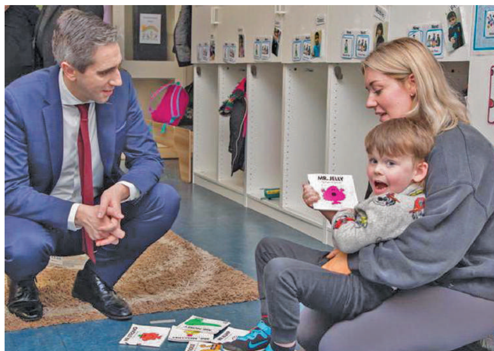
Minister Harris in St. Mary's National School

Minister Harris concluded: "A huge congratulations to the school and the community. It was great to meet the newest pupils and their parents."