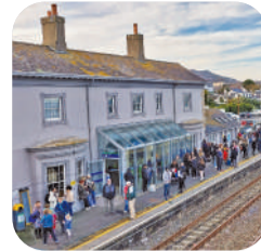
DART SERVICE Page 8