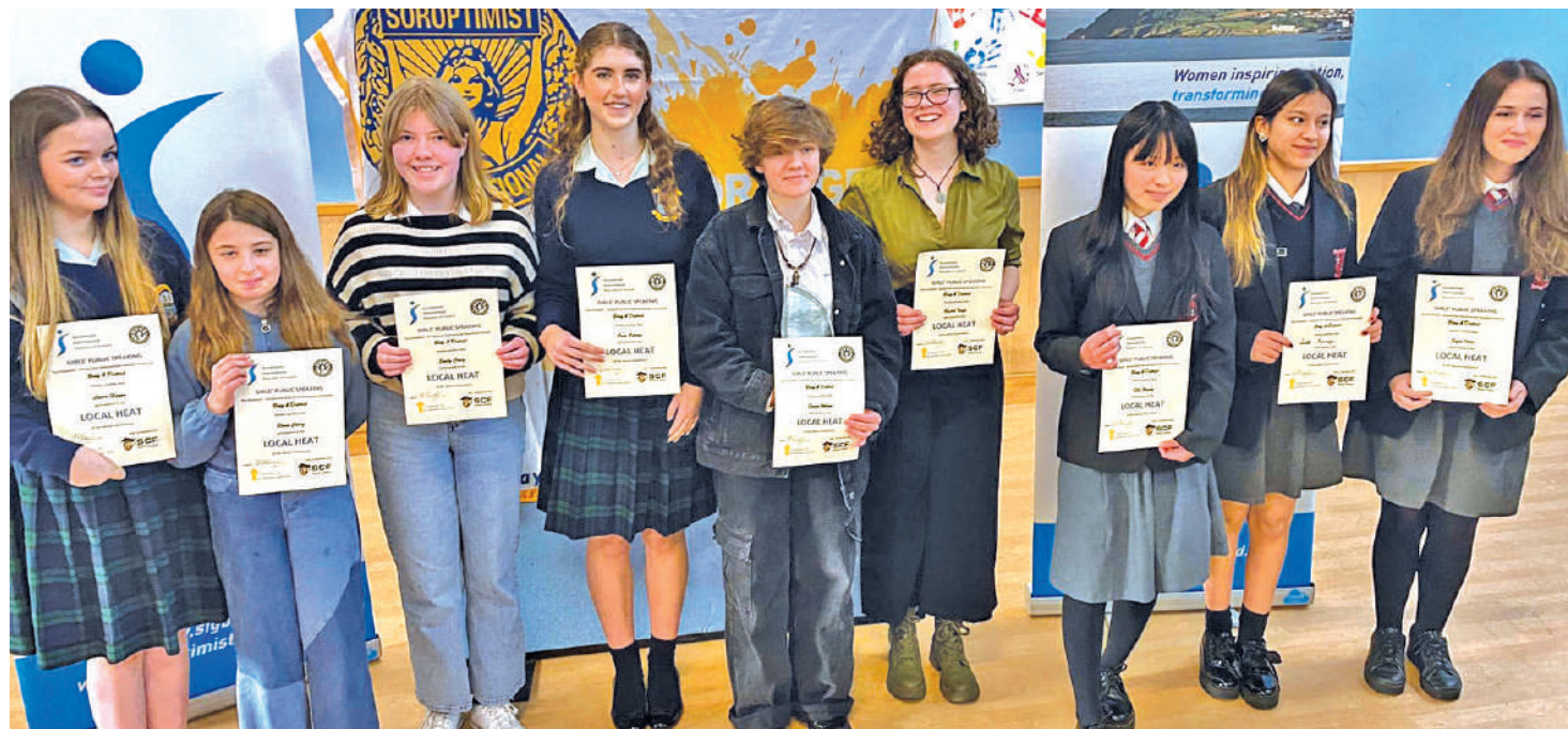
Participants at the SI Bray Public Speaking Competition Public Speaking Competition