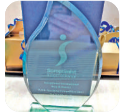
SOROPTIMISTS Page 15