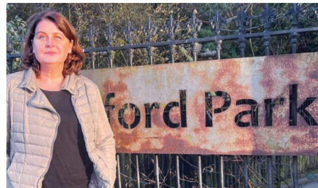
Jennifer Whitmore at Ashford Park