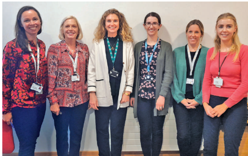
The Diabetes Team in HSE Community Healthcare East's Integrated Care Hub, Bray

One of the supports available under this is the DISCOVER Diabetes programme. This is a self-management education and support group programme for all patients with a confirmed diagnosis of Type 2 Diabetes. It is free and can be accessed online or in-person in venues across HSE Community Healthcare East (which service