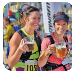
ECO TRAIL Page 12