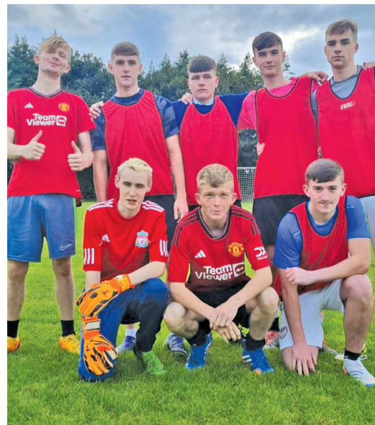
The Ballyactive team