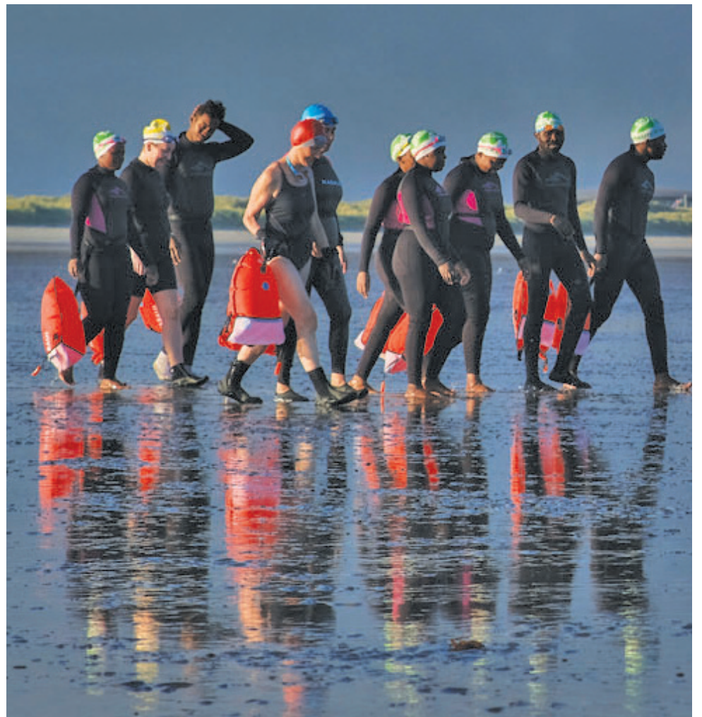
The Dublin Sanctuary Swimmers group

www.bife.ie 01 2829668 bifeenquiries@wicklowvec.ie