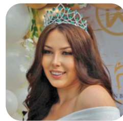
MISS WICKLOW Page 4