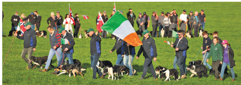
Pictured at the opening ceremony of the World Sheepdog Trials, are handlers representing Ireland, including members of the Team who triumphed during the Teams competition on Thursday, at Gill Hall Estate, Dromore.

The World Sheepdog Trials ended on Saturday 16th September.