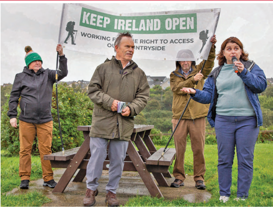
Jennifer Whitmore TD speaking at the 'Keep Ireland Open' protest walk to the Wicklow Head Lighthouses on 16th September. Protesters want Wicklow County Council to re-establish and make permanent access to the first two Lighthouse sites together with access right out to Wicklow Head. Concerns have been raised by councillors during the year at the closure of part of the access road to the Lighthouses on Wicklow Head, a Special Protection Area, by a local landowner and there seems to be no progress on sorting out this issue. Many locals use the Lighthouse Road for exercise, birdwatching, photography and other outdoor pursuits as it is a suitable surface to access the countryside within walking distance from the town. Traditionally this walk has been enjoyed by townspeople but recent years have seen walkers being met with locked gates and security guards.