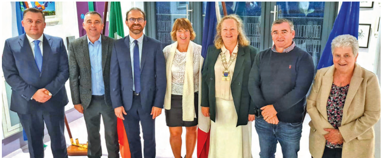
Wicklow Municipal District Members with Le Maire Lorraine Merkaert

Wicklow Municipal District recently welcomed a delegation from the French town of Montigny-le-Bretonneux to celebrate the 30th anniversary of town twinning with Wicklow.