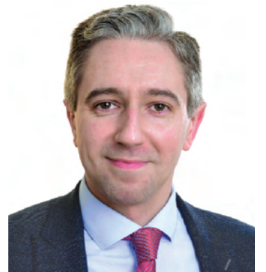
Minister Simon Harris

Students in this 2023/24 academic year will also see the full benefit of increases to the maintenance grants announced in Budget 2023. From 1 January 2023, the Special and Band 1 maintenance grant rates increased by 14 per cent and all the other maintenance