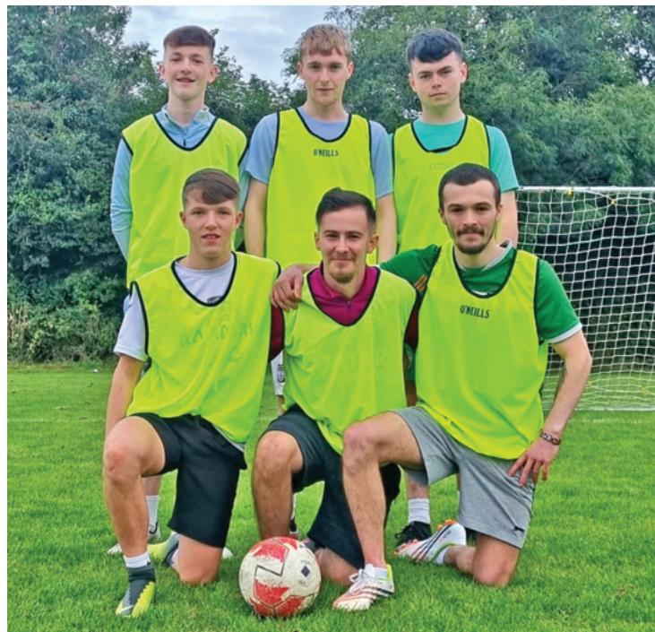
The Boyos managed to take revenge in this year's final, beating Ballyactive

Year 24 of The Thomas Murphy Cup, an annual community football tournament organised by Bray Travellers Community Development Group, saw a large crowd attend the Final which was a repeat of last year's decider but with a different outcome.