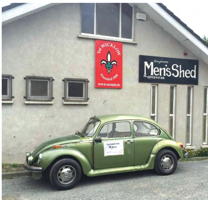
Greystones Men's Shed