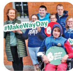
MAKE WAY DAY Page 8