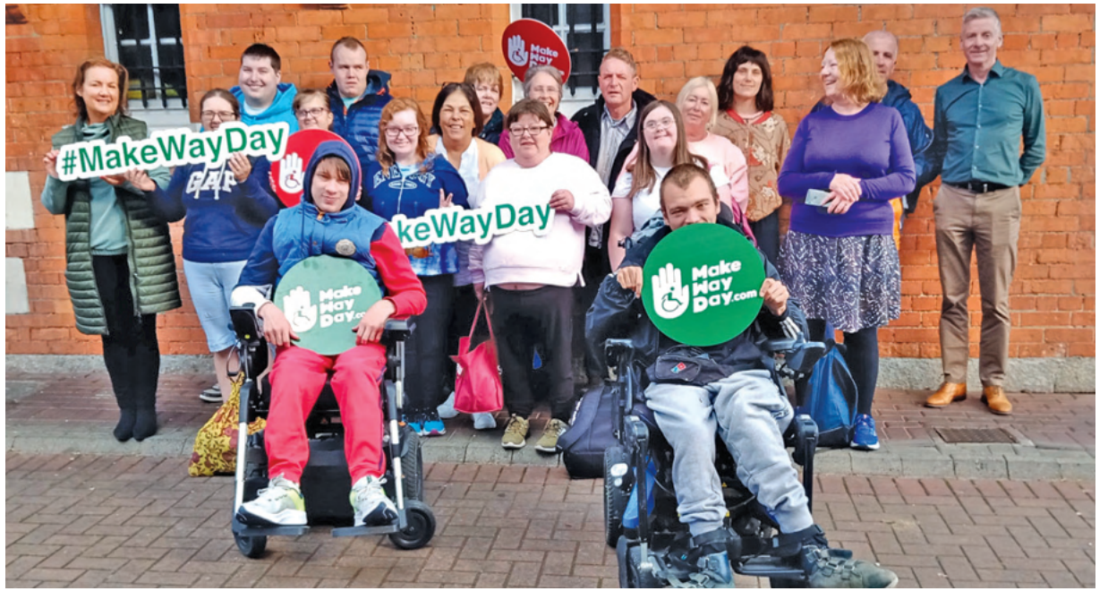
Members of Bray Area Partnership's Disability Network outside Bray Town Hall supporting Make Way Day

The public is asked each year to support the campaign via social media and post photos of obstacles in their local area using the DFI's user-friendly online survey tool.