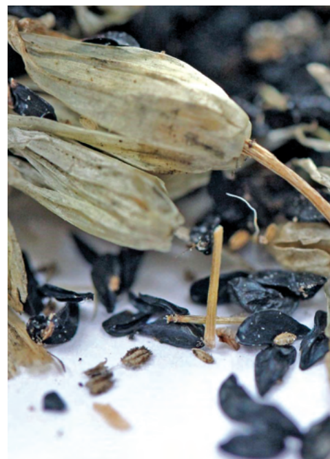
Seed Landscapes by Ashleigh Downey