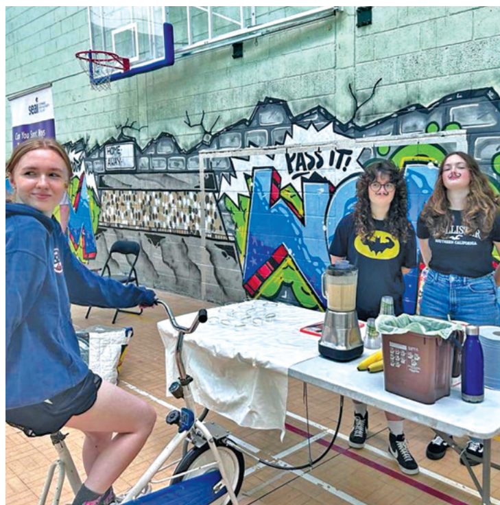
St Marys students making smoothies with a bike

Arklow Sustainable Energy Community and Arklow Tidy Towns held an Energy Awareness day on the 9th of September in the Coral Leisure Sports Hall. The event had exhibitors with a wide range of services for retrofitting homes and a selection of electric vehicles. During the event Arklow Sustainable Energy Community launched its new Energy Master Plan with South East Energy Agency SEAI and Wicklow County Council.