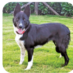
SHEEPDOG TRIALS Page 4