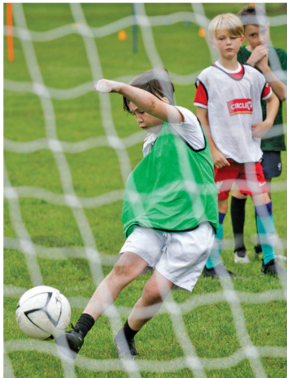
Penalty Shoot-out at Playful Street at the People's Park, Bray. See more page 14.

Ardmore Rovers has 32 teams, from U8 to U19, catering for about 500 children from all areas in Bray and further afield.