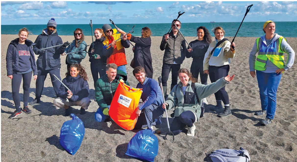
Volunteers cleaning up in Greystones

Joining forces with the An Taisce National Spring Clean programme, the Big Beach Clean encourages residents from all corners of Ireland to participate. Urban litter has been identified as a significant contributor to marine litter, underscoring the importance of even non-coastal communities in preventing litter from entering waterways and oceans.