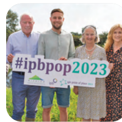
PRIDE OF PLACE Page 8