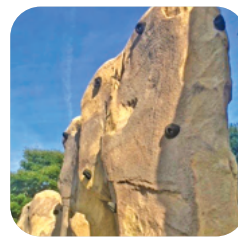
BRAY BOULDERS Page 12