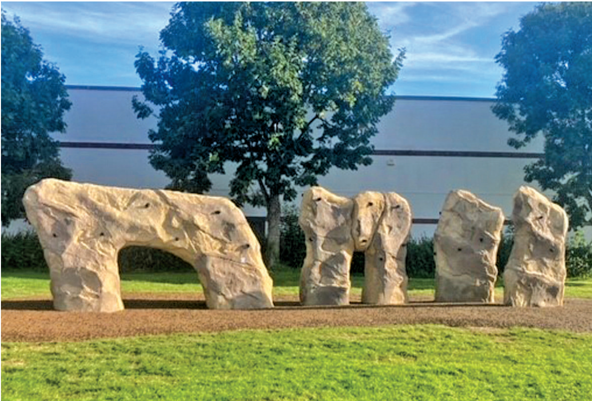
The new climbing boulders in Ballywaltrim playground