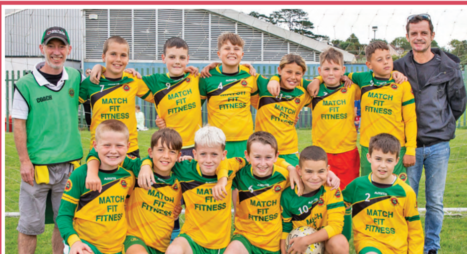
Pictured is the Rathnew team at the Doran Soccer Blitz in aid of Wicklow Cancer Support