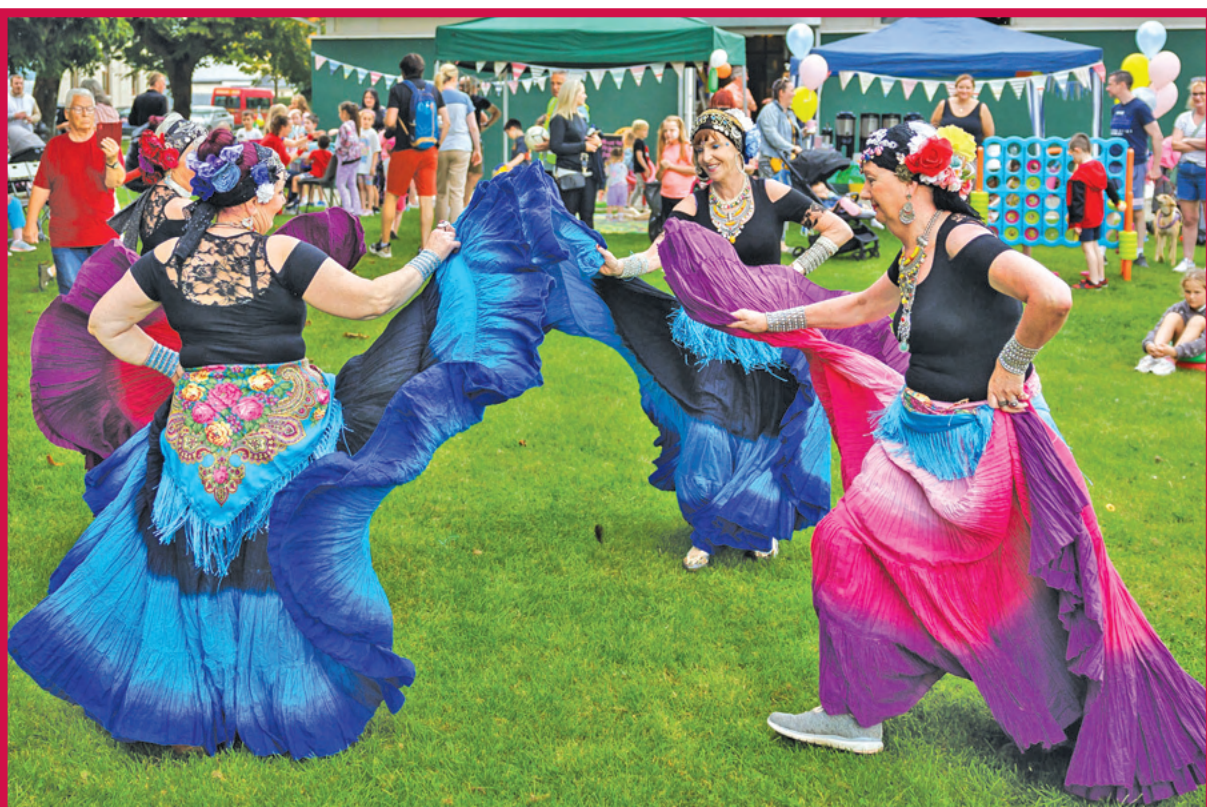
The Dancing Skirts perform at Playful Street in the People's Park, Bray. See more on page 14.

"The Navy, because of low numbers can now only put two ships on active duty, yet the need for such protection from the Navy has never been more required, both with the war in Ukraine and the drugs problem. The recruitment problem is being blamed on post Covid, but the