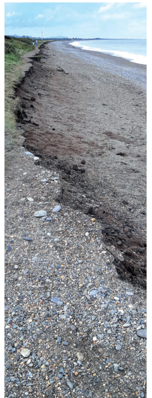
The disappearing Murrough