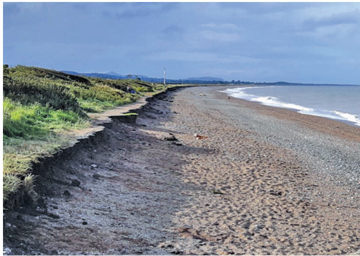
Erosion at The Murrough