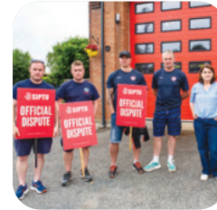
FIREFIGHTERS Page 7