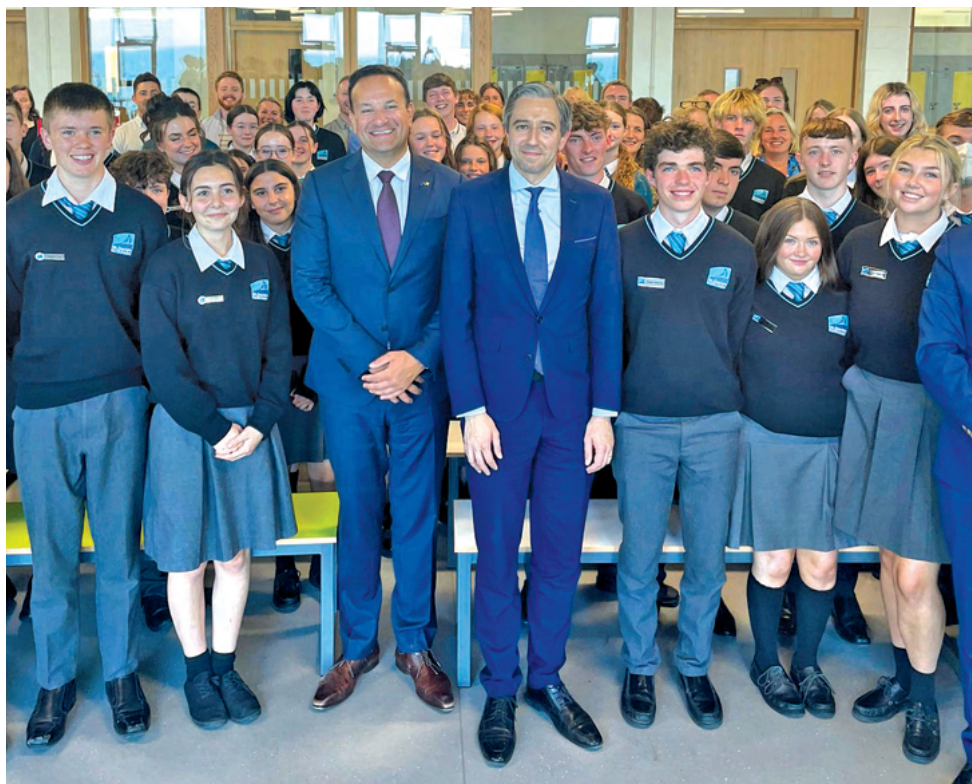
Minister Simon Harris and An Taoiseach Leo Varadkar meeting with students from St. David's