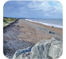
MURROUGH EROSION Page 10