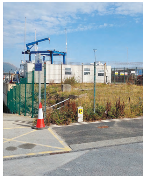
The site of the new coastguard station at Greystones Harbour

also provide us with an opportunity to extend Greystones Garda Station. So the benefits for the town are very significant on every level [...] The Office of Public Works (OPW) has confirmed to me that the Greystones Coast Guard Station project remains the number one priority project for the coastguard service nationally and that the ring-fenced funding which I secured remains in place. The new station will provide a much needed modern facility for the coastguard including a boathouse, proper parking for coastguard vehicles and an operations and training room. I am looking forward to this progressing and I continue to monitor the project very closely."