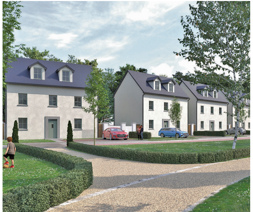
Chancel Way, Newcastle

plus high-performance grey uPVC double-glazed windows and doors, all the homes feature high ceilings on the ground and first floors, coving to hall and living/dining room, solid timber white finish staircase with varnished teak handrail, chamfered style skirting and architraves while high quality flooring is provided as standard on the ground floor.