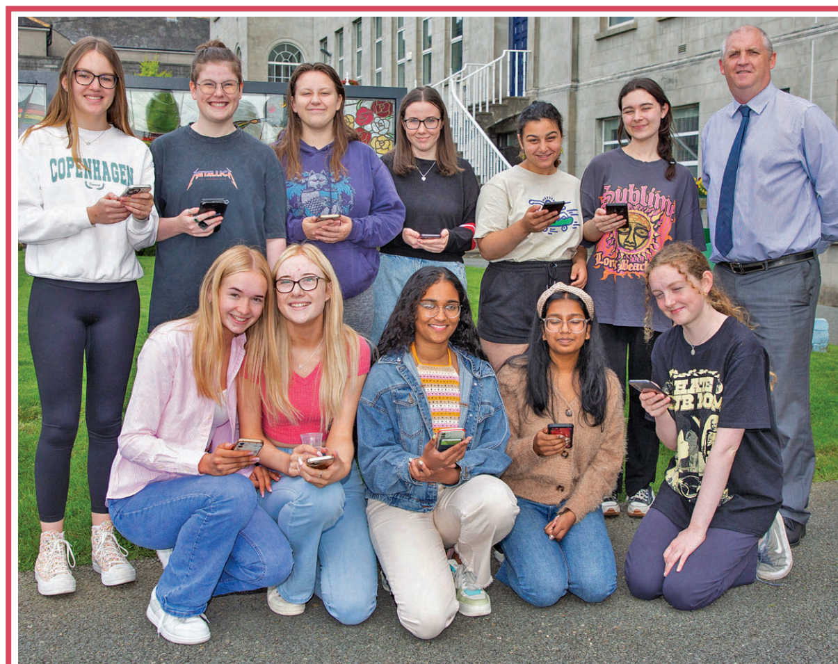
Students receiving their Leaving Cert results at St.Mary's College in Arklow on Friday

National Learning Network has a range of courses for job seekers and those who want to resume their education and get qualifications.