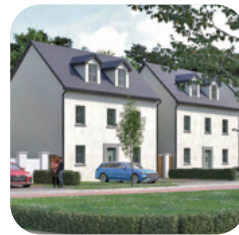
CHANCEL WAY Page 12