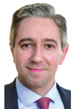
Minister Simon Harris

"There are plenty of courses which can get you where you want to go, be it through PLC and Further Education courses, apprenticeships or the recently announced unified tertiary courses in which students will be able to enroll in one of 23 new degree courses outside of the CAO points race across a wide range of sectors - for the first time ever. For each student there is so much to be excited about as a new chapter of their life begins. Remember that education is a lifelong journey, one which can constantly improve your knowledge and skills and, ultimately, help you achieve your full potential."