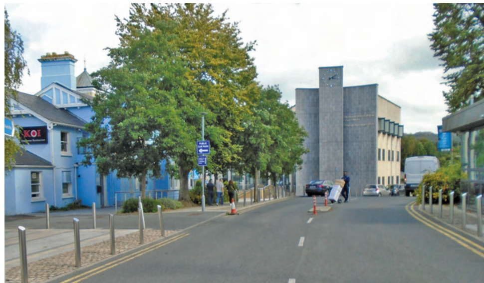
Bray Civic Centre, location of Bray Adult Education Centre.

throughout our lives - personal progress and professional progress. Like other FET centres, Bray Adult Education Centre - in The Civic Centre - is still hard at it, recruiting new students. The options are fabulous. FET opportunities are some of the easiest services to get access to. The door is always open. You only have to walk in.