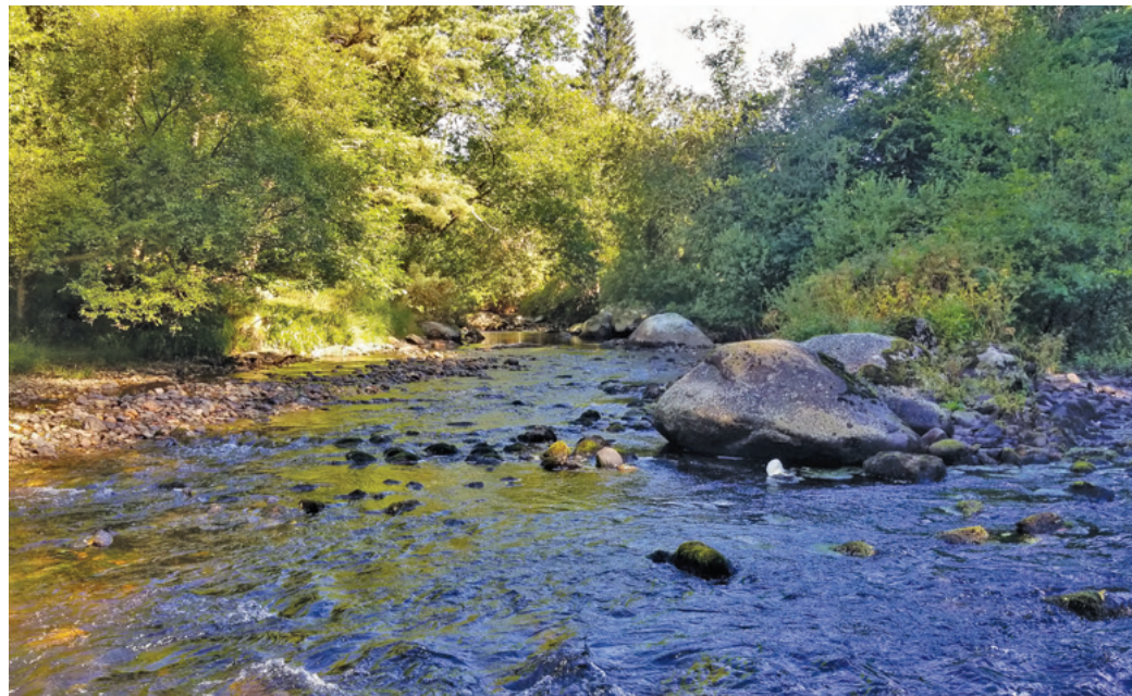
Confluence of Glendasan and Avonmore Rivers downstream of Ballard Bridge, Laragh.

New insights into the characteristics of Ireland's most pristine waters have been published, along with a comprehensive set of measures to reverse the deterioration of these rivers and streams.