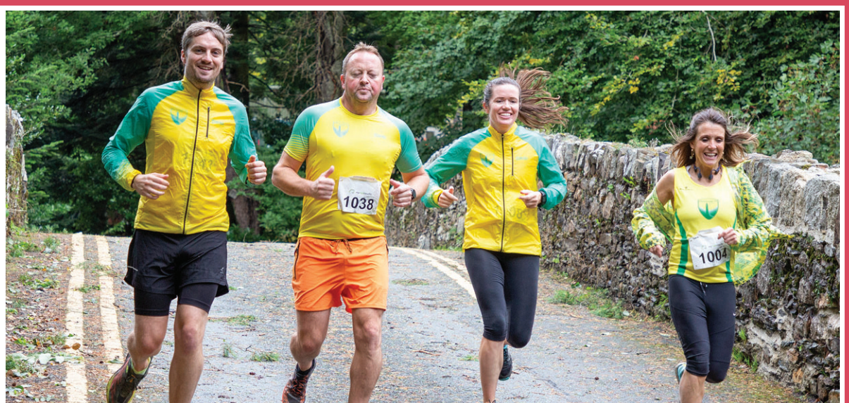
Members of the Glendalough Athletic Club team warming up before the Wicklow Trail Championships in Laragh.

Phone: 0404 20159 Fax: 0404 20112 e-mail: recruitment@wicklowcoco.ie