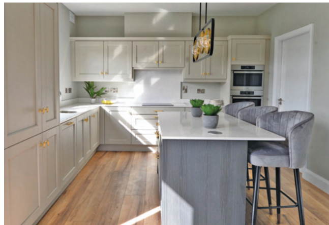
Modern, fitted kitchens with stone counter tops and tiled splashbacks are standard throughout

Newcastle offers a quieter alternative to Greystones while still offering access to all the amenities close by. The units feature high quality sash windows and slate roofs complementing the existing village aesthetic. Built with high-quality insulated timber frames