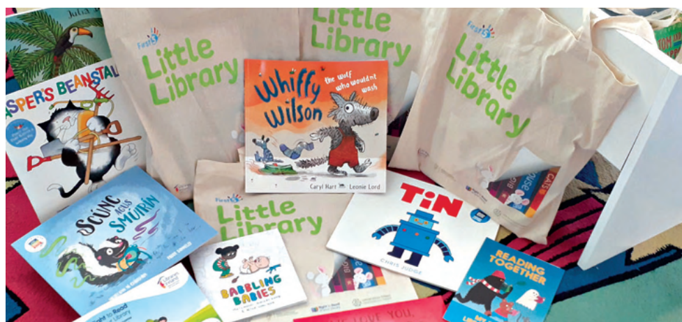
The My Little Library Bags initiative is aimed at welcoming new junior infants to the world of education and fostering a love for reading from an early age.

With the new school year just around the corner Wicklow County Council Public Library Service is reminding parents and guardians of children due to start Junior Infants in September to make sure to collect their My Little Library Bag.