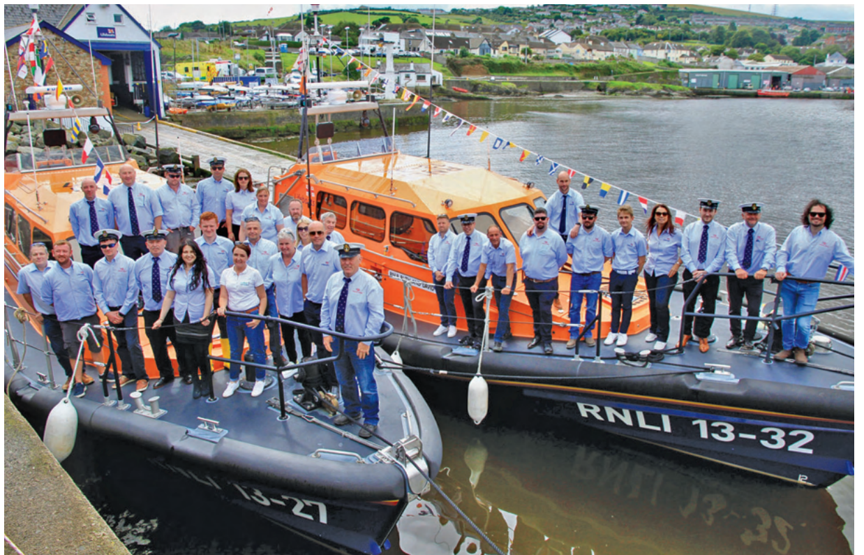
Wicklow RNLI crew and volunteers at the recent open day at the station