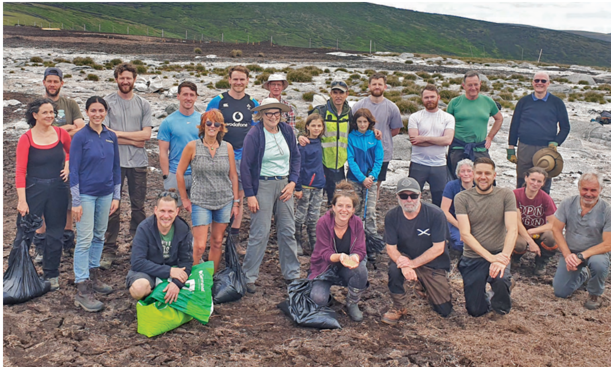
The ReWild Wicklow volunteers pictured during one of their clean-ups

To find out more about Wicklow's newest environmental charity, or to join their volunteer list, visit rewild-wicklow.ie