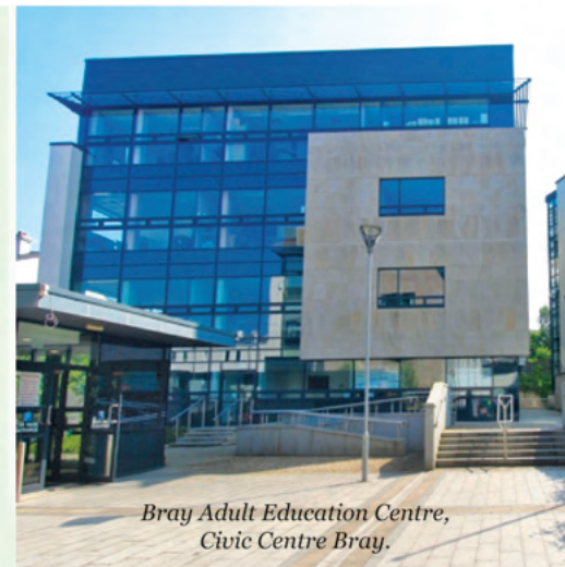
Bray Adult Education Centre, Civic Centre Bray.

Your plans for the future really should include education and training.