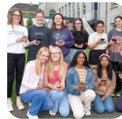
EDUCATION Pages 5-11