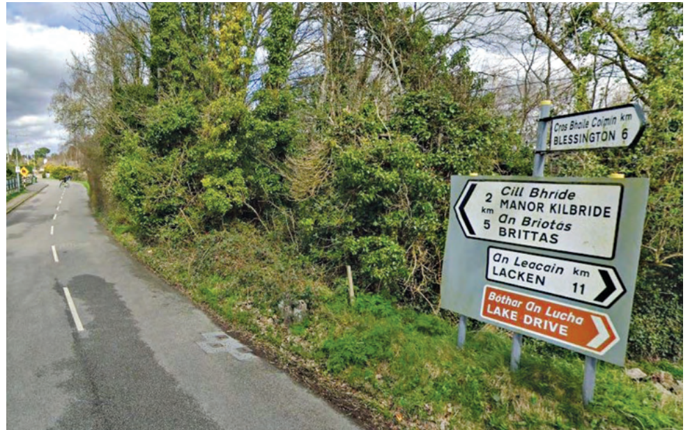
Currently Manor Kilbride is not serviced by public transport

Also welcoming the news, Fine Gael Minister Simon Harris said "Over the past number of