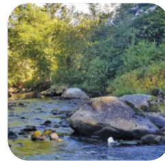
WATER PROTECTION Page 4