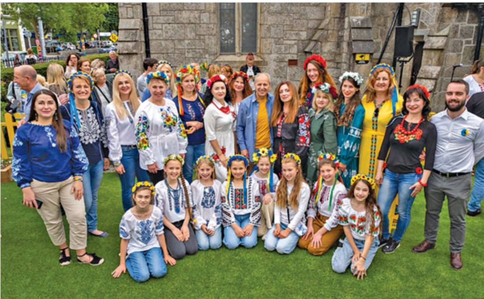
Ukrainian people in traditional costume at the launch

dear to me, I found solace here, in beautiful Ireland. I would like to particularly acknowledge the Ukrainian Centre, which has become a hub of unity and support for me. Your boundless love for Ukraine and the multitude of programmes for children and adults have inspired me and helped restore my faith in the future."