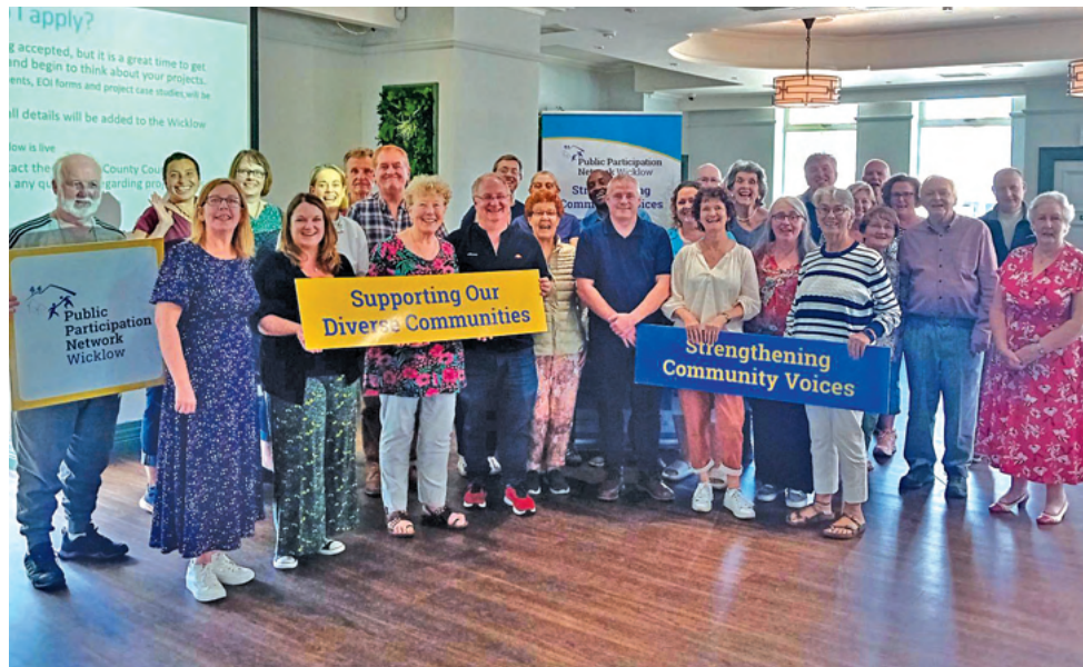
Wicklow Public Participation Network members at their summer meet up

Membership of Wicklow PPN has grown to 413 community groups including residents' associations, community councils, youth groups, older people's groups, sports clubs, Traveller groups, disability groups, community centre committees, environment protection groups, Tidy Towns and more, attendees of the Wicklow PPN summer meet up were told.