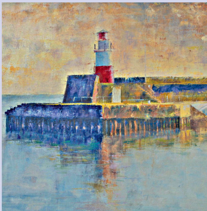
Wicklow Lighthouse on the edge of the pier, 73 x 50 cm, Oil on canvas

Wicklow Thoughts is the title of an exhibition opening next week in Wicklow Library which will run until the end of July.