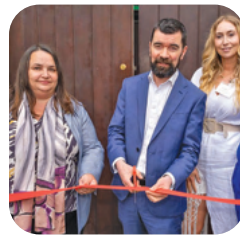
UKRAINIAN CENTRE Page 14