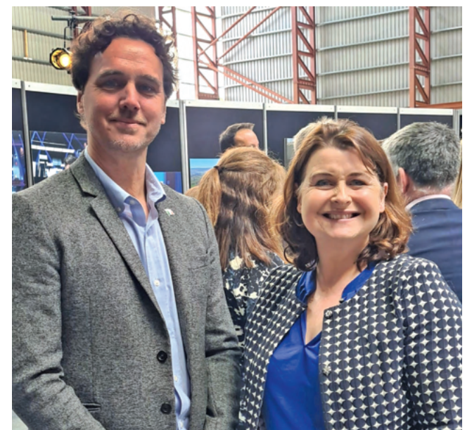
Deputy Whitmore with Fox Entertainment CEO Rob Wade

"This new project is one of many large-scale productions in Wicklow. Hollywood movies such as Braveheart and Elle Enchanted and recent Netflix productions like The Winx Saga and The Wonder have all used Wicklow as their backdrop. As Wicklow becomes a more well-established hub for film production and television, we need to see investment in studios like Ashford and for resources in the surrounding areas such as parking and transport links. There is an opportunity to make Wicklow the go-to destination for filming in Western Europe."