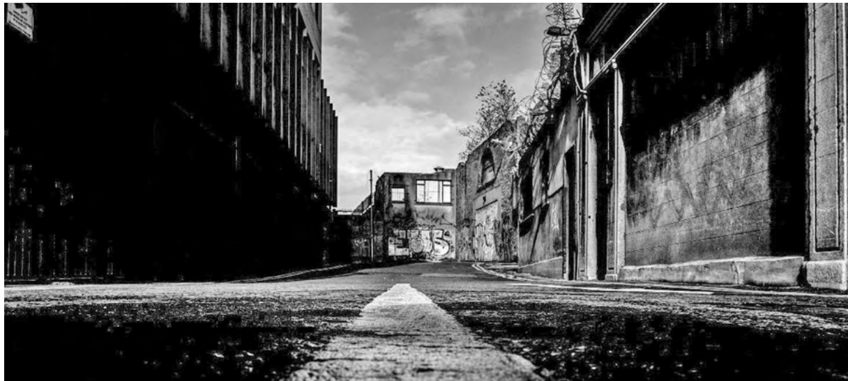
Stoneybatter by Andrew Freeland

When you start a project that has elements of new and old work, certain questions you must ask. How it is different from before and how it is the same? Andrew's show will have three different elements. The Imagery still retains traditional elements of street photography as a flâneur and moves into more colourful burnt and overexposed images and some new imagery. His showcase will also include a series of photographic books.