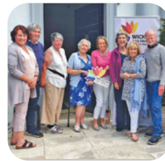
OLDER PEOPLE'S COUNCIL Page 4