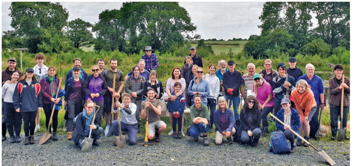
ReWild Wicklow volunteers pond digging at Wild Acres Nature Reserve