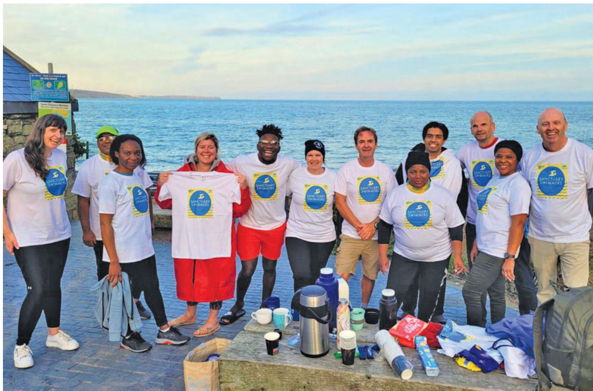
A group of Sanctuary Swimmers

"And it's not just the swimming but also the time spent chatting on the beach, those much-needed coffees shared as swimmers warm up and the sun goes down, the dancing and joy that envelopes the initiative, the getting to know other local swimmers and that feeling of accomplishment at the end."