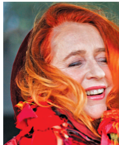
Mary Coughlan.

Mary is our greatest female singer because over twenty-five years and ten albums she's made the most grown-up, uncompromising, wholly personal and utterly universal music on either side of the Atlantic about what goes on between men and women. She has taken the classic standards of jazz balladry and the recent gems of rock and Irish song-writing, shaken them and offered them up anew. She sings in the voice of the wrong and wronged woman and she makes us think what it is men make of women and what women have to do to make do.