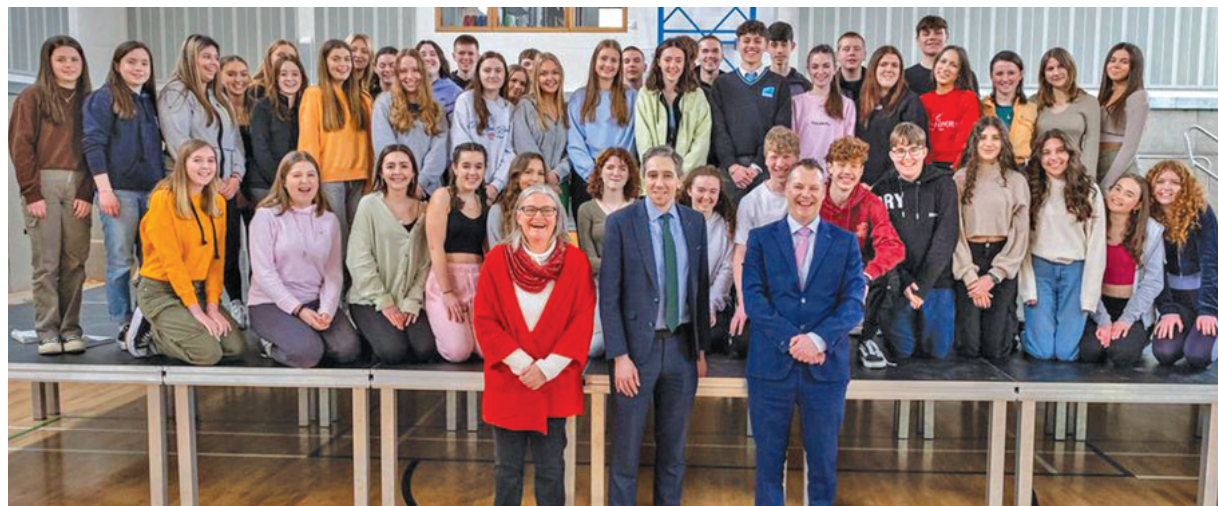
Minister Harris with staff and pupils of St. David's