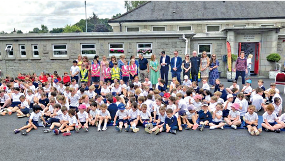
Minister Harris with pupils and staff of St. Mary's and St. Gerard's National School helping to raise the school's ninth Green Flag

Minister Harris said, "I am delighted to have been able to celebrate and raise St. Mary's and St. Gerard's National School's ninth Green Flag, which has been awarded for the school's efforts to encourage walking, cycling and the use of public transport or carpooling as viable transport options to and from school. This theme showcases the positive impact that these practices have on both a local and global scale, leading to improved air quality and a variety of other environmental benefits." "It was fantastic listening to the school choir and getting to see the performances by St. Mary's and St. Gerard's National School's students. The students truly are a credit to their school, and I am grateful for the opportunity to have met them along with the school's staff and parents," Minister Harris concluded.