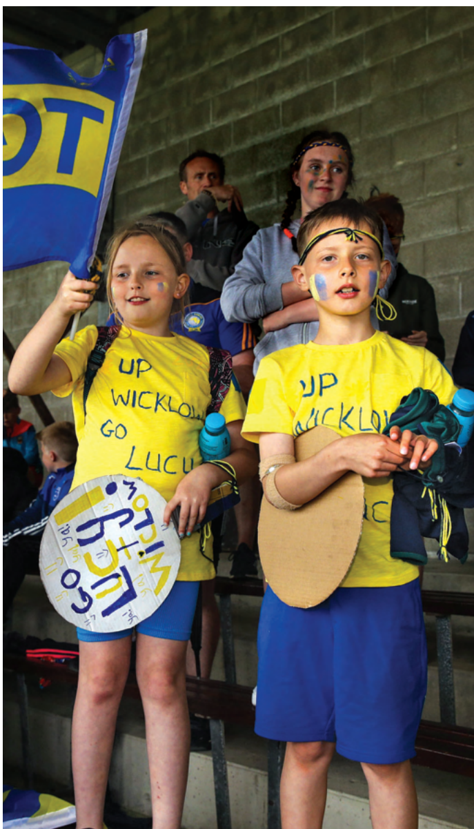
Wicklow supporters in the stands celebrating after Wicklow's recent victory in the All Ireland U14 Bronza Final against Clare in McDonagh Park, Nenagh, Tipperary.