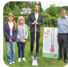
WILL'S PLAYGROUND Page 4