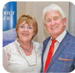
LIONS GALA BALL Page 12