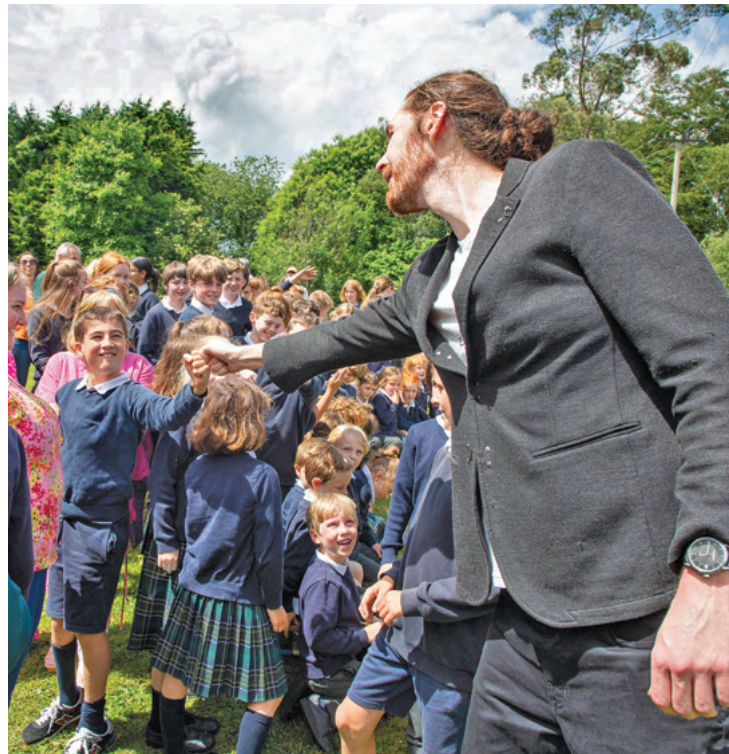
Hozier greeting pupils from St. Francis National School

Famous musician and Newcastle resident Andrew John Hozier-Byrne (Hozier) has lent his support to local St. Francis National School in its fundraising campaign for a new playground.