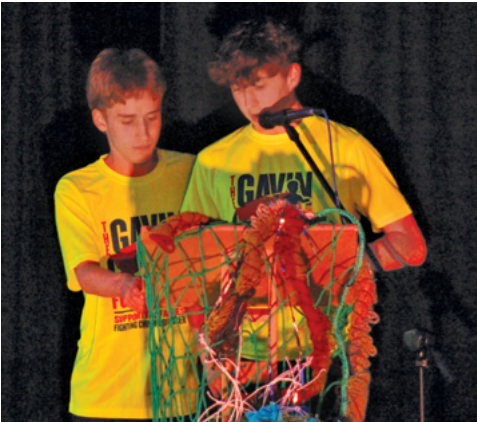
Sustainable art in aid of the Gavin Glynn Foundation