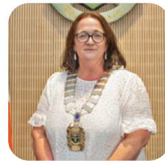
NEW CATHAOIRLEACH Page 5