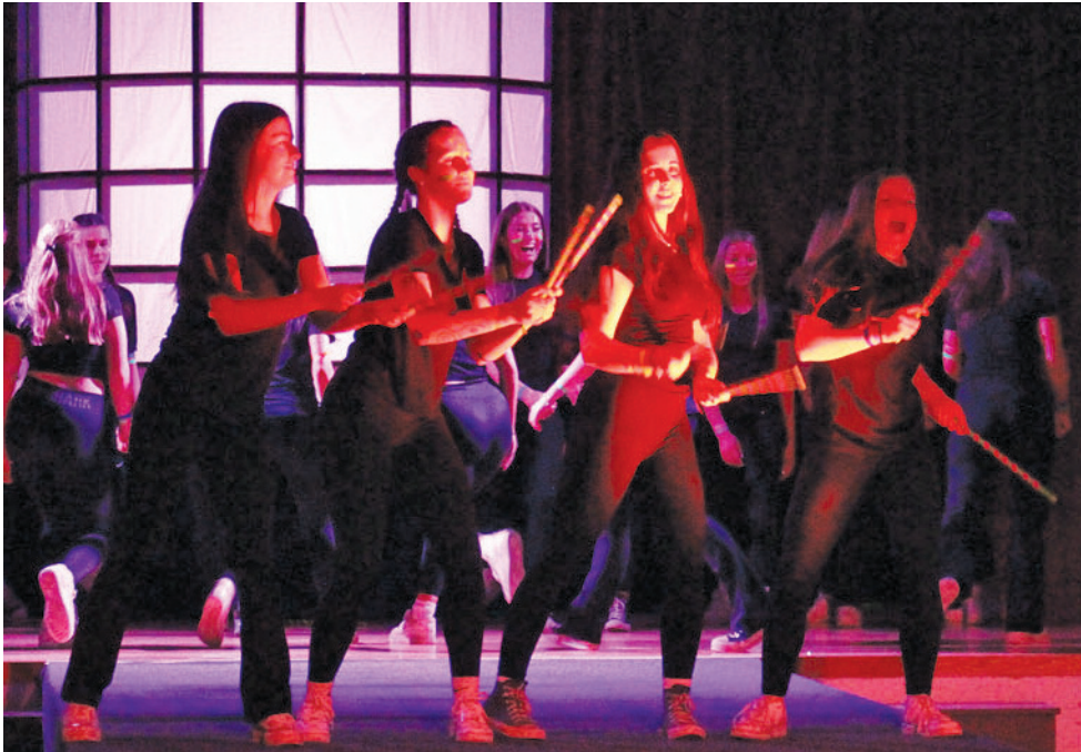
Creative Dance students entertaining the audience on the night