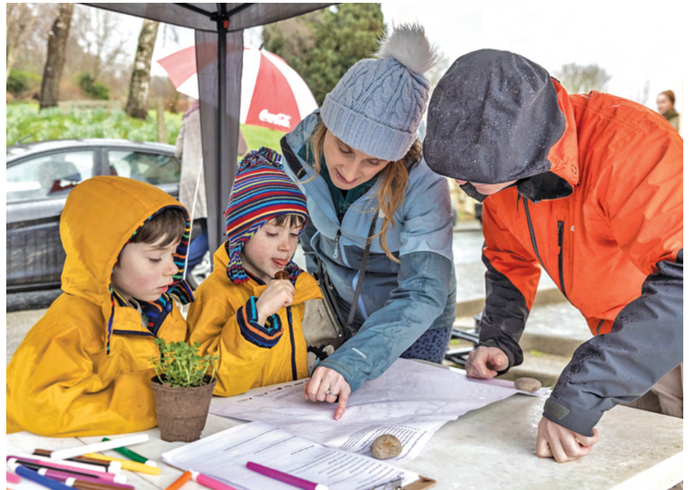
Visitors to the Aughrim St Patrick's Day parade engaging with Suppose a Stone activity maps.

Also commenting, Minister Heather Humphreys, TD, Minister for Rural and Community Develop-