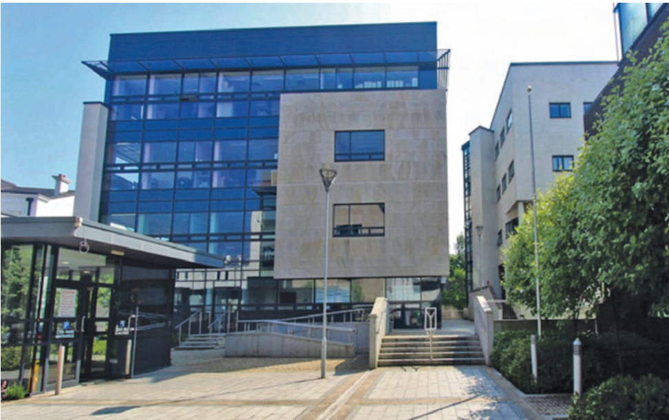
Civic Centre, Bray

“I never thought I could do this!” “This has opened up whole new worlds for me!” “I feel like a different person. I was going nowhere for a bit, but now I really think I could take on anything!” These are typical comments made by people who have completed courses in Bray in recent years. During the past few decades, one of the most exciting developments in modern Ireland has been the growth of Further Education & Training (FET). Every corner of the country has opportunities for valuable learning nowadays. Where once we thought of education as something you do while you're in school, now it can continue throughout a person's life. Bray is no exception to this - in fact, Bray is better served than most parts of Ireland. The people of this town and its surrounding region can get involved in a very wide range of learning opportunities. Some of the very best of them are provided by the local Education & Training Board, KWETB. One of KWETB's FET centres is Bray Adult Education Centre (BAEC) in the Civic Centre on the Main Street. BAEC's Open Day is on Friday 12th May. The centre is signing up applicants for its courses that will start in late August. Year after year, people come in the door to enquire about the courses, and before they know it, their lives have taken an exciting new direction. FET is for everyone - and it genuinely does change lives.