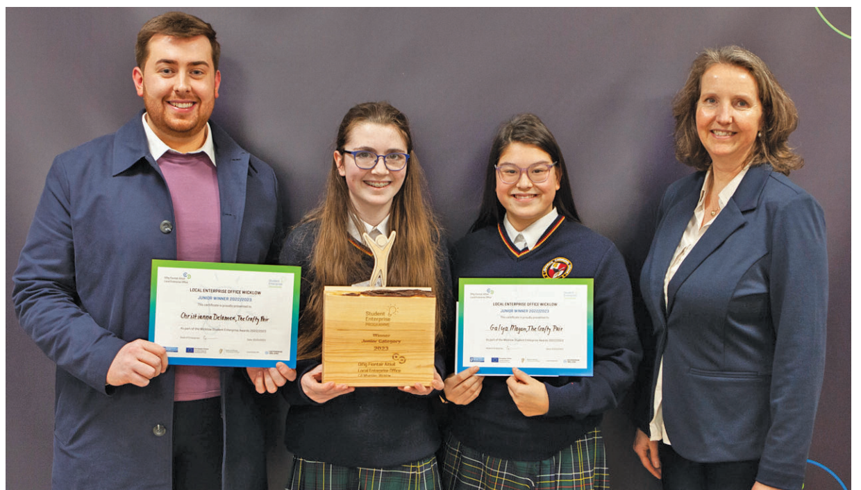
The Junior Finalist is The Crafty Pair from Avondale Community College, who create seasonal, personalised decorations with multiple purposes.