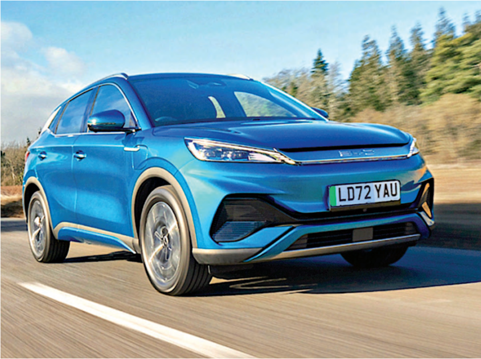
BYD - Build Your Dreams

'BUILD YOUR DREAMS' or BYD as it says on the tin - is the biggest brand we have never heard of. But we will hear a lot more of them in the Irish motoring scene, as they team up with Irish car distribution royalty - the O'Flaherty holdings Motor Distributors Ltd. (MDL) to provide new technology, battery electric motoring to Ireland.