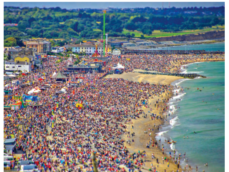
Aoife Hester - Bray Airshow Crowds 2022, Bray