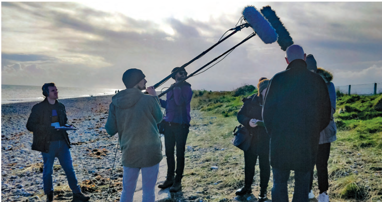
Recording the 'Changing Coasts' radio drama on location in Wicklow

Through recording on location, they were able to capture naturalistic performances and authentic soundscapes, which were later augmented with original music, sound effects and Foley recordings.