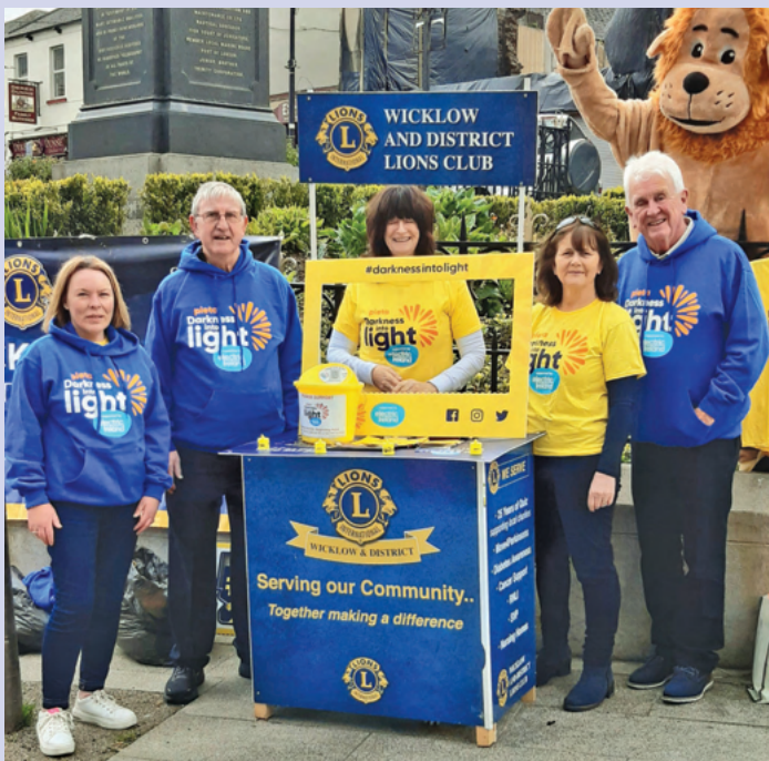
Wicklow Lions Club members in Fitzwilliam Square, helping to get the word out about the upcoming Darkness Into Light talk on May 6th.