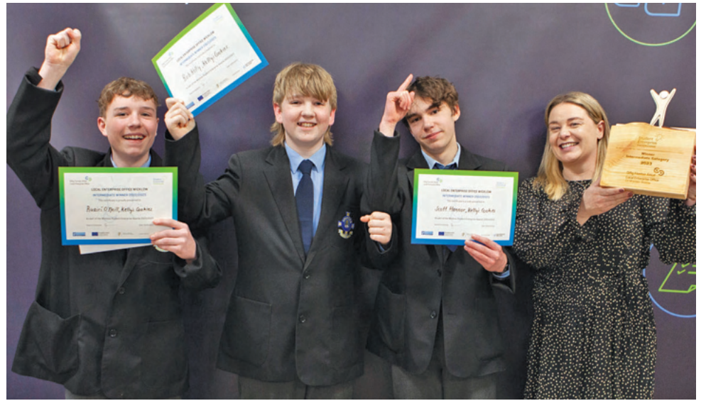
The Intermediate Finalist is Kelly's Cookies from Arklow Community College, with their baked treats

compete across three categories, Junior (1st year), Intermediate (2nd and 3rd year) and Senior (4th, 5th and 6th year, LVA, LCA and Youth Outreach). Each student enterprise is challenged with creating, setting up and running their own business, which must show viable sales of their service or product. Following the conclusion of county and regional finals, Student Enterprises from across the country will now take part in the Final at Croke Park next month.