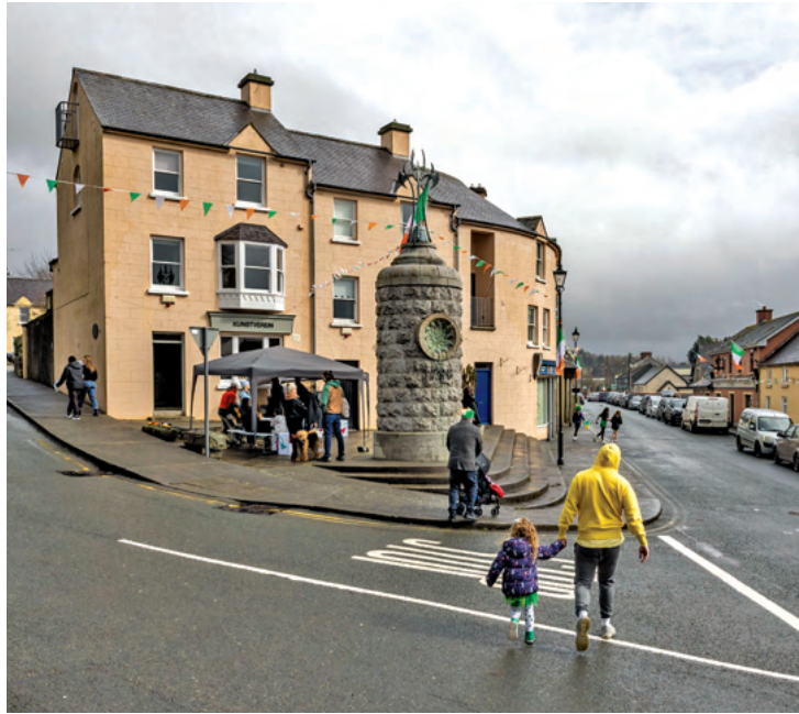
Aughrim pictured on St. Patrick's Day, when the community project was launched.

An Aughrim town centre regeneration project has been selected for the Irish Architecture Foundation's Reimagine Hometown Architect initiative, a programme which focuses on the revitalisation of Ireland's towns and villages and comes with the support of €10,000 per project.