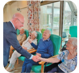
COMMUNITY UNIT Page 7