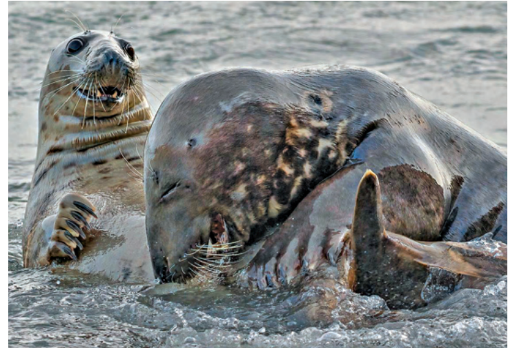
Chris Howes - Seals have fun too, Brides Head, Wicklow Town

To enter, visit the Clean Coasts website at https://cleancoasts.org/our-initiatives/love-your-coast/