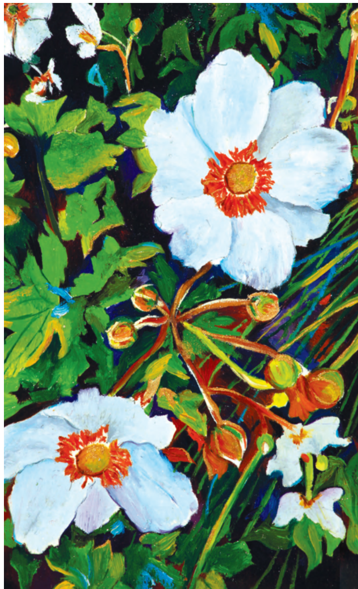
Pictured is one of the original posard artworks from this year's Incognito art sale

Wicklow artists have once again illustrated their hearts of gold with 48 local artists taking part in Incognito 2023, Ireland's most mysterious online art sale which took place last Wednesday, April 26th, in aid of the Jack and Jill Children's Foundation.