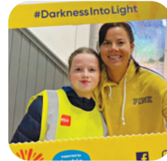
DARKNESS INTO LIGHT Page 6