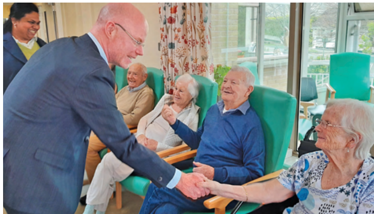
Minister Stephen Donnelly meeting with service users and staff at the newly-refurbished Wicklow Community Unit

Beds at Wicklow Community Unit are accessed via GP and /or Public Health Nurse. The Unit also accepts referrals from hospitals to assist with hospital egress. On-site services are supported from a medical perspective by Sheeran-Purcell Medical Practice and the Consultant Geriatrician attached to the local ICPOP Team.