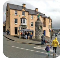
AUGHRIM ACCESSIBILITY Page 4