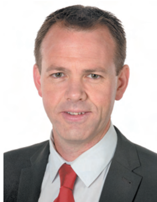
John Brady TD

Deputy Brady said, "I want to thank the party for my appointment to this important role. It is always an honour and a privilege to represent the people of Wicklow in any capacity. But, in the economic current environment where ordinary families and workers are suffering under the increases in the cost of living, which has reached unprecedented levels, it has arguably never been more