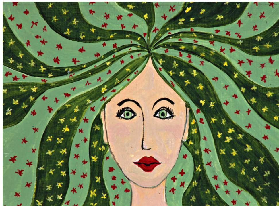
Pictured is one of the original posard artworks from this year's Incognito art sale which took place on Wednesday 26th April.

With artists participating from both home and abroad, including from