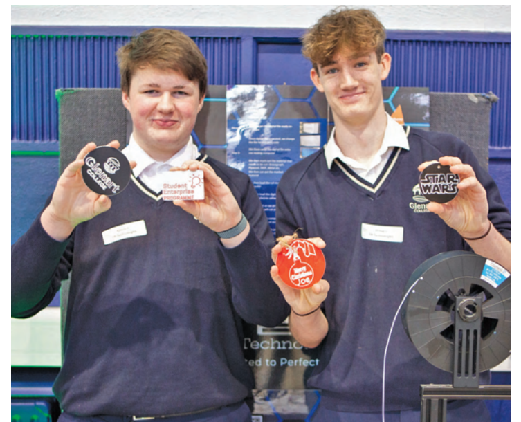
The Senior Finalist is TR Technologies, from Glenart College, who make personalised crafts using a 3D printer.

dents have taken part, learning key skills on how to create a business idea, start a business and grow a business. The Student Enterprise Programme also has new range of online resources for 2021 / 2022 at www.StudentEnterprise.ie , which will feature regular blogs and houses a full range of Student Enterprise resources for students and teachers.