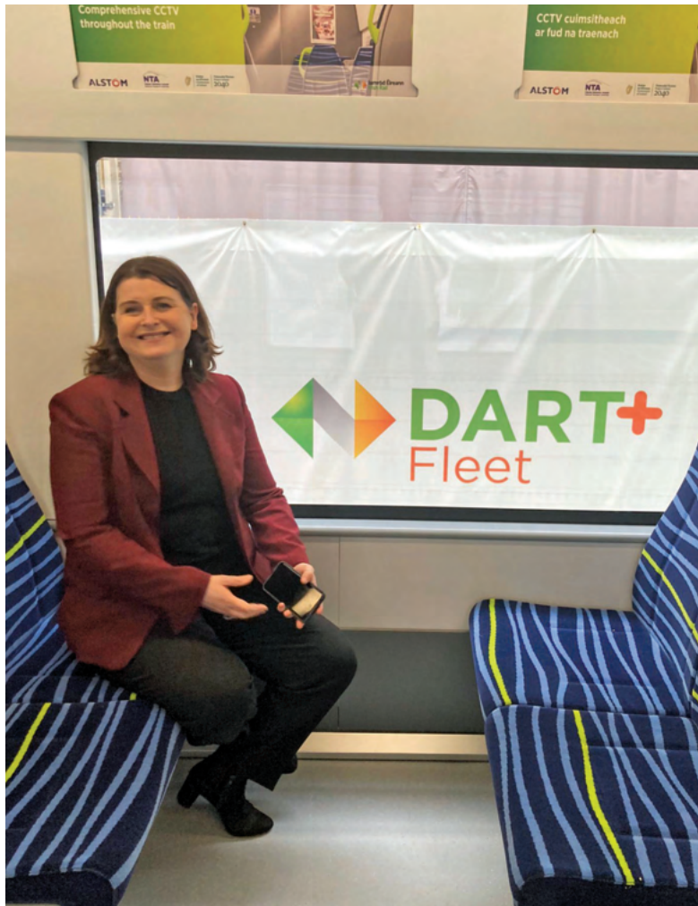
Deputy Whitmore inside one of the new battery operated Dart+ carriages that will make it possible for the Dart to be extended beyond Greystones to Wicklow Town.

Green Party TD and Social Democrats TD Jennifer Whitmore visited Inchicore Works last week where they were given a chance to inspect the new battery powered Dart+ carriages that will be used to extend the Dart to Wicklow Town.