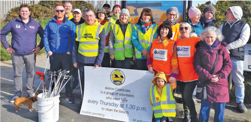
Arklow Coastcare volunteers

In 2023, the Clean Coasts Roadshow represent the first opportunity for the programme to connect and celebrate the communities and volunteers who have contributed to the growth and success of Clean Coasts over the years.