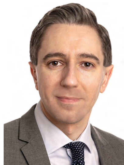
Minister Simon Harris

Minister Harris added, "I am enormously grateful for all the work of the Tidy Towns Committees throughout Co. Wicklow and I will continue to pursue further funds and allocations of resources in all Municipal Districts in Co. Wicklow."