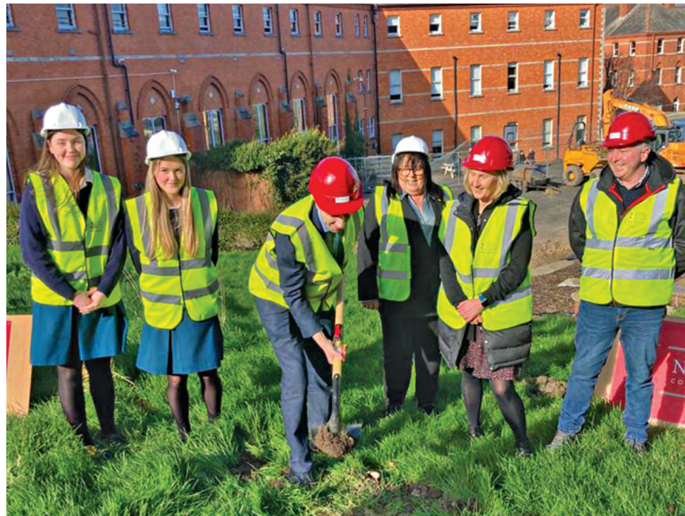
Minister Harris turning the sod on Dominican College's new Science and Technology building.

ing that accessibility becomes one of the pillars of our country's education system. We are working to create a Unified Tertiary Sector, where students can see clear paths for progress in their education, where joined-up thinking encourages and enables students to get the most out of their studies and develop their skills in meaningful and rewarding ways.