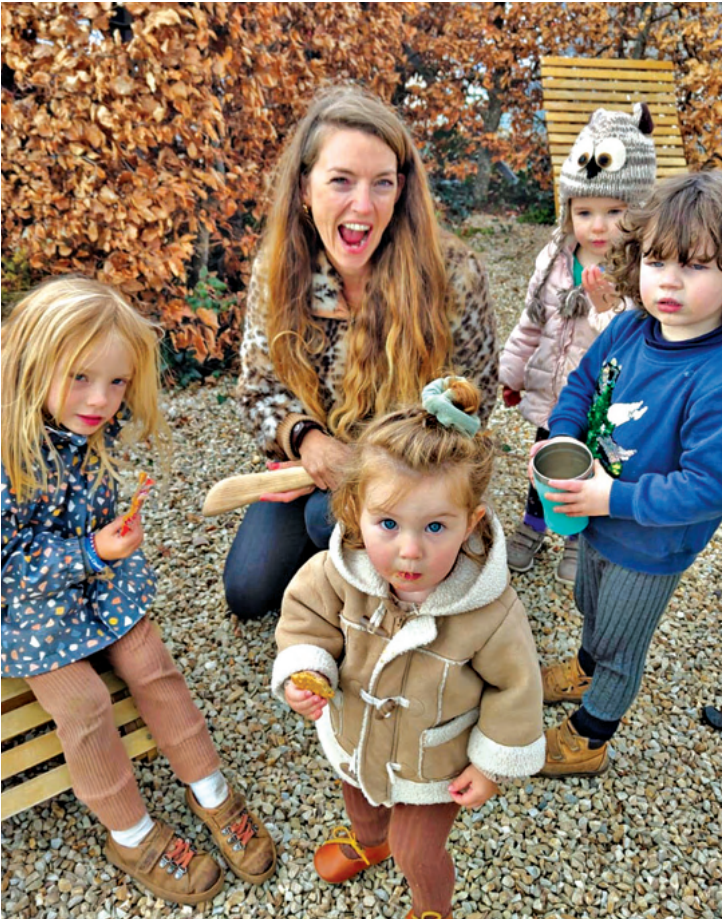
Some of the younger members of the crowd