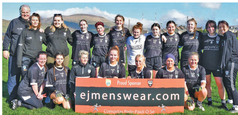
The Newtownmountkenedy ladies team

say the power and draw of this tournament for those interested in Gaelic games is still massive. I'd like to also extend a thanks to all the referees, volunteers and of course our partners for helping to run the football festival each year."