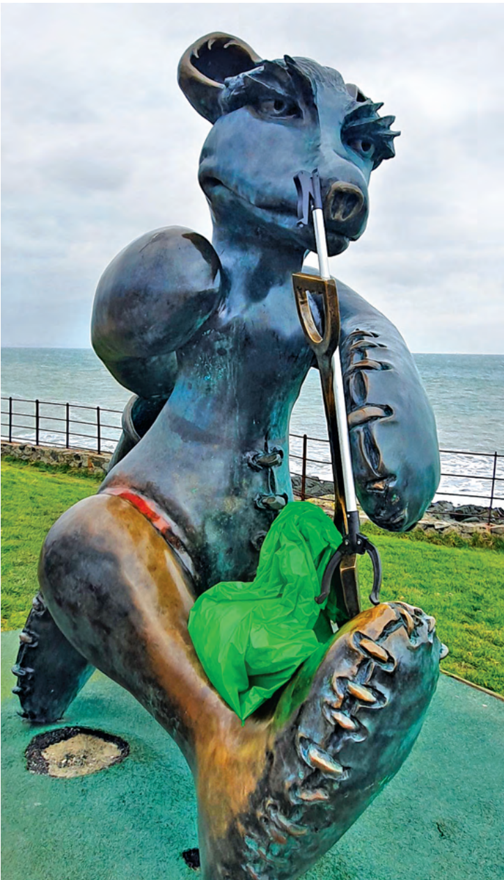
Greystones ready for Spring Clean