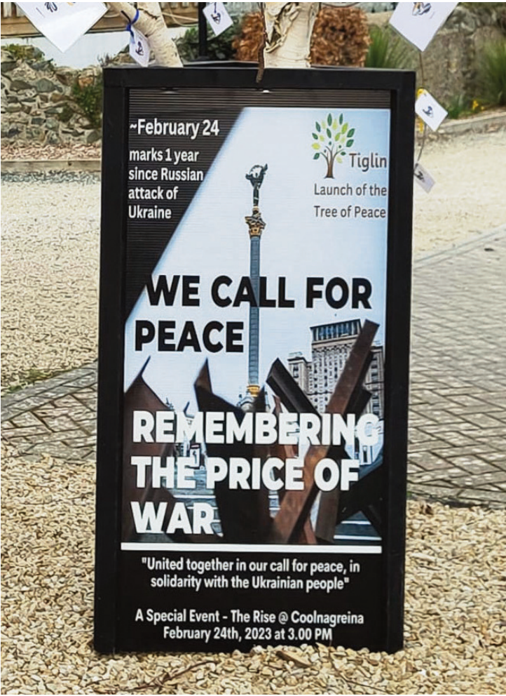
Poster calling for peace