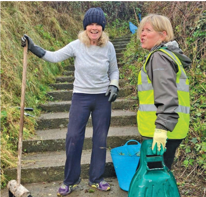
Volunteers cleaning up on Bray Head

These principles of a circular economy have been central to the ethos of National Spring Clean for the past 24 years. Last year some 35% of all waste collected was recycled, thanks to recyclable waste bags provided to groups and individuals who register, while the removal of litter from our natural environment has helped