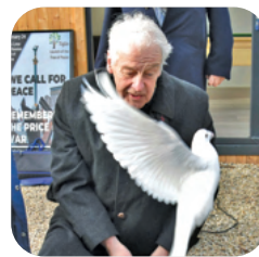
CALL FOR PEACE Page 12