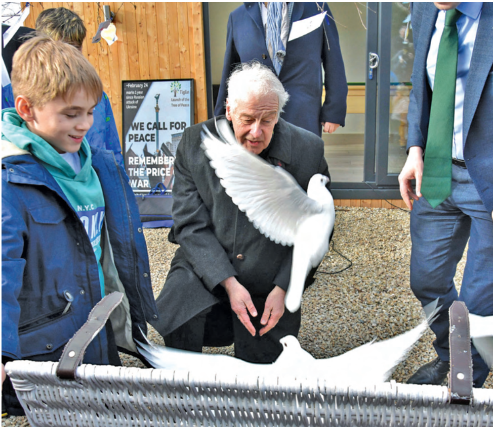
Archbishop Michael Jackson releasing the doves with Minister Simon Harris

The Archbishop of Dublin and Wicklow, The Minister for Justice Simon Harris, pupils from St. Patrick's Primary school, and people from the Greystones community recently joined Tiglin in a call for peace in Eastern Europe. Minister Harris released doves while the Ukrainian guests called for peace.