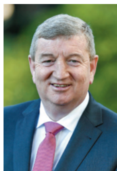
Senator Pat Casey

The housing crisis continues to worsen, with Co. Wicklow being hit particularly hard. According to property website Daft, there were just 29 rental properties available in the entire county at the end of February, with rents for loft-style homes in Kilmacanogue reaching a high of €5,500 a month, among many other properties priced at the top end of the market.