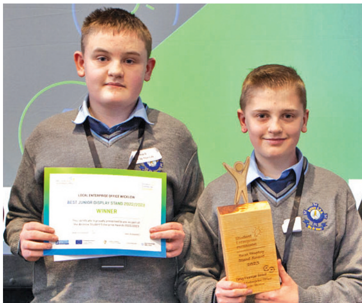
Gonk Up Your Life from Arklow CBS won the award for Best Junior Display Stand

A total of 36 teams showcased their enterprises, which they developed over the course of the academic year as part of the Student Enterprise Programme. Students from 1st to 6th Year showed high levels of innovation, creativity and hard work as they displayed their enterprises to the judging panel.