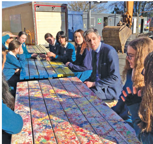
Minister Harris talking with Dominican College students