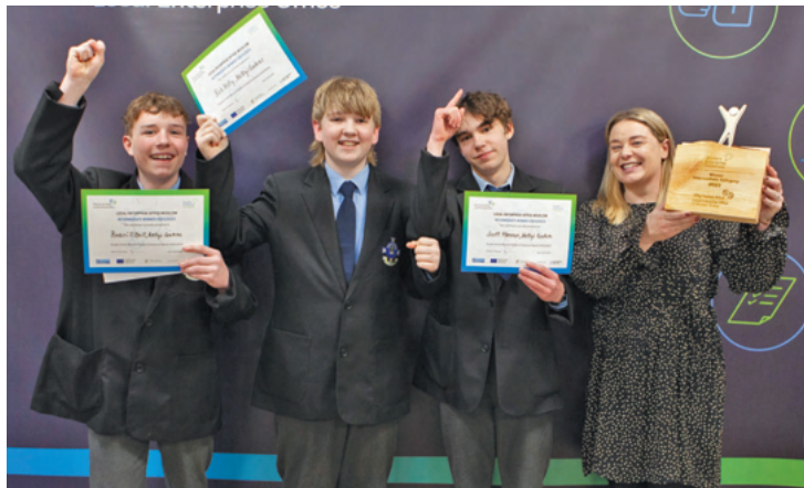
Kelly's Cookies from Arklow CBS was announced as the Intermediate Category Winner

Student enterprises across the County gathered at the Local Enterprise Office Wicklow on Thursday 2nd March for this year's Wicklow Student Enterprise Awards.