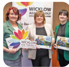
AGE FRIENDLY Page 4