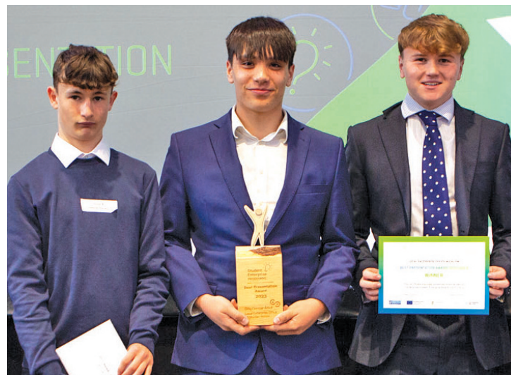
The Best Presentation Award went to Texture Therapy from North Wicklow Educate Together