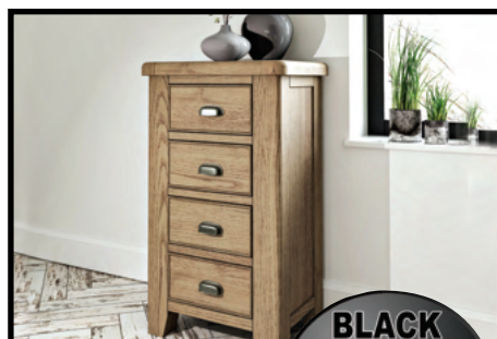
HOLLY 4 DRAWER CHEST RRP €635