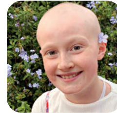
WALK FOR ALICE Page 4