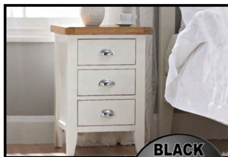
TARA LARGE BEDSIDE WHITE RRP €335