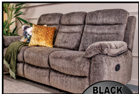
ARVO 3 SEATER RRP €1495