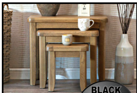
HOLLY NEST OF 3 TABLES RRP €499