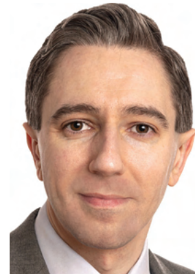
Minister Simon Harris

"The grants can also be combined with the SEAI Better Energy