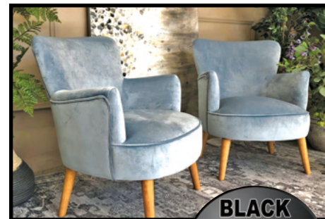
CHANDLER CHAIR No2 RRP €475