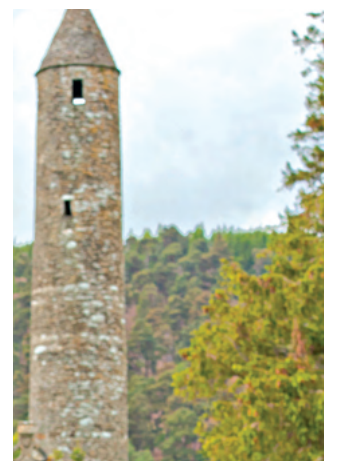
The Round Tower, Glendalough

"There was a lot of feedback at the consultation stage about accessibility to places like the upper car park during the off-peak times. Our initial plan that we put forward was to close the upper lake car park completely. We've gone from that. We are saying we will close it at peak times, except for the shuttle buses and potentially also people who hold blue badges and with accessible transport. At off-peak times, those car