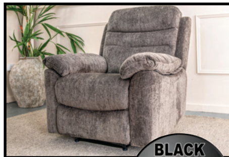
AVRO CHAIR RRP €795