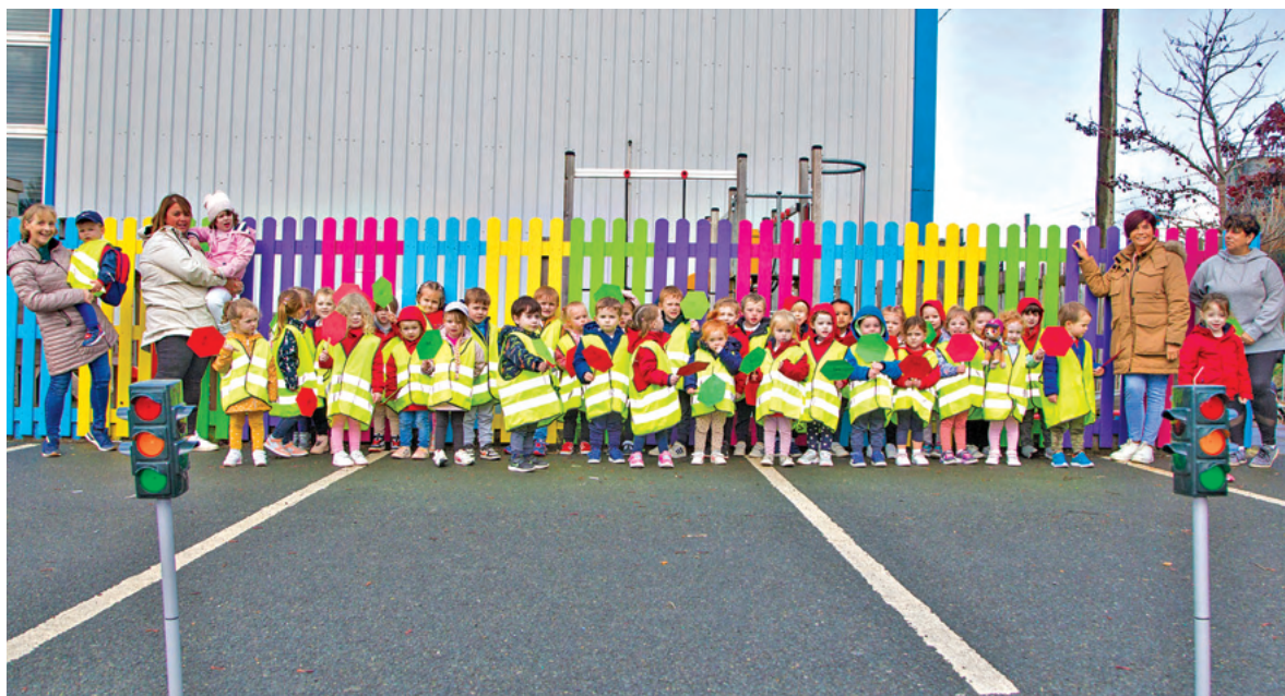
Tiny tots from Imagination Station Preschool in Arklow who took part in the recent Beep-Beep Day, the national road safety awareness day for young children.