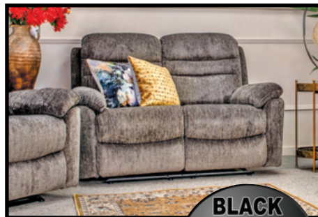
ARVO 2 SEATER SOFA RRP €1195