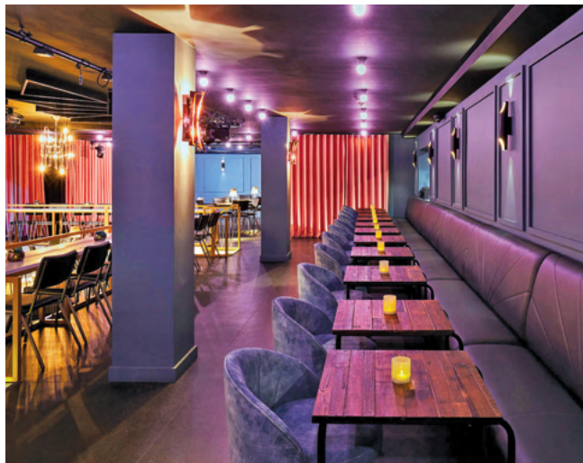
The Whale Theatre in Greystones

A number of pubs, hotels and venues around Co. Wicklow have been approved grants under the Night-Timer Economy Support Scheme.