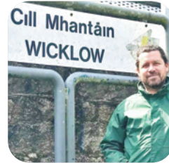
ADDITIONAL TRAIN Page 3