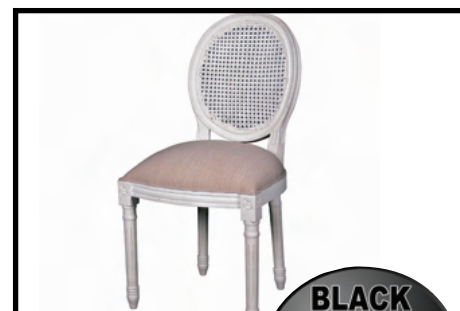
MARLENA DINING CHAIR RRP €365