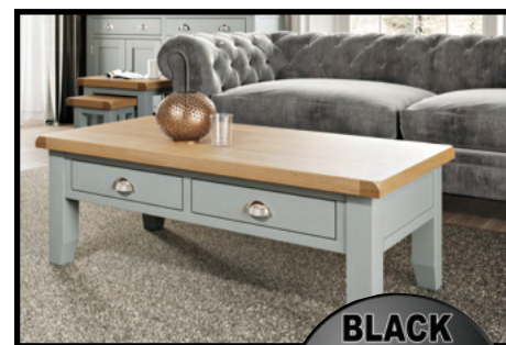
TARA LARGE COFFEE TABLE GREY RRP €715