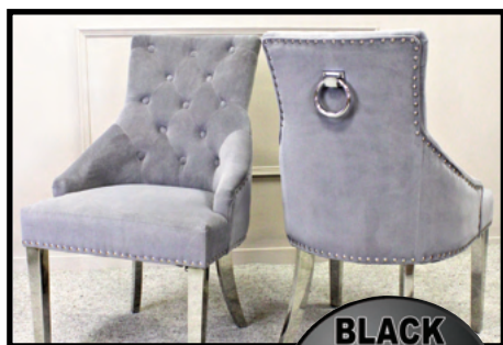
ESTELA KNOCKERBACK DINING CHAIR RRP €225