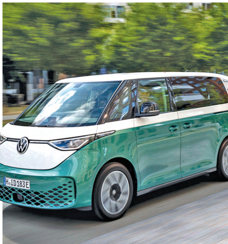
Volkswagen ID Buzz

Mercedes Benz scooped three class awards while the Kia won in two categories. Overall half the category winners were battery electric powered with the other half being petrol or diesel fuelled, some with a PHEV option.