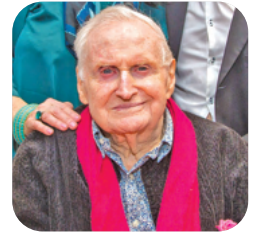
JOHN BOORMAN Page 10