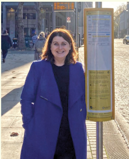
Jennifer Whitmore TD