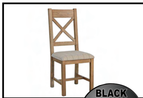
HOLLY CROSS BACK DINING CHAIR NATURAL CHECK RRP €259