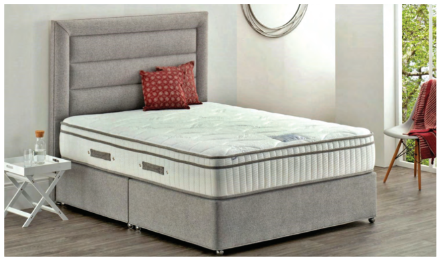
Respa Reflection Mattress 4Ft6 Now €1195 5Ft Now €1295

Discounts on all stock even special orders!