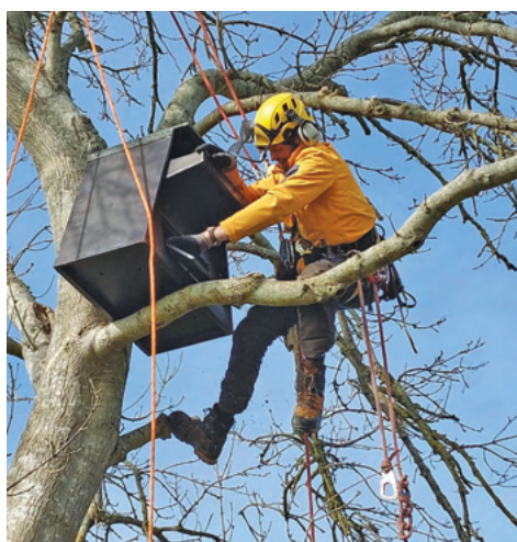
A Barn Owl nesting box being fitted as part of the Wicklow Barn Owl Project, which hopes to improve the prospects for this endangered bird in the county.