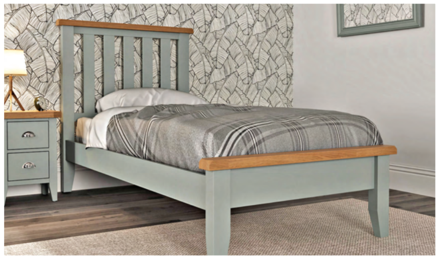
Tara 3Ft Bed Frame Now €335