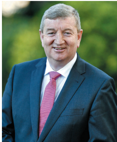
Senator Pat Casey

increase of home building both public and private in Wicklow are proof that Fianna Fáil in Government are making a huge difference to the supply of homes for all the people of the county. Housing delivery in all parts of Wicklow has been one of my top priorities in becoming a national politician and I will continue working to ensure that all the people of Wicklow have access to housing. Other parties just hurl insults but the facts in Wicklow prove that our policies are