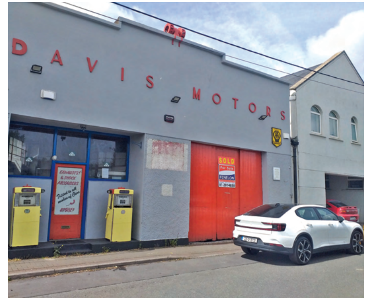
Polestar 2 outside the iconic Davis Bros. Garage, Greystones

The Polestar IT infrastructure is immersed in Google