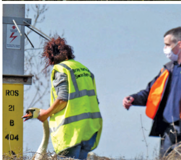
Above: Swans flying towards Bray bridge and below: A swan being removed from the Dart line in Bray.