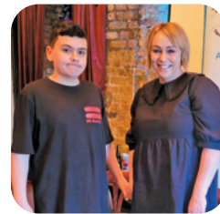
UNSUNG HERO Page 12