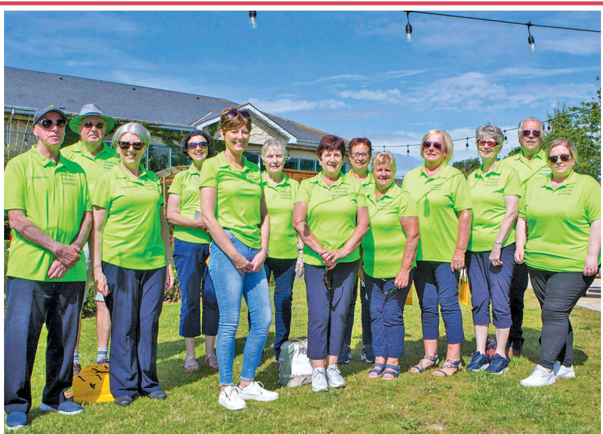
Members of Arklow Cancer Support Group at their recent coffee morning fundraising event.

*In contentious business, a solicitor may not calculate fees or other charges as a percentage or proportion of any award or settlement