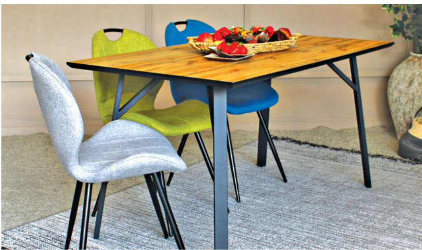
Weston Dining Set, Table & 4 Thor Chairs Now €645