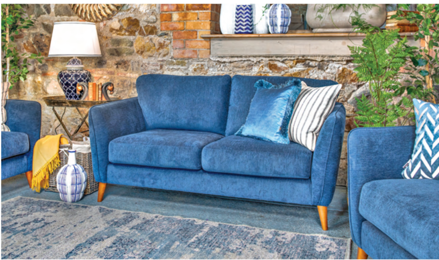
Harley 2-Seater Sofa Now €845