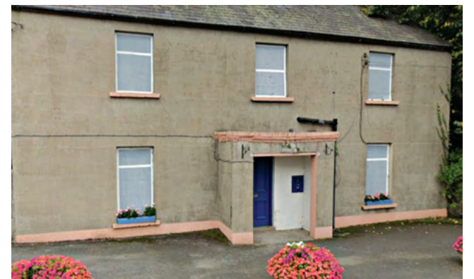
The former Garda station in Ashford

"When the Bank of Ireland announced the closure of 88 of its branches across the state, three of the branches were located in Wicklow, in Carnew, Rathdrum and Tinahely. I made repeated representations at the