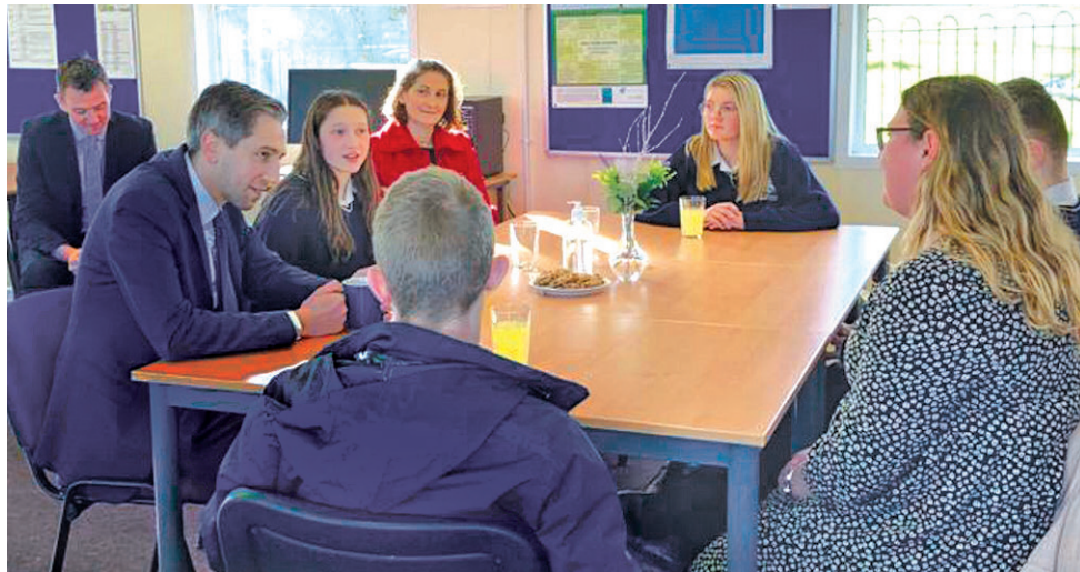
Minister Harris meeting with students and teachers at Greystones Community College

Fine Gael Minister Simon Harris TD has been advised that the permanent buildings for Greystones Community College are likely to be in next bundle of Design & Build projects from the Department of Education that will proceed to tender later this year.