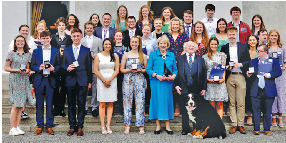
The 2021 Gaisce awardees

Seventy-nine young people from across Ireland have been commended for their outstanding commitment to personal development and contribution to society at the Gaisce Gold Award ceremony that took place on Tuesday 5th July.