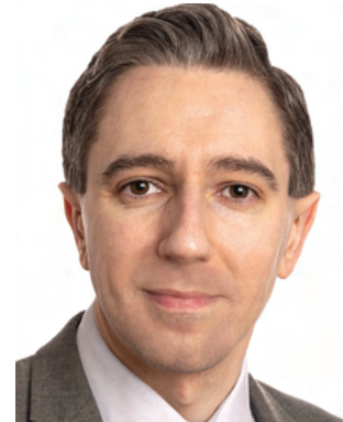
Minister Simon Harris

"The funding to be invested at Clermont is one of 15 projects to