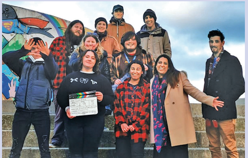
Some of the crew

Tickets are on sale now at https://whaletheatre.ticketsolve.com/shows/873627833