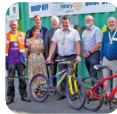
BIKES FOR AFRICA Page 4