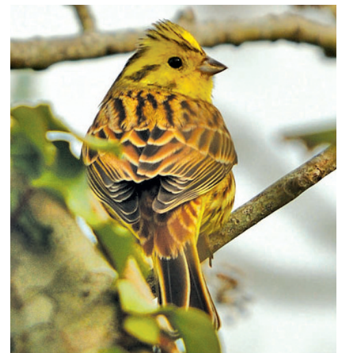
The Yellowhammer is put at risk by the removal of hedgerows from farmland, Birdwatch Ireland says.

These are activities that cause anger and upset in people who see the destruction, are aware of the biodiversity crisis and worry about the impacts to wildlife in their area. We call on the Department of Agriculture to get serious about protecting hedgerows and to fund their proper management for wildlife in Ireland's CAP ecoscheme".