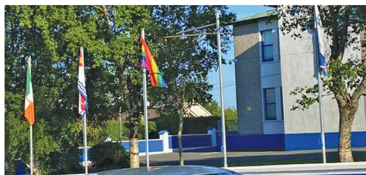
The Pride flag at Arklow C.B.S. in 2021