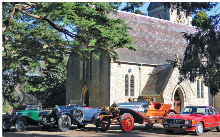
Just some of the incredible cars that will be on display at the show, including a Lagonda, a Bentley, 'Chitty' and a Mercedes

The team organising the Powerscourt Parish Veteran, Vintage and Classic Car Show is gearing up for fun-filled day on Sunday 29th May. There will be a carefully curated exhibition of vehicles from the 1900s to the 1980s, headlined by the iconic Chitty Chitty Bang Bang.