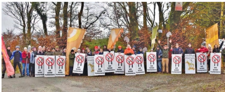
Protesters standing against the development of wind turbines on Kilranelagh Hill

ABP also noted that the development contradicted a number of stated objectives of Wicklow's 2016-2022 County Development Plan. "The proposed development, by itself and by the precedent it would set,