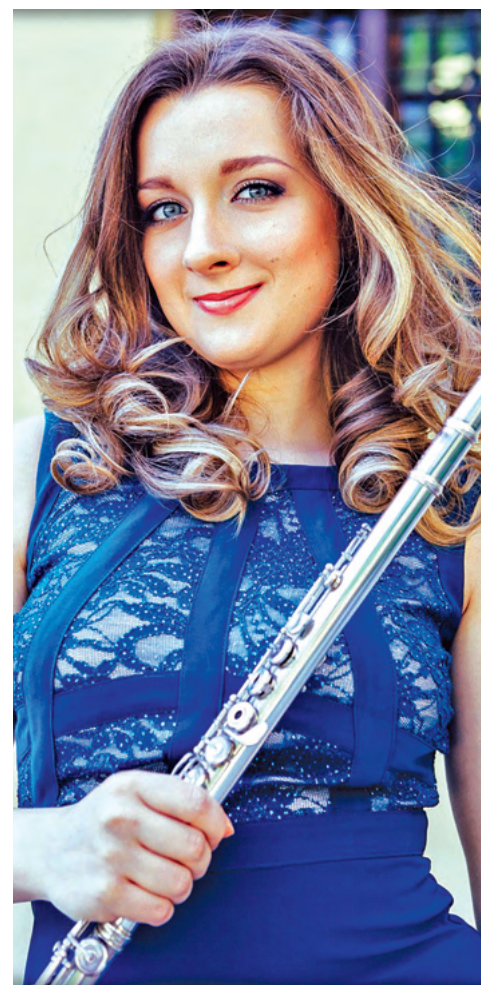
Lithuanian flautist Silvija Scerbaviciute