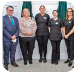
PRIMARY CARE CENTRE Page 3