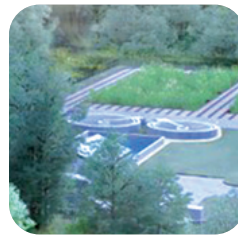
AVOCA WWTP Page 6