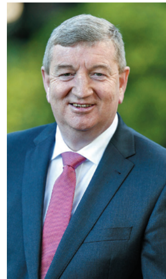
Senator Pat Casey

"The last two years of Covid has seen the great value of community services in protecting and valuing our older population and I will use this honorary position to promote these services and these important principles in the years ahead."