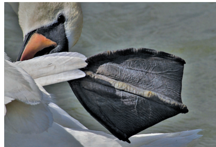
Odeta Burokaite's image Webbed Foot which placed in the top ten for the Creativity and the Coast category.