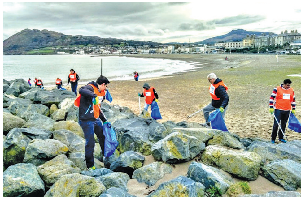
The Clean Coasts volunteers cleaning up Bray Seafront

Statistics show that the number one cause of marine litter is litter dropped in towns and cities. Building on the success of the Spring Clean 22 campaign, which took place in the month of April and saw over 3,000 volunteers organising over 130 clean-ups in county Wicklow, the National Spring Clean programme is joining Clean Coasts this year in supporting these communities around Ireland.