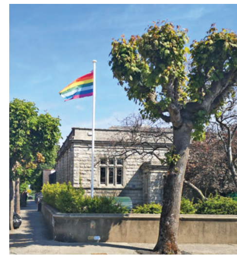
The Pride Flag flying at Bray Library last year

Senator David Norris became the official Patron of the Festival. In 2015 he visited Arklow to officially launch it and to unveil the Wicklow Pride Festival monument that commemorates the occasion in Arklow Town Park.