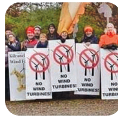
NO TURBINES Page 9

DELIVERED TO HOMES & BUSINESSES IN: SHANKILL, ENNISKERRY, BRAY, GREYSTONES, DELGANY, KILCOOLE, NEWCASTLE, KILQUADE, ASHFORD, KILPEDDER, NEWTOWNMOUNTKENNEDY, KILMACANOGUE, LARAGH, MONEYSTOWN, ROUNDWOOD, RATHNEW, WICKLOW, GLENEALY, BRITTAS BAY, AVOCA, WOODENBRIDGE, ARKLOW, SHILLELAGH, TINAHELY, REDCROSS, BALLINACLASH, AUGHIRM, RATHDRUM, DONARD, DUNLAVIN, CARNEW, COOLATTIN, BALTINGLASS, BLESSINGTON.