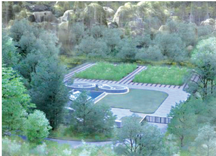
Aerial view of the proposed wastewater treatment plant in Avoca

Irish Water has announced that following detailed design works, a planning application has been submitted which includes the construction of a new state-of-the-art wastewater treatment plant and associated works in Avoca beside the existing plant located off Tower Avenue.