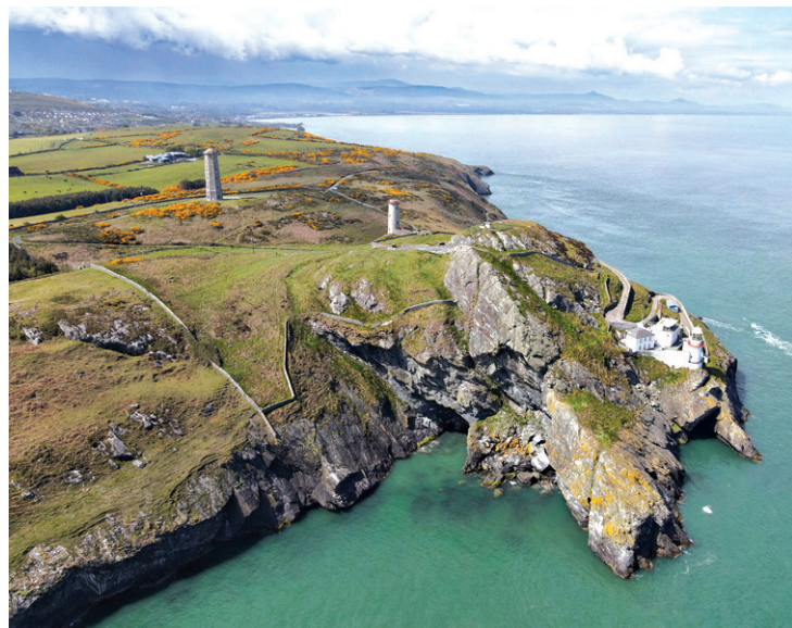
James Grandfield's image entitled Three Generations from the Coastal Heritage category in 2021