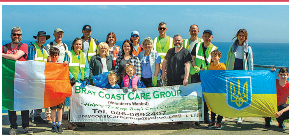
Bray Coastcare volunteers with members of the Ukrainian community in Bray at a clean-up on Bray Seafront on Saturday 14th May. The Ukrainian community has reached out to Bray Coastcare to ask if they can participate in the group's monthly clean-up events. A Facebook group called 'Bray and Ukraine Community' has been created to bring Ukrainian refugees in Bray together with local residents on a number of initiatives.