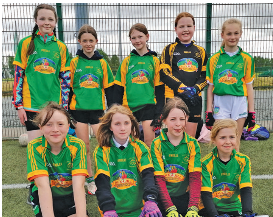
Pictured is the Kilmac team at the 5th and 6th Class Cumann na mBunscol Chill Mhantain Girls Football Participation Day at Bray Emmets GAA Club. Schools represented included St. Laurence's, Kilcoole, Scoil Chualann, Ashford, Roundwood, St. Brigid's, Gaelscoil na Clocha Liath, Greystones Educate Together, Newtown, Kilmac, Greystones Community National School and St. Peter's. There were some great displays of teamwork and score taking as well as fast paced skilful football.