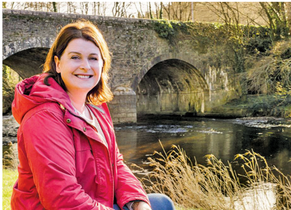
Jennifer Whitmore at the Avoca River

Social Democrats TD Jennifer Whitmore has said that Wicklow's biodiversity is at a crossroads and must be prioritised by government. Deputy Whitmore made the comments during National Biodiversity Week and after the first meeting of the Citizens' Assembly on Biodiversity.