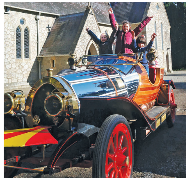
Chitty Chitty Bang Bang will be the star of the show at the Powerscourt Parish Car Show

All proceeds will go to St Patrick's Church, Powerscourt, and the organisers would like to record their grateful thanks to all sponsors and donors.