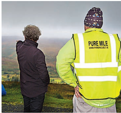
The Atha Cliath 'Clean up the Uplands' team

incorporating statutory, non-statutory organisations, and members of the public, has proven extremely successful in combating illegal dumping in the Wicklow/Dublin Uplands and over the past five years they have recorded an annual reduction in illegal dumping activity. This reduction in dumping coincides with the huge increase of Pure Mile groups and areas.