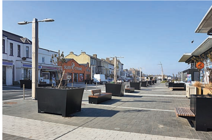
Strand Road Plaza in Bray

"This completed project has significantly enhanced the area and it has given people the opportunity to sit and relax; allows people to move about easily and comfortably between amenities, cafes, and businesses on both sides of Strand Road Plaza; provides a coherent connection between the footpaths