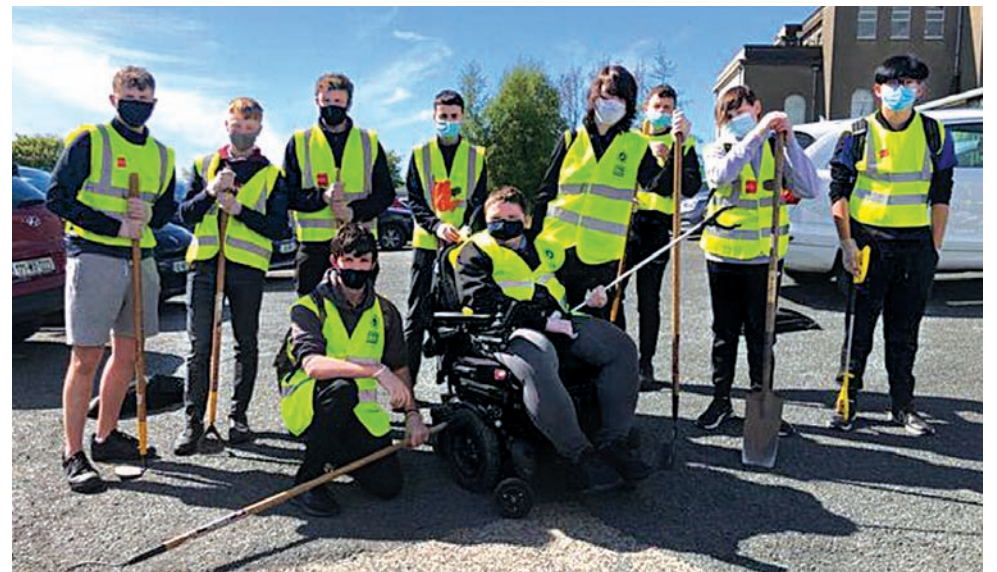
Members of Rathdrum Tidy Towns and Rathdrum Trout Anglers cleaning up.

Wicklow County Council is supporting the National Campaign