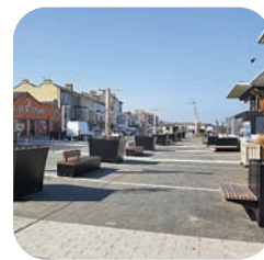
BRAY PLAZA Page 6