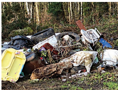
Dumping in the Wicklow woodlands.