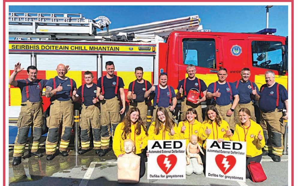
Greystones Firefighters and members of Poseidon Lifesaving Club at Greystones Harbour. Poseidon Lifesaving Club helped Greystones Fire Service raise €1,200 through car washing for public access AEDs (Automated External Defibrillators) around the town.

For those who wish to donate to this vital cause see https://www.justgiving.com/fundraising/bluebird-careukraine