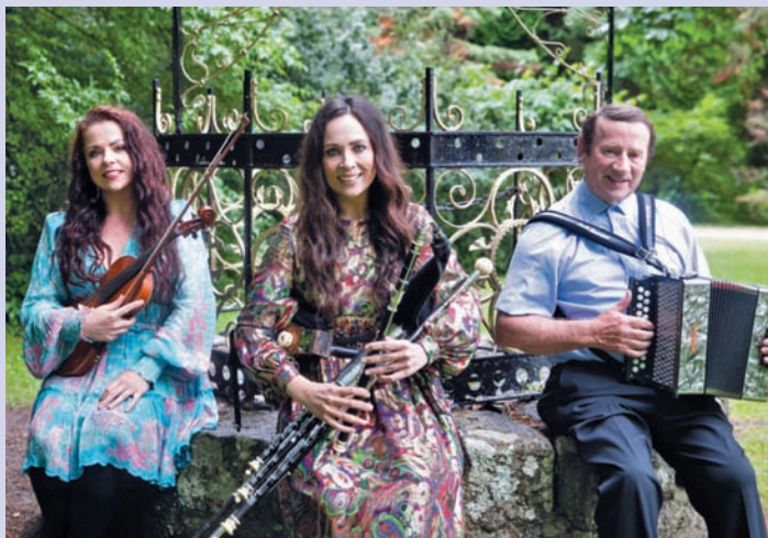
The Mulcahy Family