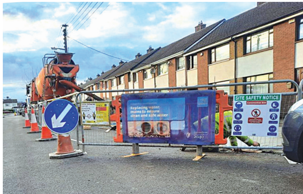
Charnwood in Bray where Irish Water carried out works to replace backyard service connections