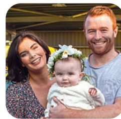
BABY PENNY Page 4