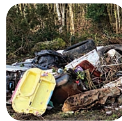
SPRING CLEAN Pages 10-13