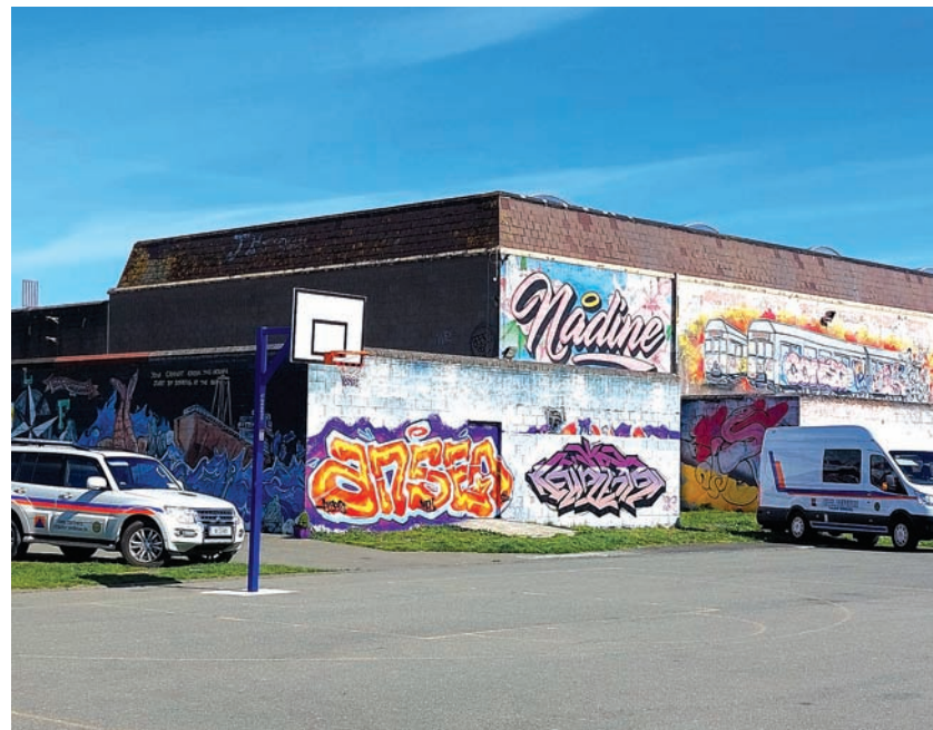
Coral Leisure Centre in Arklow

"Outside of the accommodation established at Coral Leisure Centre, the Council has also secured emergency accommodation for refugees across the County in hotels and guest houses."