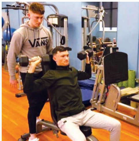
SCFE Fitness Instruction and Exercise Science students practice their teaching skills

Sallynoggin College is easily accessible to Wicklow students via the Dart and bus corridors. Choices include Art & Design, Acting, Musical Theatre, Dance, Fashion, Hair and Beauty, Childcare, Social Studies, Special Needs Assisting and much much more! All of courses deliver a choice of clear progression routes to employment or further study at University.