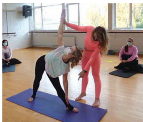
SCFE students on the Yoga Teaching course working on their routine

business or progress with proven links to third level courses. SCFE will