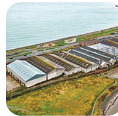
VEHA SITE Page 6