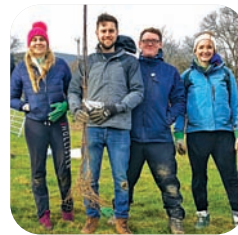
REWILD WICKLOW Page 12