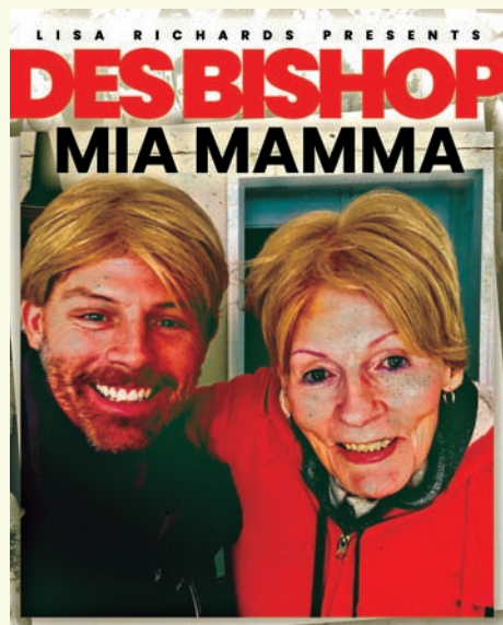
Des Bishop brings his new show 'Mia Mamma' to the Whale Theatre on 25th February

Friday 25th February @ 8pm. Sold Out. Tickets €28 available at www.whaletheatre.ie or call the booking office on 01 2010550