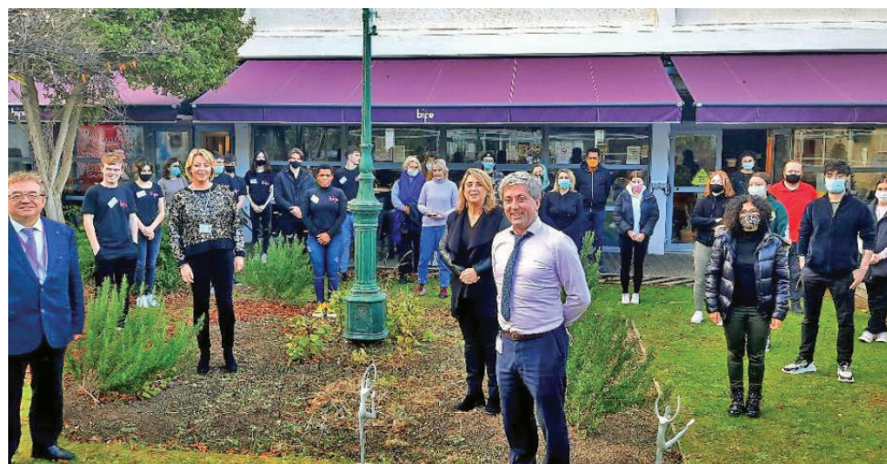
BIFE Staff and Students at BIFE's Erasmus+ International Event preparing to head to Spain and Finland as part of their work experience internships