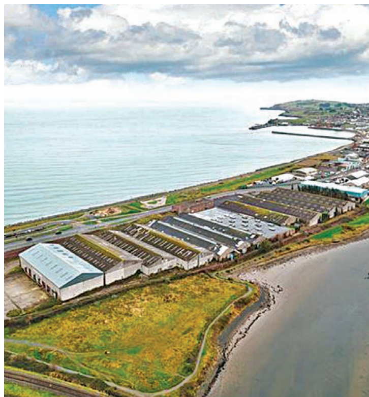
The Veba site at The Murrough, Wicklow Town