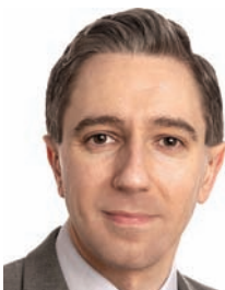
Minister Simon Harris