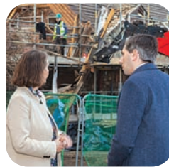
CLERMONT Page 4