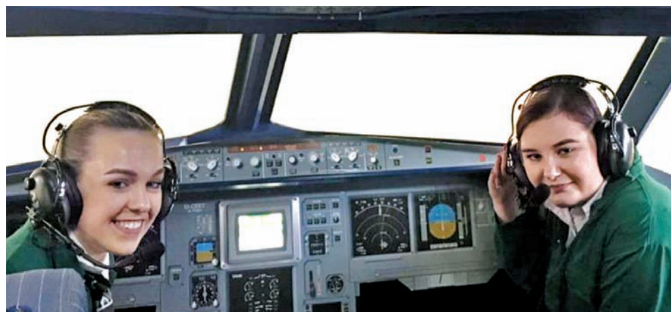
SCFE Travel and Tourism students on skills practice at Waterford Airport

support you every step of your journey via a mix of small groups, flexible times, and blended learning in a fun diverse campus. SCFE have expanded the range of courses available to meet future skill needs in these areas to include Physical Education (PE) & Sports Coaching, you can also train to be a Yoga or Pilates Teacher specialising in wellbeing and holistic studies. Students from all of these courses can progress to a range of third level degree courses as well as employment.