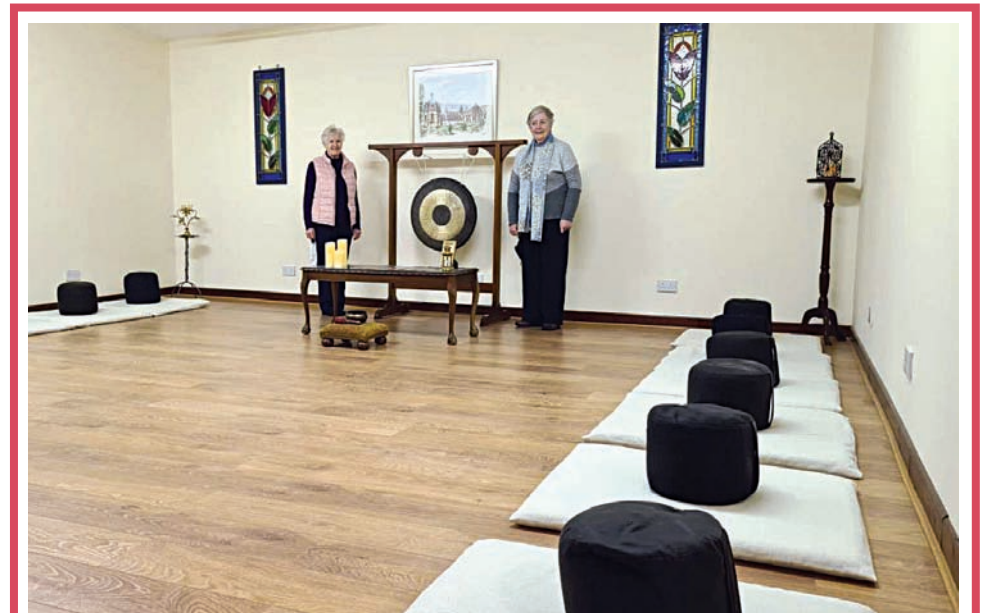
Tutors, volunteers and participants are now being welcomed to the new Luisne in Bray which is opening this week for the beginning of term on February 14th at its new location at Hub D, Egan Business Centre, Upper Dargle Road. The rooms are bright and comfortable. As long as Covid is with us masks will be required. It is not too late to register for courses – see www.luisne.ie for course listings. You will receive a warm welcome. Pictured is the Meditation Room at the new premises.