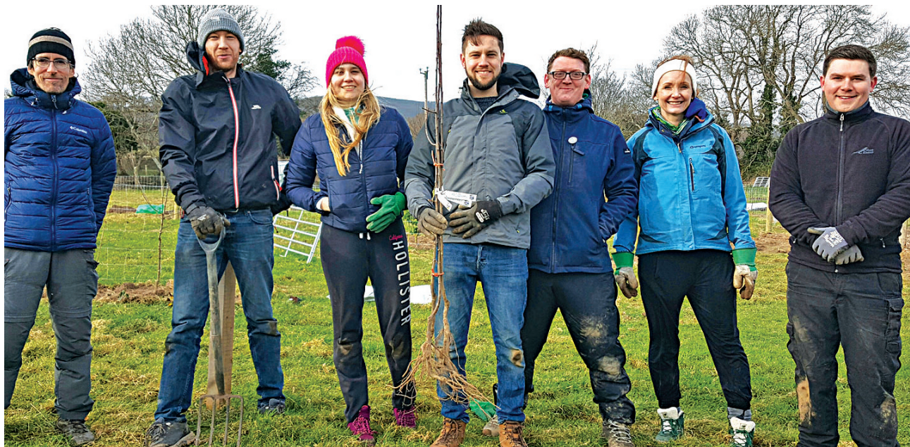
The ReWild Wicklow members launching their new environmental group at a tree planting at Jacksmill Forest Gardens

ReWild Wicklow marked their launch as a new environmental organisation with a tree planting event on Saturday 5th February at Jacksmill Forest Gardens, Timmore, in Newtownmountkennedy.