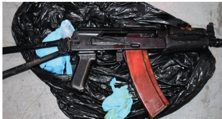
The Sten machine gun that was seized last week.

This operation was part of Revenue's ongoing joint investigations targeting organised crime groups and the importation, sale and supply of illegal drugs. If businesses, or members of the public, have any information regarding drug smuggling, they can contact Revenue in confidence on Confidential Phone Number 1800 295 295.