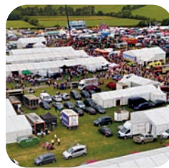
TINAHELY SHOW Page 2