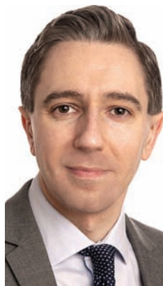
Minister Simon Harris

"Crucial to making an economic success of Ireland's south-east region is retaining and attracting talent and creating well-