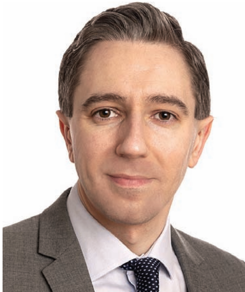
Minister Simon Harris

Minister Harris said, "My colleague, Tánaiste and Minister for Enterprise, Trade and Employment, Leo Varadkar, has received approval to publish the Consumer Rights Bill 2022, which is an extremely welcome development.