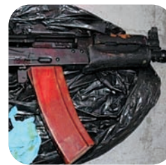
RAIDS Page 5