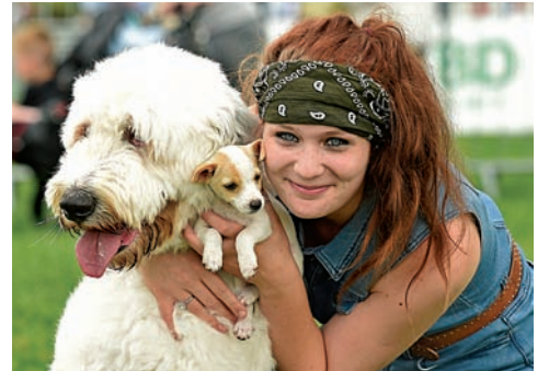
The dog show returns to this year's festival