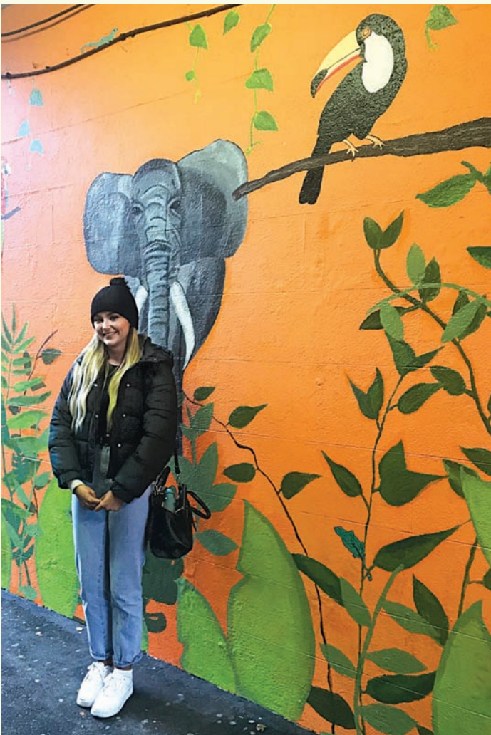
Mural in Bray Arcade