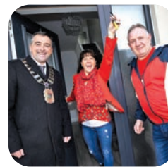
NEW HOMES Page 4