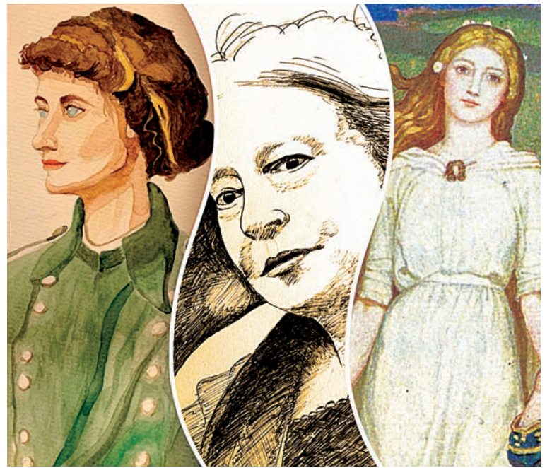
Countess Markievicz, Lady Gregory and St. Brigid

Contact Ivona at New Acropolis Bray on (01) 551 6833 or visit www.acropolis.ie