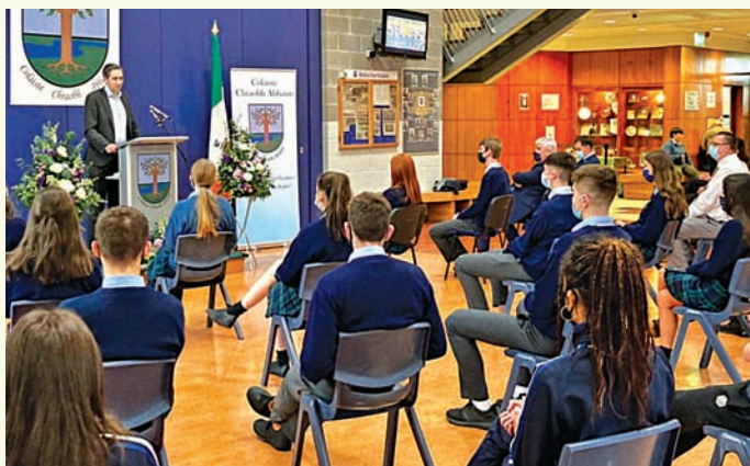
Minister Harris speaking in Colaiste Croabh Abhainn

"As I emphasised to the students in Colaiste Croabh Abhainn and Presentation College today, visit cao.ie/options . Take your time, consider all of the options in front of you and make the best decision for you and nobody else."