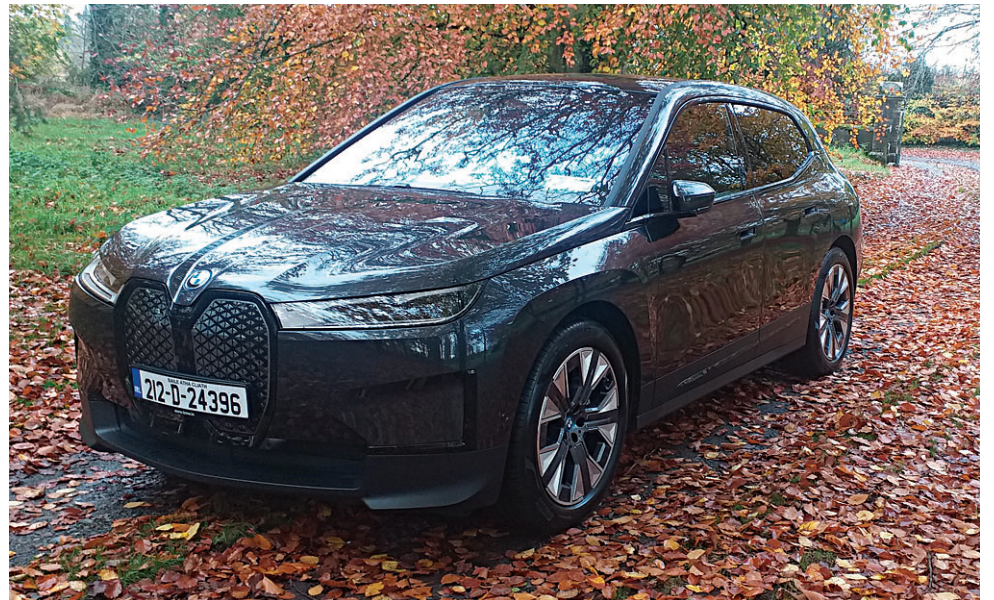
The BMW iX in an autumnal West Wicklow

Last week myself and a colleague drove the iX from Sandford, through Blessington and West Wicklow and over to Burtown House and Garden Centre in Kildare, near Athy. As the last of the Autumn leaves were shedding, West Wicklow never