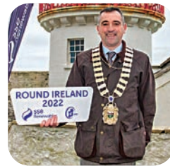
ROUND IRELAND Page 4