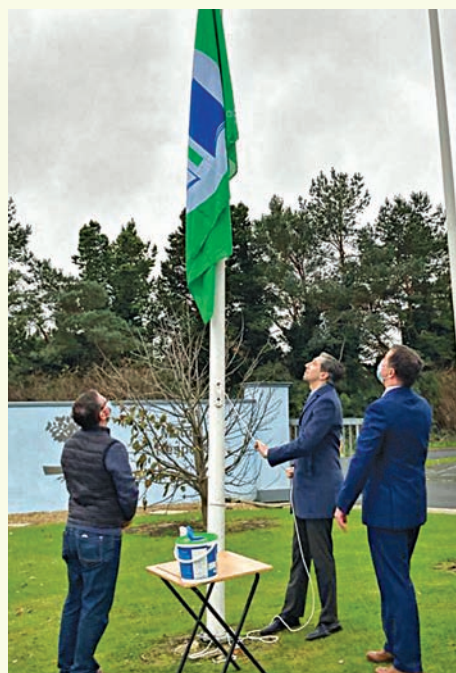
The Green Flag being raised at Colaiste Croabh Abhainn in Kilcoole.

"In Wicklow the Bray Institute for Further Education not only offers a wide variety of