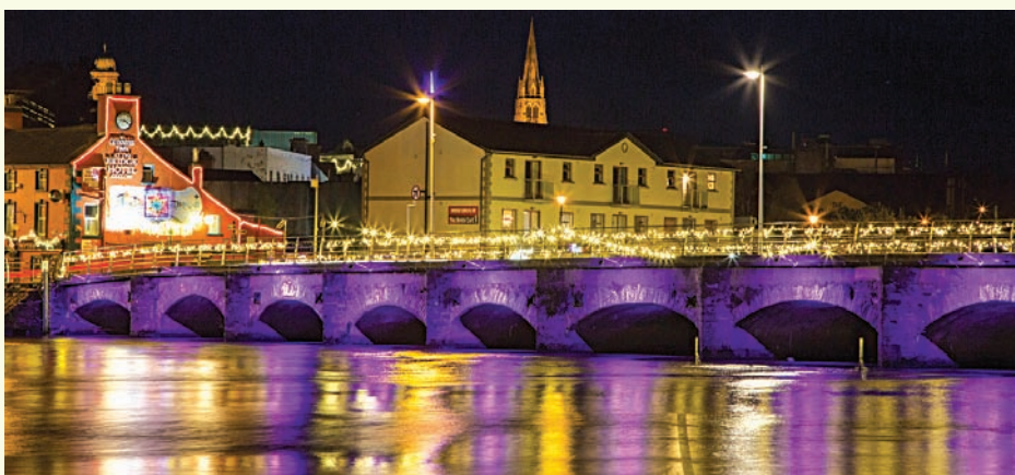
The 19 Arches Bridge in Arklow