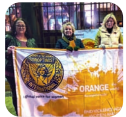
ORANGE THE WORLD Page 10