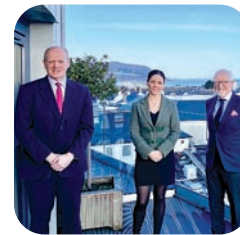
LIVCOM AWARD Page 6