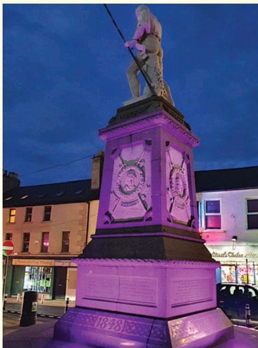
The Billy Byrne Monument in Market Square, Wicklow Town