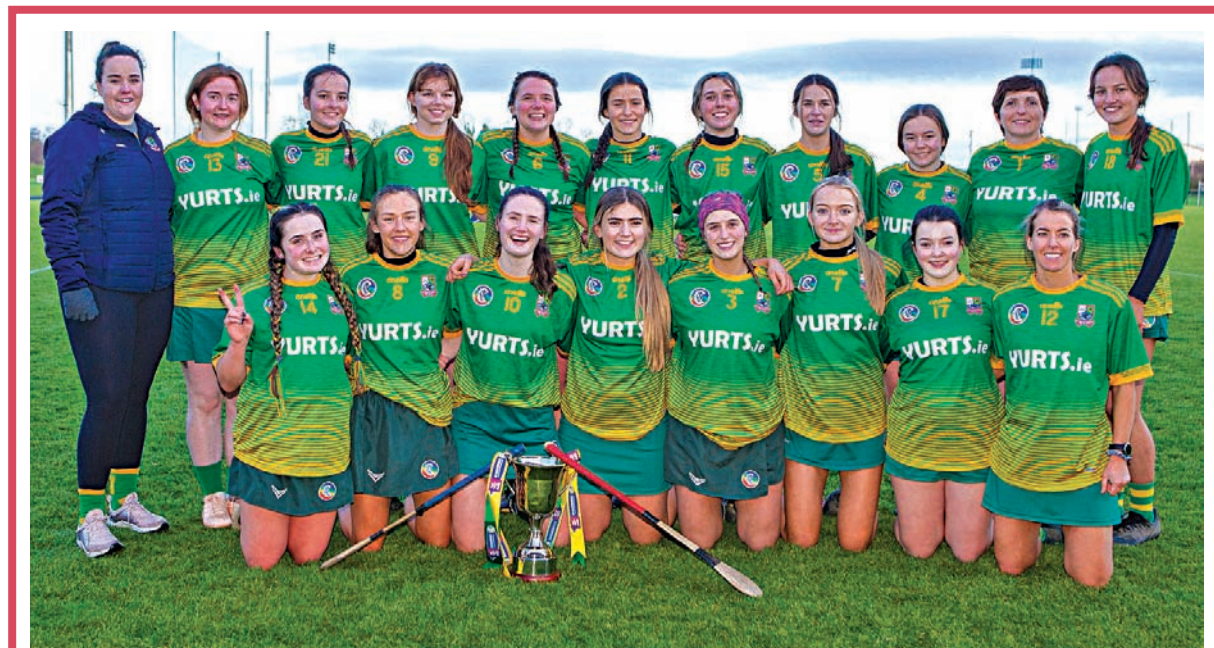
Pictured is the Knockananna side who beat Drumraney of Westmeath in the AIB Senior Camogie Championship Junior B Final which was played at the National GAA Development Centre in Abbotstown, Co. Dublin. The final score was 2-12 to 1-04.