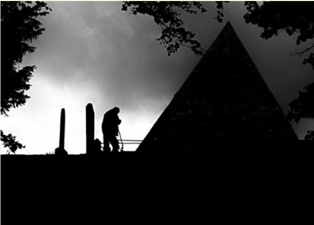
Kilbride Graveyard in Arklow was one of the sites which received funding through the Community Monuments Fund this year.