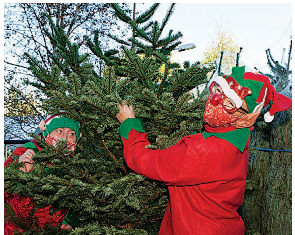
Elves Jingle and Sparky at Santa's Grotto at Coffee Delights in Bray.

FACTORY: Unit 10, Block 1, Broomhall Business Park, Rathnew. Tel: 0404 20344