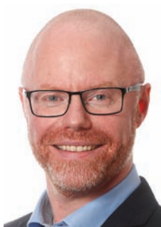
Minister for Health Stephen Donnelly

"I've seen first-hand the tremendous work done by Wicklow Hospice and know how they along with the support of the local community have managed to build a world class facility.