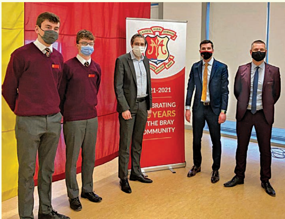
Minister Harris meeting with students and staff in Presentation College Bray