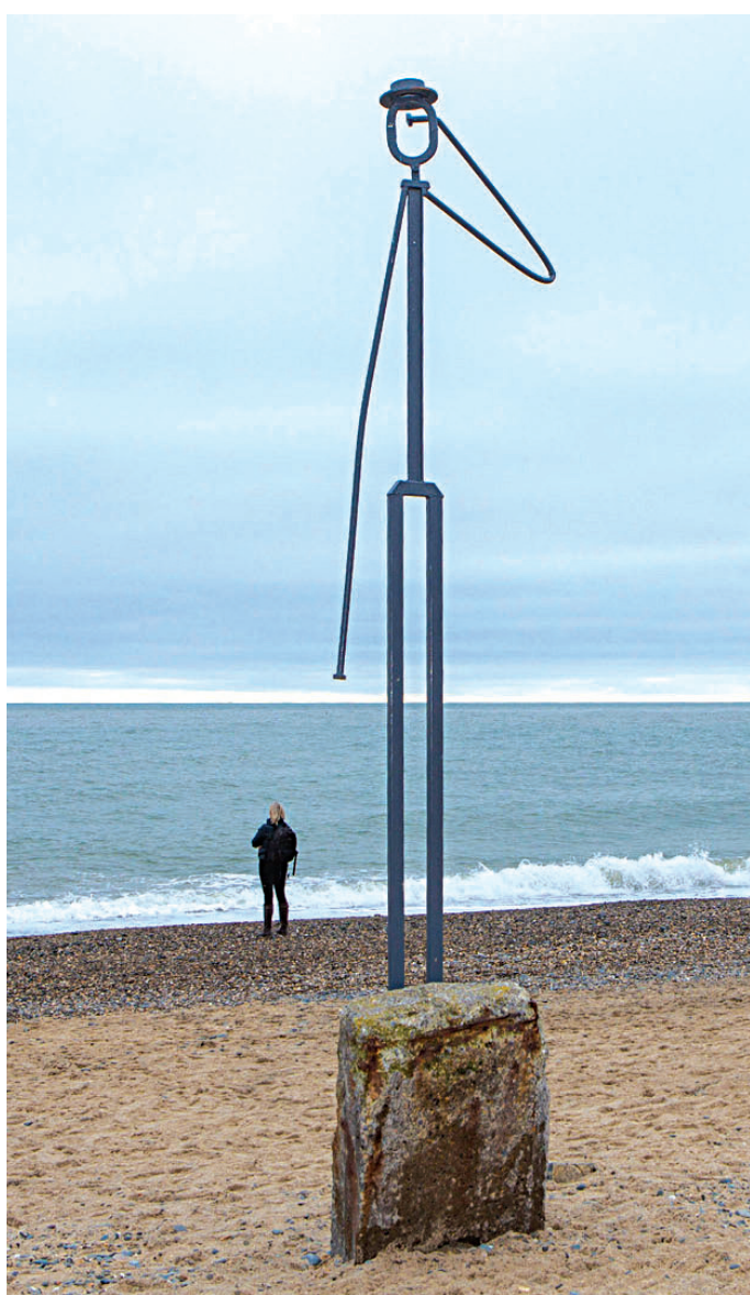
A 'Mystery Man' that appeared overnight recently on South Beach in Arklow, placed there by an unknown artist. The sculpture is about 3 metres high and made of metal. It depicts a man wearing a hat and looking out to sea.