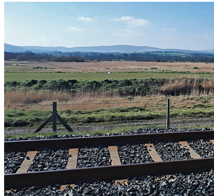
A section of the railway line between Greystones and Wicklow Town. Irish Rail has commissioned a Coastal Protection Study of the area along the railway line.