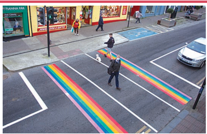
Pictured is the new Pride Rainbow Crossing on Arklow Main Street, unveiled recently by Arklow Municipal District Council. It's the first rainbow crossing to be installed in Co. Wicklow.