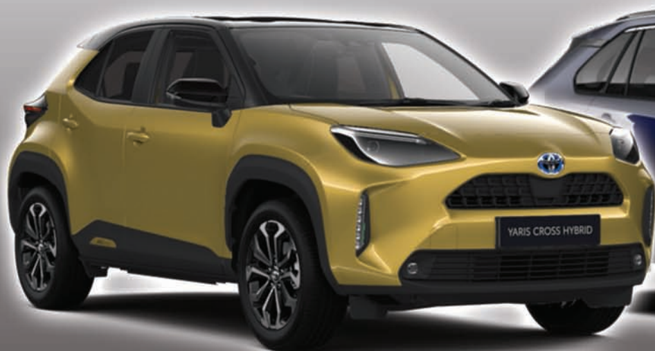
YARIS CROSS SUV