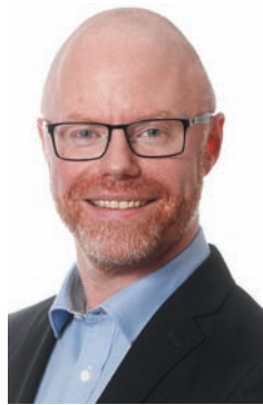
Minister Stephen Donnelly

Minister for Health Stephen Donnelly said "I