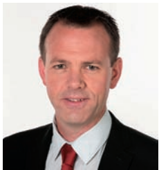
John Brady TD

"The challenges faced by businesses, workers, and their families in Wicklow throughout 2021 have been compounded by rising inflation. Energy costs, rents, and even an ordinary food shop have become much more