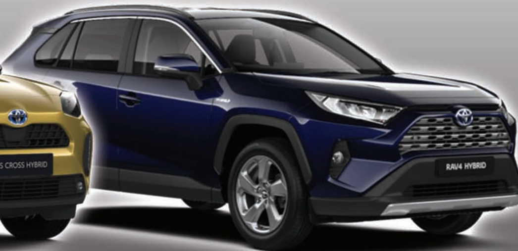
RAV 4 PLUG IN