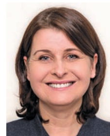
Jennifer Whitmore TD

potential it brings. I know that 2021 was Continued on page 3