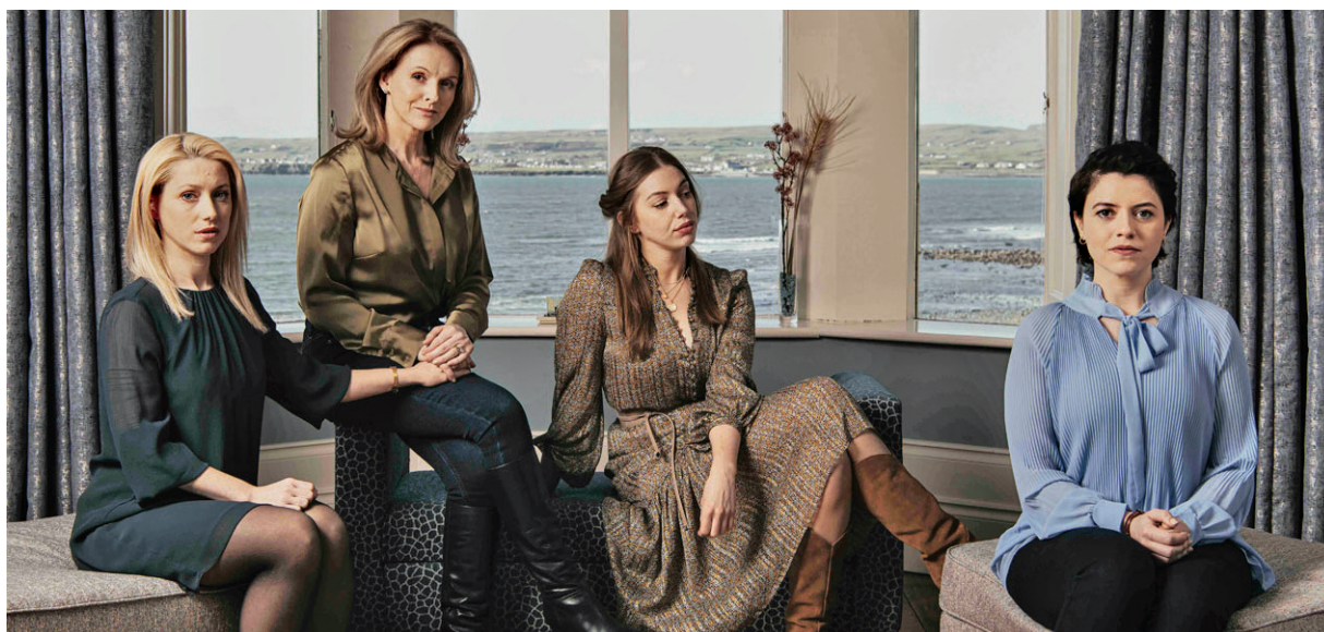
The cast of Smother