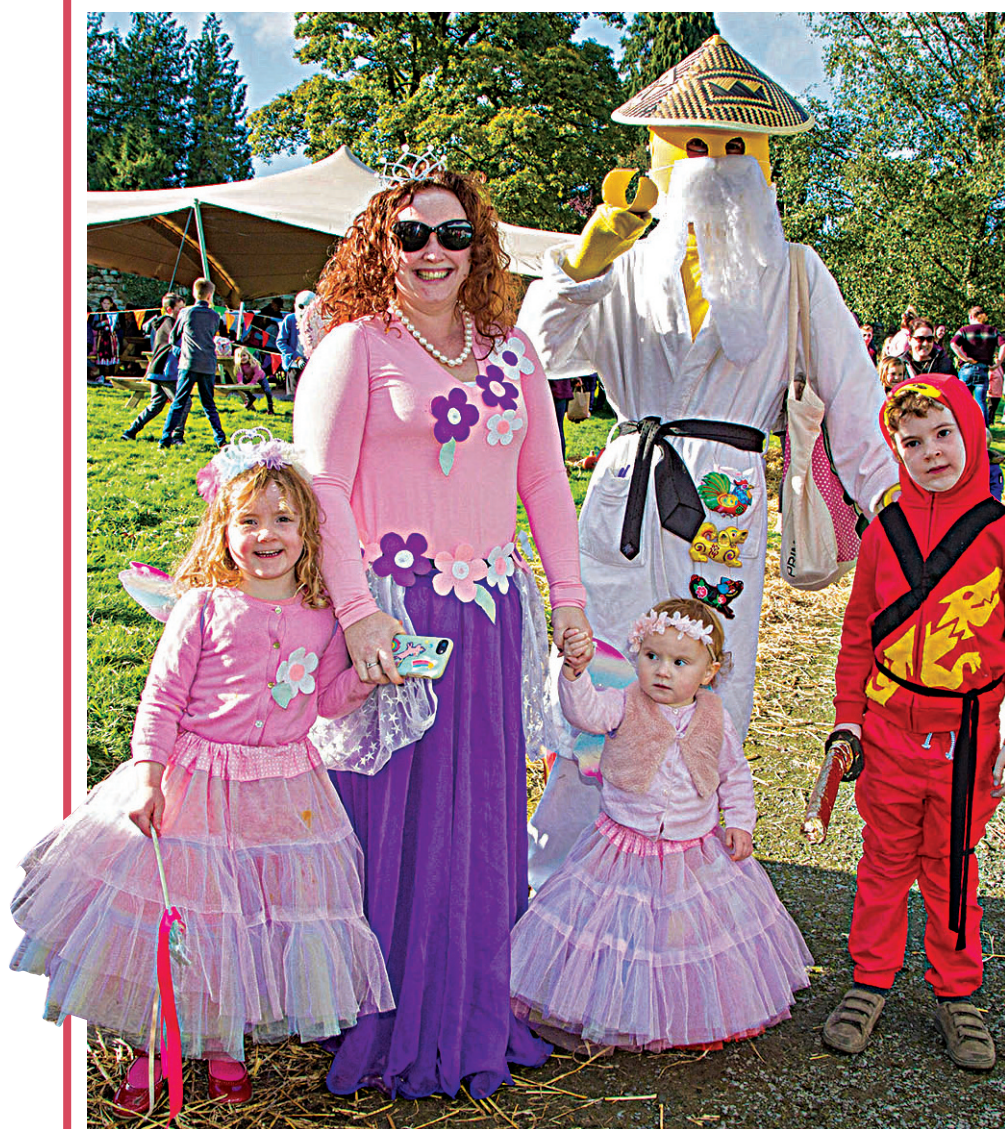
The Dunne family all dressed up at the Rathdrum Halloween Playfest