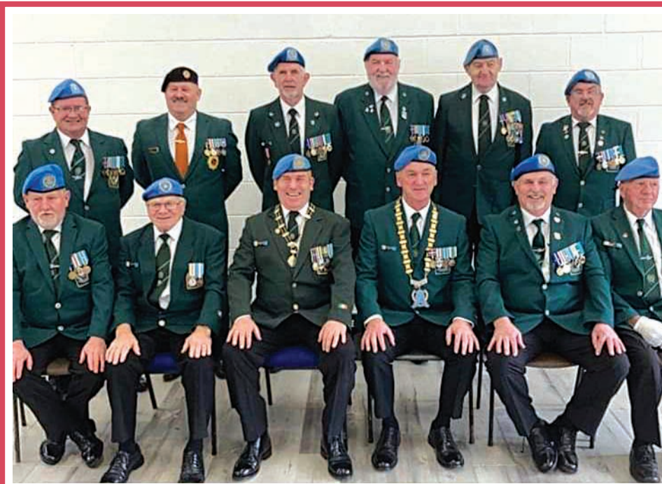
Local North Wicklow UN Veterans, Post 21, are pictured at the recent Service for Deceased Members.

"I am delighted to see the Connecting Ireland Plan published today for public consultation. We need the input and voices of rural Ireland at the heart of this plan in order to get it right. The plan will also address improved mobility options for those in remote areas and I welcome the fact that the consultation process includes engagement with the disability community living in rural Ireland."