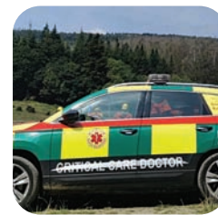
FUNDING EMERGENCY Page 7