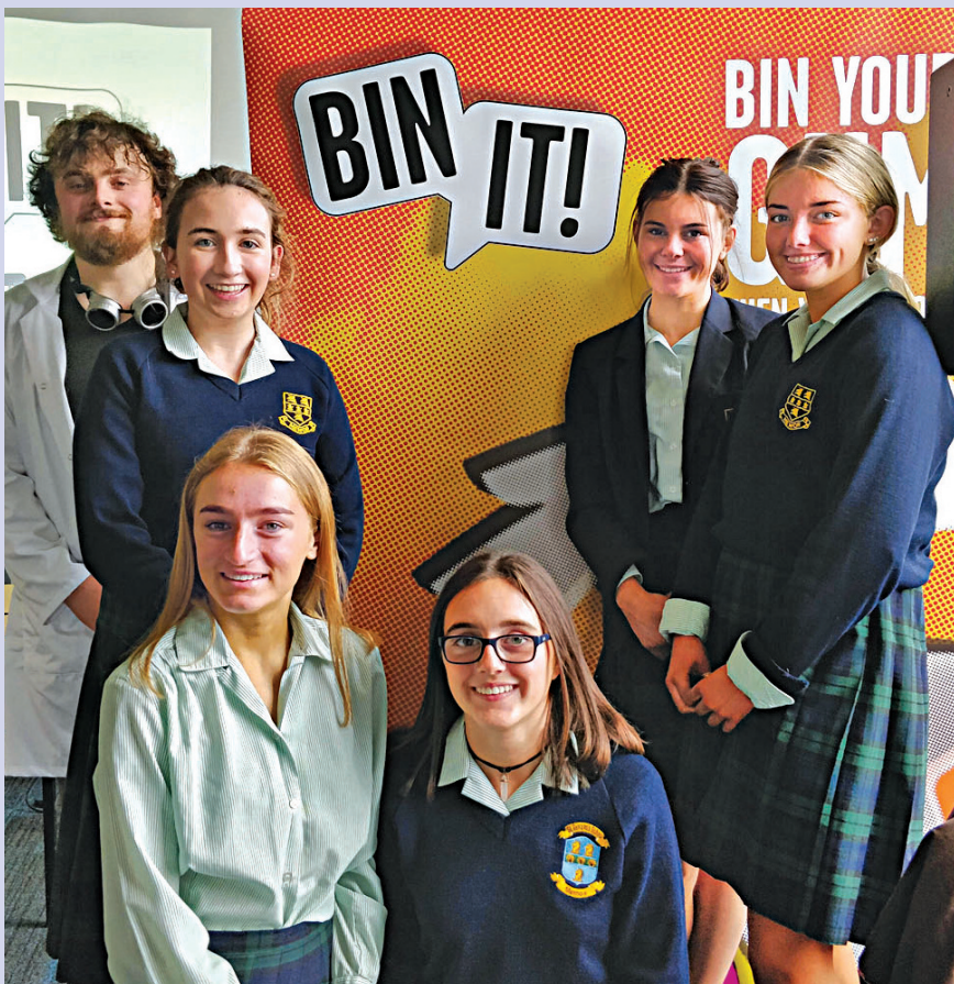
Pre-pandemic: A Bin it! school tour visit to St Gerard's school in Bray in 2019.

The GLT education campaign also includes outdoor poster, TV and online advertising which ran from June until August this year and an accompanying website www.gumlittertaskforce.ie . Since the campaign began back in 2007, the proportion of gum as a percentage of litter has decreased by 64% as more and more people regard chewing gum as litter.