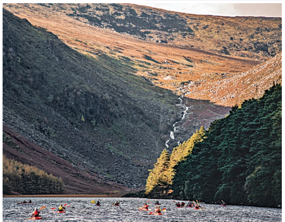
Quest Glendalough at its finest for kayakers