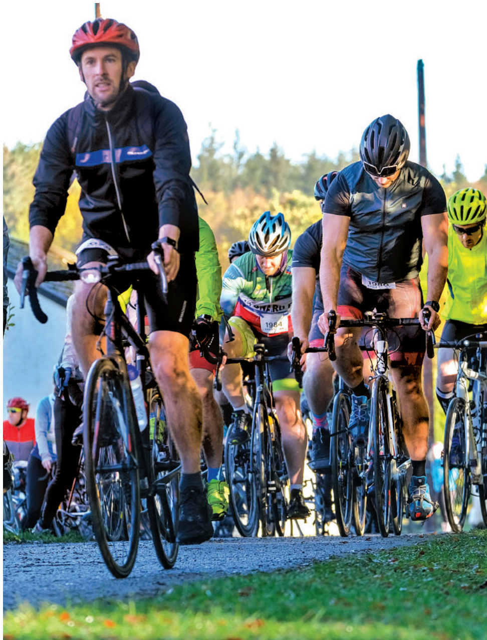
Racers on their bikes for the start of the Quest Glendalough event.