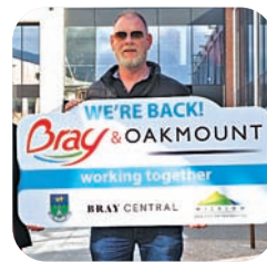
BRAY CENTRAL Page 4