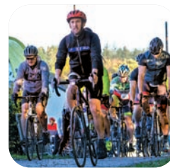
QUEST Page 14