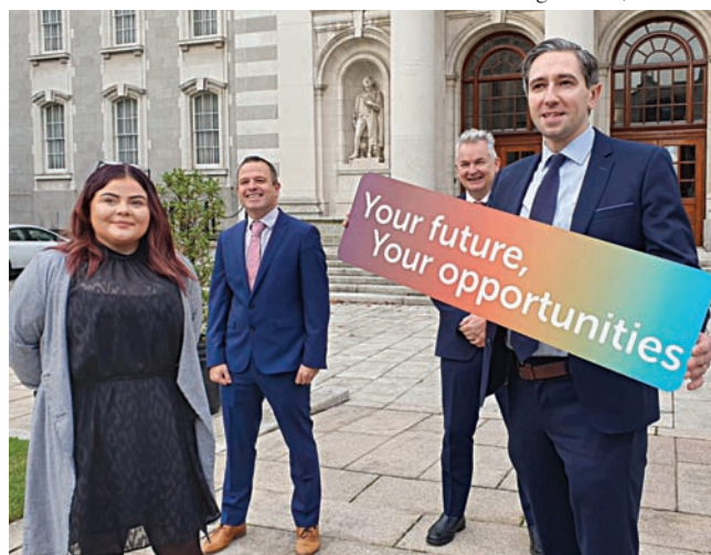
Minister Harris launching the enhanced CAO website

"We have so many industries offering diverse and interesting careers and there are so many ways to get there. If full time education isn't for you, then we have options that are."