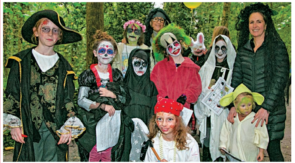
Ghosts and Ghouls enjoying the Walk in the Woods on Halloween in Newtown

Forest Bathing in Wicklow is an exciting new collaboration between a group of specialist guides in Co. Wicklow who each bring their own unique vision and skill set to their work. This pilot eco-tourism training programme initiative was developed by Co. Wicklow Partnership, Ecowellness Consulting and funded under the LEADER Rural Development Fund 2014-2020.