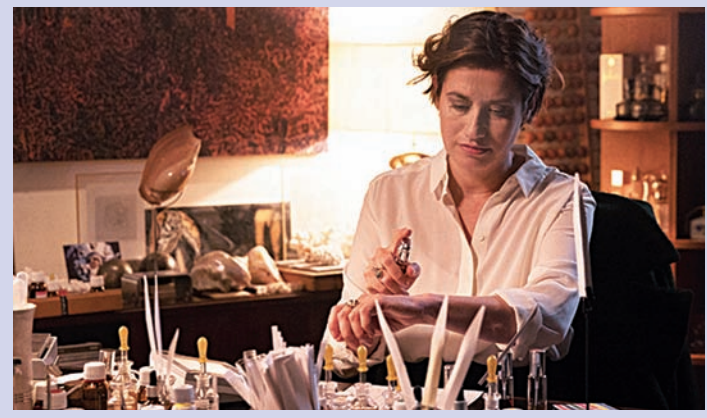
Perfumes (Cert: Club)

10.30am each morning - Tickets €100 for 6 classes or €20 each