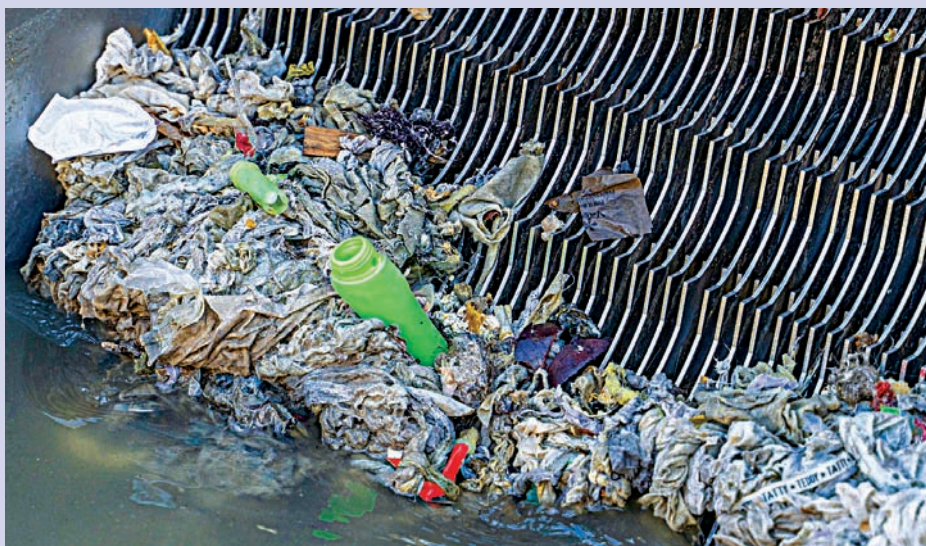
Wipes and sanitary products being removed by large screens at Irish Water Wastewater treatment plant

Elaine from Clean Coasts added: "We know that by educating children on environmentally responsible behaviour, it sets them up to become environmentally responsible adults and possible future change makers. Making small changes in our homes, only flushing the 3 P's; Pee, Poo and Paper down the toilet and simply putting a bin in your bathroom can have a significant positive impact on our local waterways, beaches and rocky shorelines." Join the campaign at www.thinkbeforeyouflush.org and follow @CleanCoasts on social media.