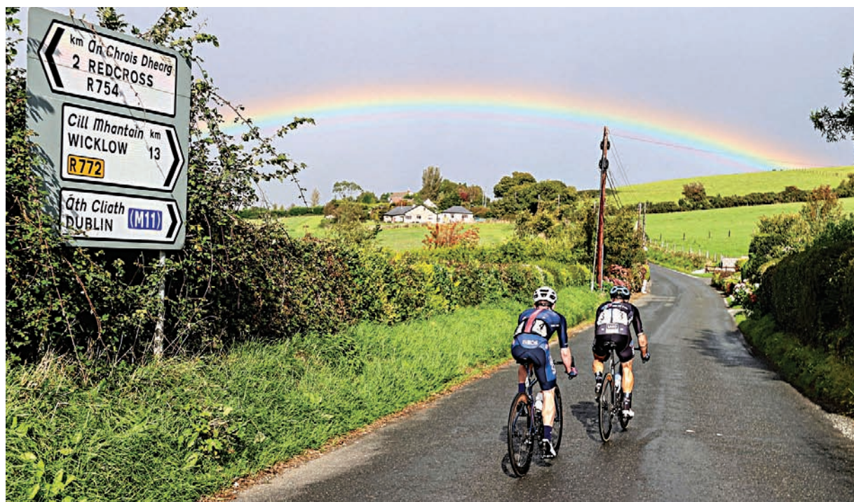
Nicholas Roche of Team DSM leads from Eddie Dunbar of Team Ineos in the Senior Men's Race.