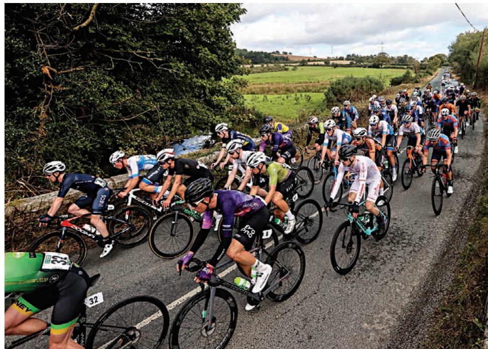
The Men's Senior Race.

"I'm really looking forward to it, yeah, it's going to be a huge opportunity