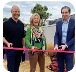
SENSORY GARDEN Page 13

DELIVERED TO HOMES & BUSINESSES IN: SHANKILL, ENNISKERRY, BRAY, GREYSTONES, DELGANY, KILCOOLE, NEWCASTLE, KILQUADE, ASHFORD, KILPEDDER, NEWTOWNMOUNTKENNEDY, KILMACANOGUE, LARAGH, MONEYSTOWN, ROUNDWOOD, RATHNEW, WICKLOW, GLENEALY, BRITTAS BAY, AVOCA, WOODENBRIDGE, ARKLOW, SHILLELAGH, TINAHELY, REDCROSS, BALLINACLASH, AUGHIRM, RATHDRUM, DONARD, DUNLAVIN, CARNEW, COOLATTIN, BALTINGLASS, BLESSINGTON.