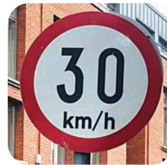
30KM ZONES Page 4