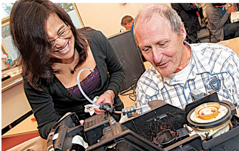
A 'Repair Café', a meeting spot equipped with tools, materials, and volunteers to repair clothes, furniture, and other household items