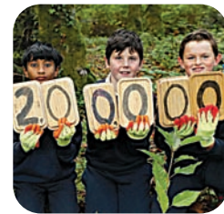
EASY TREESIE Page 8