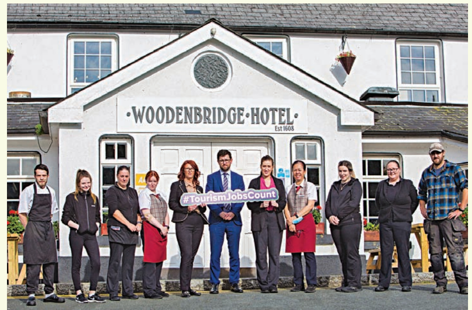
Management and staff members of the Woodenbridge Hotel, supporting the Irish Hotels Federation campaign

"I would like to thank and pay tribute to everyone in Greystones Tidy Towns and the Triple-A Alliance for their work on this project over several years and Greystones Municipal District Council's support to make the Sensory Garden a reality."