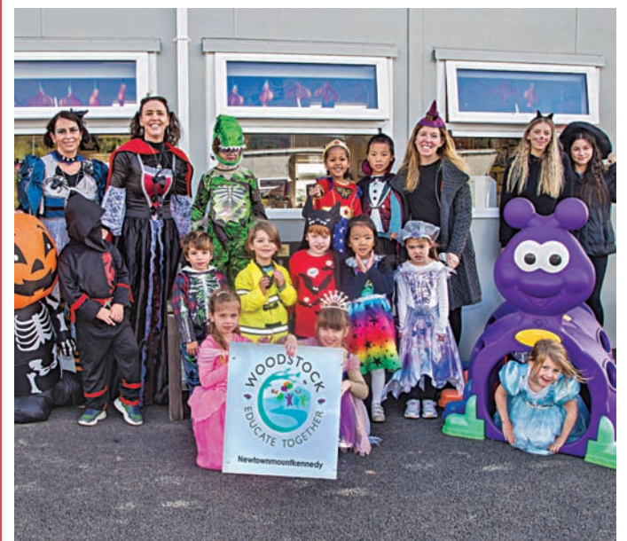
Junior Infants enjoying their Halloween Dress Up Day at Woodstock Educate Together in Newtown.

Waterways Ireland is hosting a questions and answers webinar on the draft Climate Action Plan at 7pm on Thursday, 11th November 2021. Registration details can also be found on the website or attendance can be reserved by email to climate.action@waterwaysireland.org