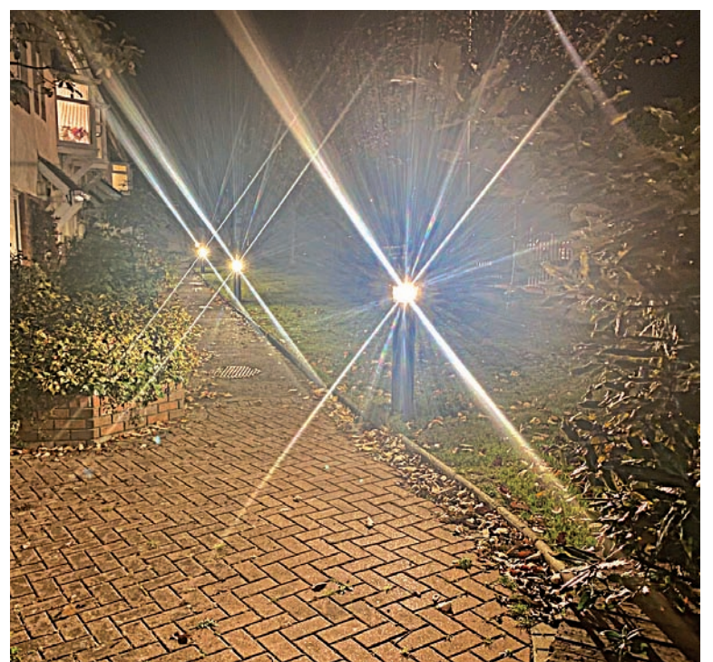
The repaired lights in Failte Park in Bray

"I want to commend the residents for their perseverance on the issue and to the council for getting the work done."