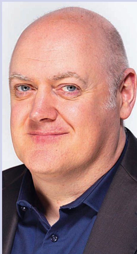
Dara Ó Briain