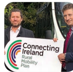
CONNECTING IRELAND Page 5