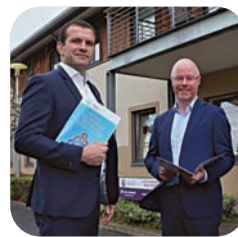
HOME INSTEAD Page 8