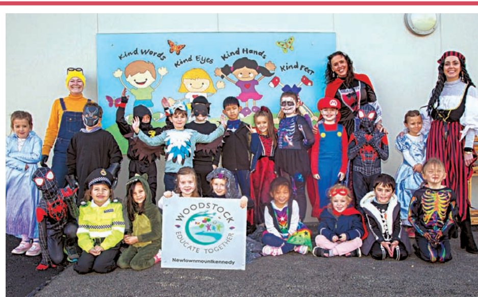
Senior Infants and 1st Class pupils from Woodstock Educate Together school in Newtownmountkennedy enjoying their recent Halloween fancy dress day.

Tel: 286 5057 Fax: 201 4335 www.acmeblinds.com email: bray@acmeblinds.com