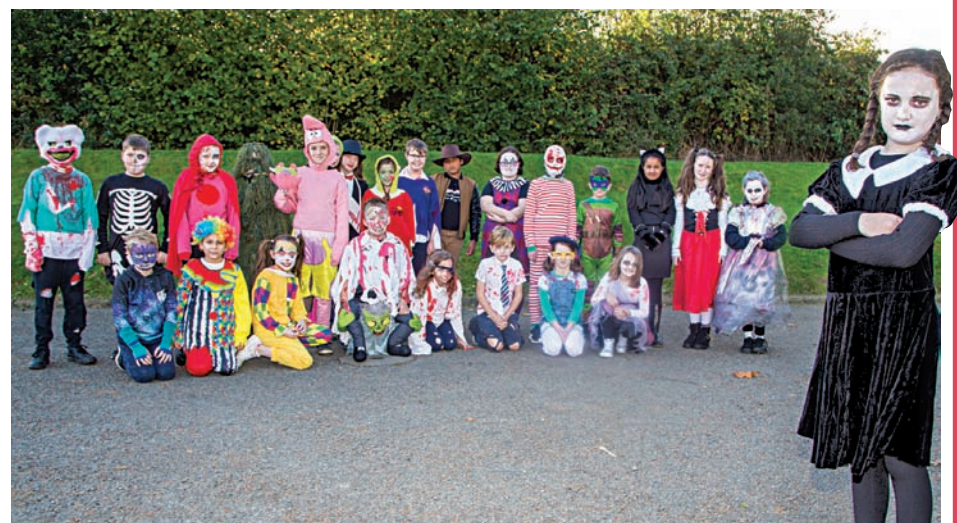
6th class pupils at Newtown National School enjoying their recent dress up day

"We want to see more people working and staying in the sector, more people volunteering and engaging at a community level, more people knowing what services are out there should they need them, and more people feeling part of something positive and bigger than themselves."