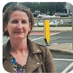
SPEED LIMITS Page 4