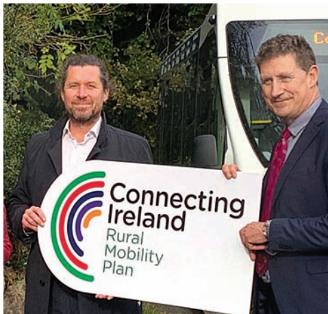
Deputy Matthews with Minister Ryan at the Brockagh Resource Centre last Friday

"I frequently have conversations with people from South and West Wicklow in particular that don't want to use their cars as much as they do and would welcome the opportunity to access frequent and reliable bus option but in many areas this does not exist. The Connecting Ireland plan being launched by Minister Ryan is about putting in place the bus infrastructure in areas that have been highlighted as