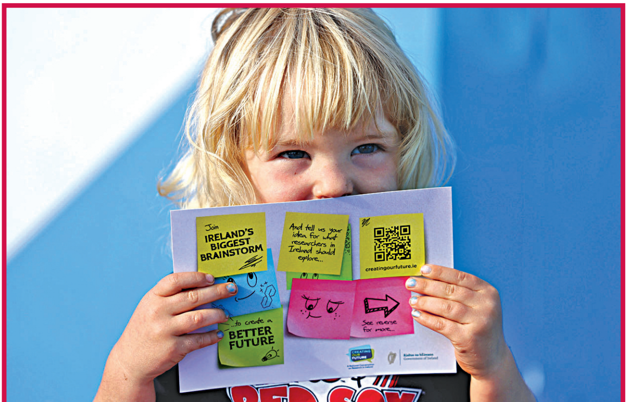
Charlie Taggart from Greystones was at the launch of the Creating Our Future Roadshow at Greystones Harbour last week. See more on page 5.

They added, "Over the past few years many