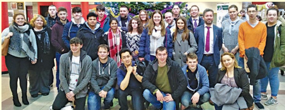
BIFE staff and students visiting IT Tallaght. (BIFE have a formal 'Access to Higher Education' agreement with IT Tallaght and a number of other IT's).

Likewise, BIFE is the leader in providing courses in the Sciences, Pharmaceuticals, Food sciences, Health Care, Performing Arts, Information Technology and Business.