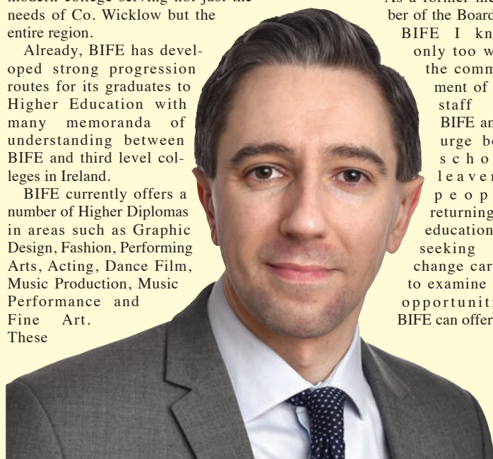
Simon Harris, Minister for Further and Higher Education

As a former member of the Board of BIFE I know only too well the commitment of the staff at BIFE and I urge both school leavers, people returning to education or seeking to change career to examine the opportunities BIFE can offer.