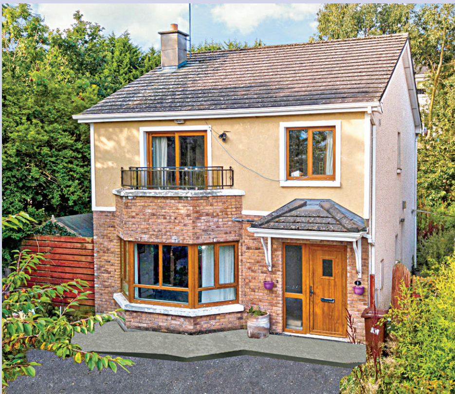
1, The Woods, Rathdrum, will be auctioned on 29th September with a guide price of €275,000