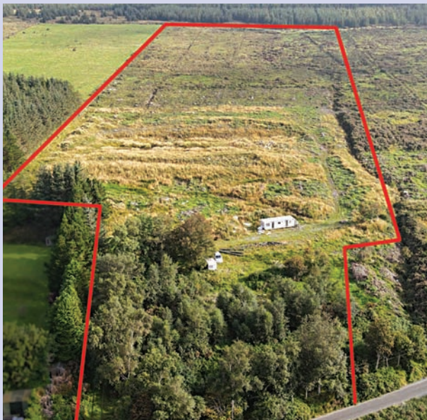
Lands at Gap Road, Blessington (guide price €145,000) will be auctioned on 30th September

The Irish firm, which specialises in online property transactions, pioneered the first online auctions in Ireland in 2015 and has since brought the model further afield, offering property investments in Spain, South Africa, Cyprus and the UK on the platform.