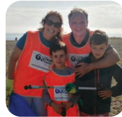
BEACH CLEAN Page 2