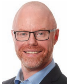
Minister Stephen Donnelly

"And all restrictions on outdoor group activities have been removed.