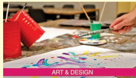
ART & DESIGN