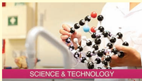
SCIENCE & TECHNOLOGY