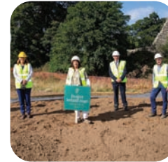
TULLY PARK Page 4