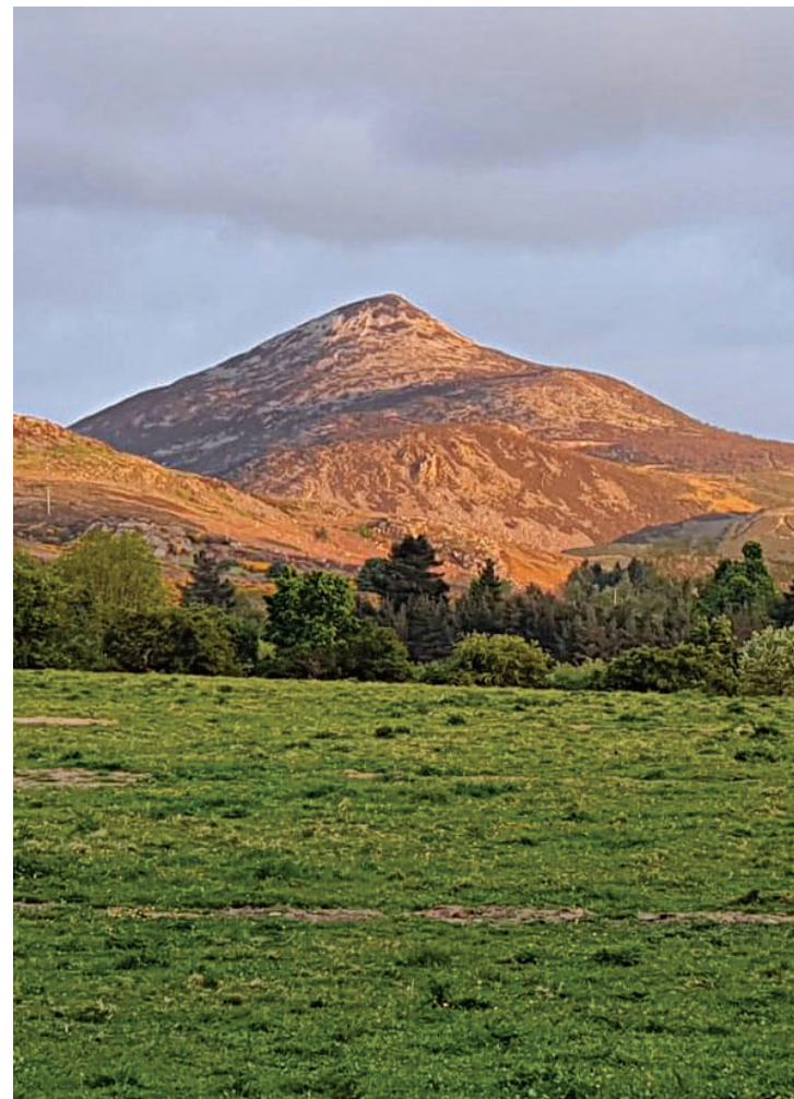
ABP have approved the building of 165 dwellings on the Cookstown Road in Enniskerry