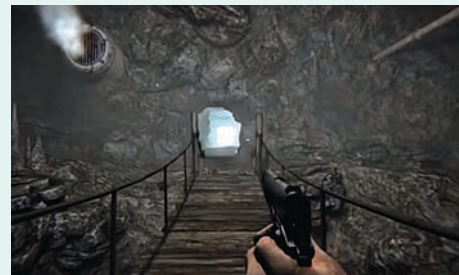
Screenshot from "The One We Found"