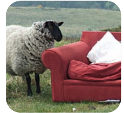
PURE FUNDING Page 6

DELIVERED TO HOMES & BUSINESSES IN: SHANKILL, ENNISKERRY, BRAY, GREYSTONES, DELGANY, KILCOOLE, NEWCASTLE, KILQUADE, ASHFORD, KILPEDDER, NEWTOWNMOUNTKENNEDY, KILMACANOGUE, LARAGH, MONEYSTOWN, ROUNDWOOD, RATHNEW, WICKLOW, GLENEALY, BRITTAS BAY, AVOCA, WOODENBRIDGE, ARKLOW, SHILLELAGH, TINAHELY, REDCROSS, BALLINACLASH, AUGHIRM, RATHDRUM, DONARD, DUNLAVIN, CARNEW, COOLATTIN, BALTINGLASS, BLESSINGTON.