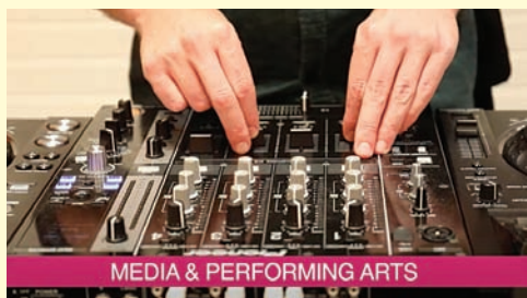
MEDIA & PERFORMING ARTS