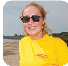
LIFEGUARDS RETURN Page 2