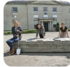
AVONDALE Page 4