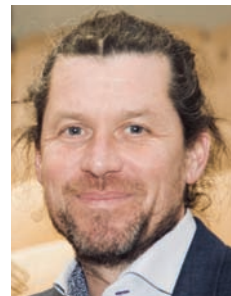
Steven Matthews TD

"We should always be striving to ensure everyone is included in how we design and maintain our streets and shared spaces especially for our younger and older residents and visitors. Good design that is welcoming for all and improves enjoyment of our main shopping streets is good for the local economy too. If you enjoy the space and feel comfortable there, it's likely you