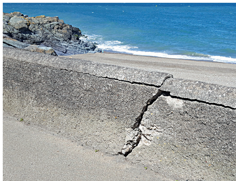
The road and retaining wall above Cove Beach in Greystones has been subsiding for some time due to rougher waves and rain, and cracks have deepened in the wall.

Details on applying for Night Nurse positions can be found on www.cancer.ie/jobs or by emailing recruitment@irishcancer.ie .