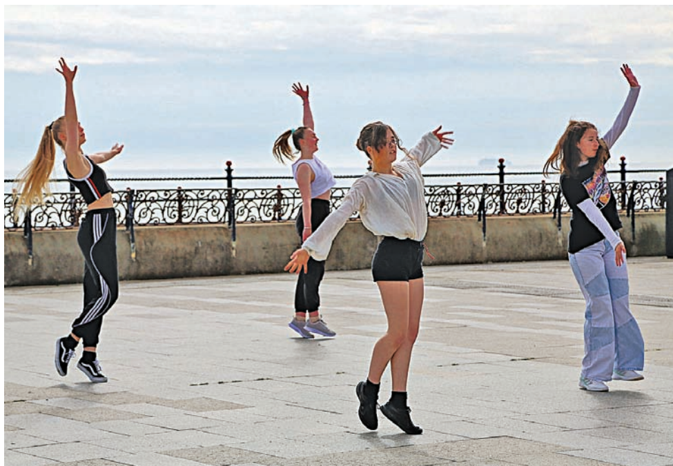
Dance Slam! - a collaborative dance video presentation set among Wicklow landscapes

Rentokil employs a number of different safe and eco-friendly methods to protect premises from pest birds, including bird spikes and bird netting. Experts can also employ hawking, using specially trained birds of prey to scare and deter gulls and other pest birds from an area without harm.