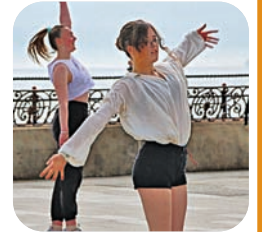
GET CREATIVE Page 9

DELIVERED TO HOMES & BUSINESSES IN: SHANKILL, ENNISKERRY, BRAY, GREYSTONES, DELGANY, KILCOOLE, NEWCASTLE, KILQUADE, ASHFORD, KILPEDDER, NEWTOWNMOUNTKENNEDY, KILMACANOGUE, LARAGH, MONEYSTOWN, ROUNDWOOD, RATHNEW, WICKLOW, GLENEALY, BRITTAS BAY, AVOCA, WOODENBRIDGE, ARKLOW, SHILLELAGH, TINAHELY, REDCROSS, BALLINACLASH, AUGHIRM, RATHDRUM, DONARD, DUNLAVIN, CARNEW, COOLATTIN, BALTINGLASS, BLESSINGTON.