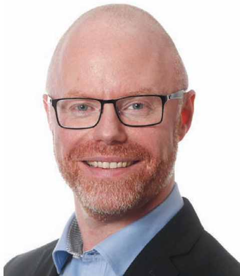
Minister for Health Stephen Donnelly

"And in another sign of real progress the number of Covid cases amongst the over 65s has dropped by two thirds-doctors say it will fall