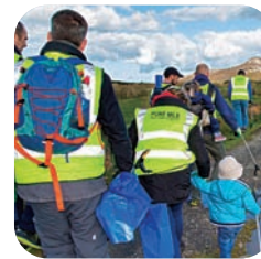
PURE MILE page 12

DELIVERED TO HOMES & BUSINESSES IN: SHANKILL, ENNISKERRY, BRAY, GREYSTONES, DELGANY, KILCOOLE, NEWCASTLE, KILQUADE, ASHFORD, KILPEDDER, NEWTOWNMOUNTKENNEDY, KILMACANOGUE, LARAGH, MONEYSTOWN, ROUNDWOOD, RATHNEW, WICKLOW, GLENEALY, BRITTAS BAY, AVOCA, WOODENBRIDGE, ARKLOW, SHILLELAGH, TINAHELY, REDCROSS, BALLINACLASH, AUGHIRM, RATHDRUM, DONARD, DUNLAVIN, CARNEW, COOLATTIN, BALTINGLASS, BLESSINGTON.