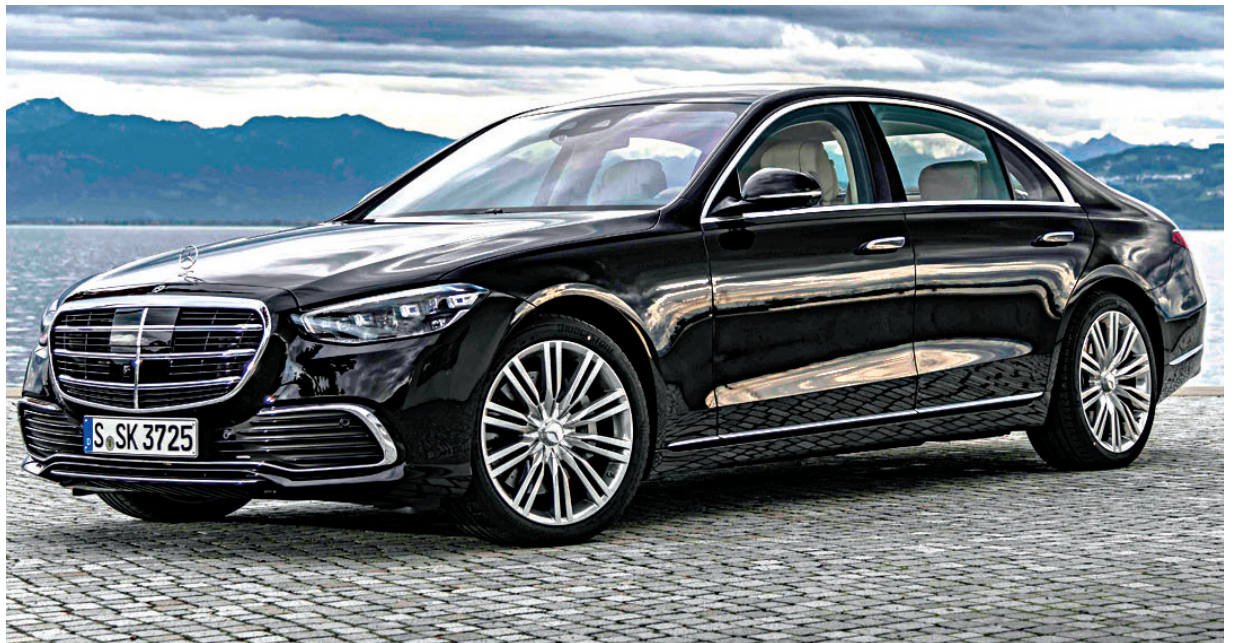
The new Mercedes-Benz S-Class

The new generation S-Class has now just arrived in Ireland in stan-