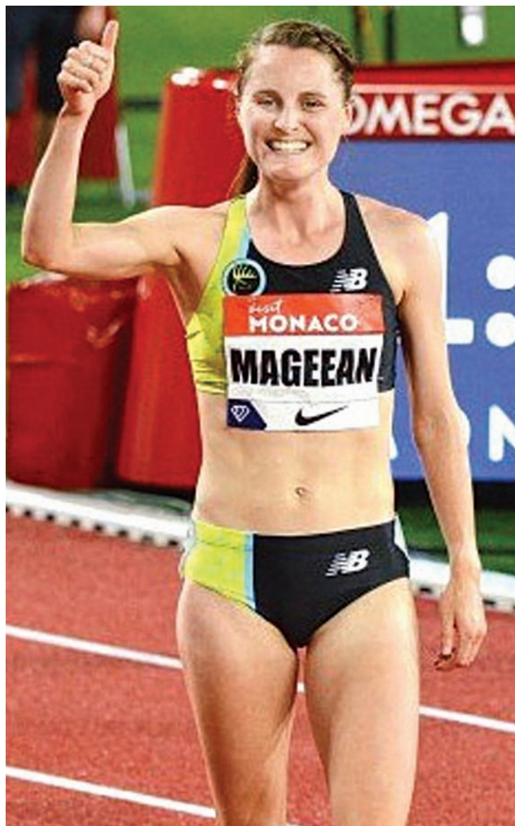
Irish Olympian and GOAL Ambassador Ciara Mageean

"As Minister of State with responsibility for housing for older people and people with a disability, I am fully committed to assisting individuals to stay in their own homes and within their own communities for as long as possible and these allocations today will facilitate this goal for many," he concluded.