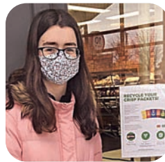
RECYCLING INITIATIVE page 2