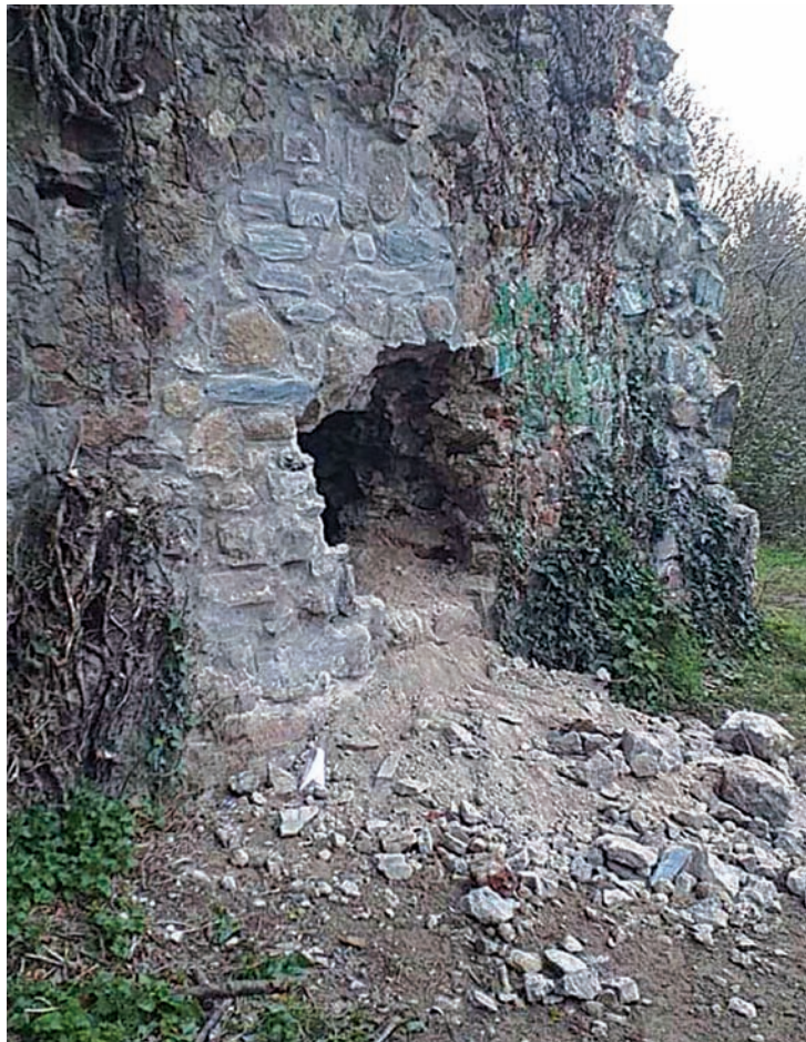
Oldcourt Castle in Bray