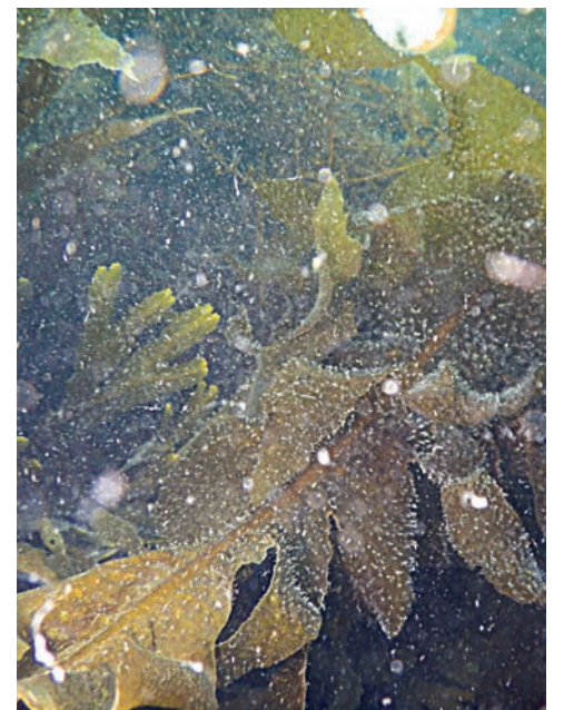
Undaria pinnatifida , aka Japanese Kelp

Rory O'Callaghan, Seasearch Ireland said, "International experience with wakame would indicate it is much more likely to occur in marinas and on other man-made structures. From here it can attach to boats and be carried to other parts of the country when boats are moved. As divers, we are particular conscious of the need for good biosecurity practices such as cleaning or drying out their boat