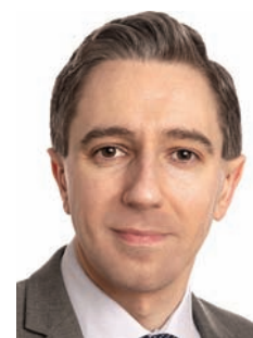
Minister Simon Harris

Potential contractors will be invited to complete the SAQ with a view