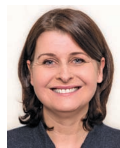
Jennifer Whitmore TD

Deputy Whitmore added "Raising this in the Dáil, I asked the Minister for Heritage to implement a comprehensive management plan to provide the framework for the management of these special areas of conversation and national parks which places biodiversity and conservation at its core. These management plans will also need to address agricultural use of the land and facilitate the State to work closely with farmers to encourage more sustainable use of the land. Farmers are excellent at putting their