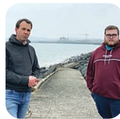
ARKLOW COASTAL PROTECTION page 8