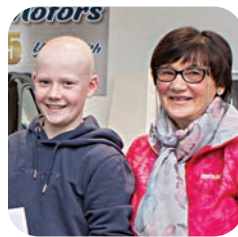
HYUNDAI HEROES page 4