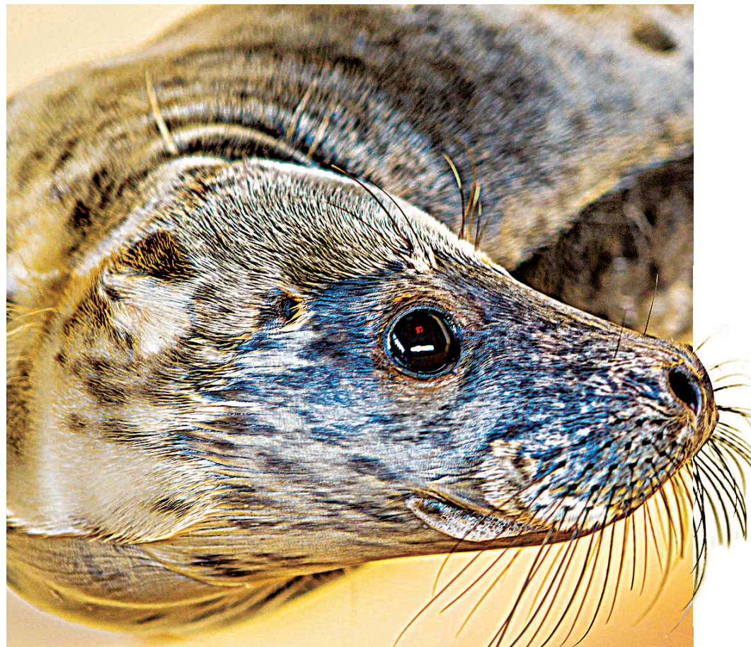
One of the many seals at the Irish Seal Rescue centre in Courtown

The educational videos and workbooks are available now on Seal Rescue Ireland's website at the following link: www.sealrescueireland.org/g/education-series/