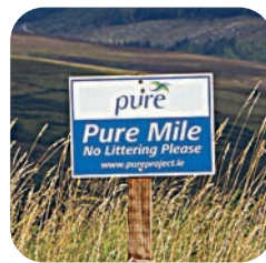
PURE MILE page 12

DELIVERED TO HOMES & BUSINESSES IN: SHANKILL, ENNISKERRY, BRAY, GREYSTONES, DELGANY, KILCOOLE, NEWCASTLE, KILQUADE, ASHFORD, KILPEDDER, NEWTOWNMOUNTKENNEDY, KILMACANOGUE, LARAGH, MONEYSTOWN, ROUNDWOOD, RATHNEW, WICKLOW, GLENEALY, BRITTAS BAY, AVOCA, WOODENBRIDGE, ARKLOW, SHILLELAGH, TINAHELY, REDCROSS, BALLINACLASH, AUGHIRM, RATHDRUM, DONARD, DUNLAVIN, CARNEW, COOLATTIN, BALTINGLASS, BLESSINGTON.