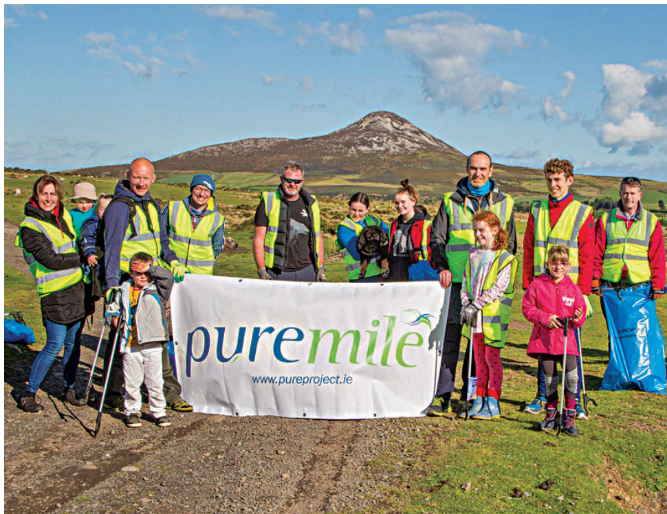
Members of the EcoTrails Pure Mile group after a cleanup.