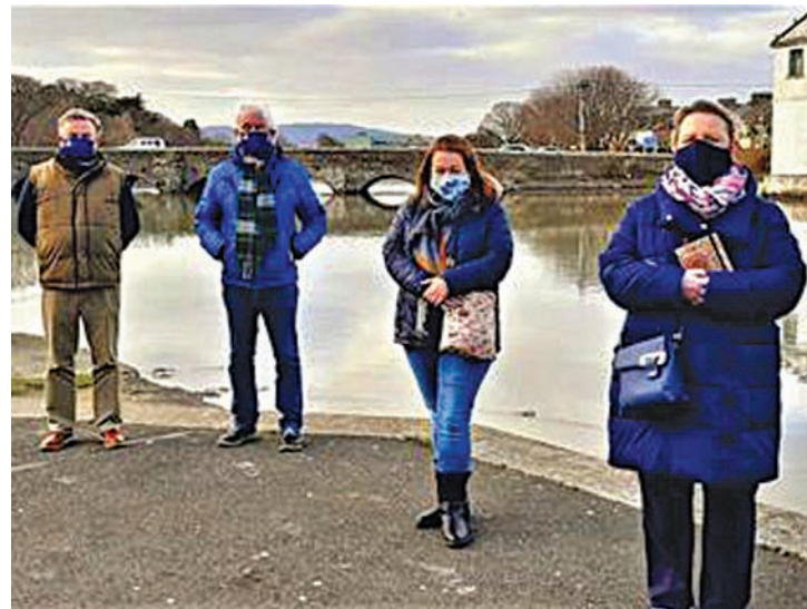
Lions Club members on Wicklow Town's South Quay

A second project in conjunction with the Tidy Towns will be announced shortly.