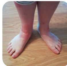
HOGWEED DANGER page 3