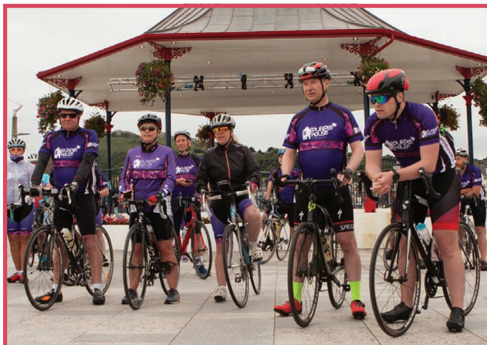
Cyclists are pictured at Bray Bandstand, the starting point of the Coast to Coast Cycle for Purple House Cancer Support.