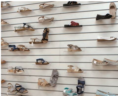
A selection of the summer sandals on offer