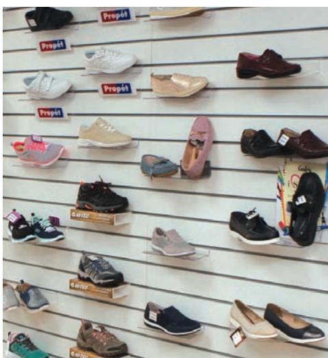
Ladies footwear at Bray Footwear