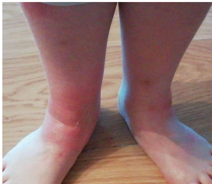
Blistering caused by Giant Hogweed