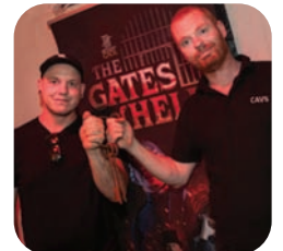
THE GATES OF HELL page 21

SOUTH EDITION DELIVERED TO HOMES & BUSINESSES IN: RATHNEW, WICKLOW, GLENEALY, BRITTAS BAY, AVOCA, WOODENBRIDGE, ARKLOW, SHILLELAGH, TINAHELY, REDCROSS, BALLINACLASH, AUGHRIM, RATHDRUM, DONARD, DUNLAVIN, CARNEW, COOLATTIN, BALTINGLASS, BLESSINGTON.