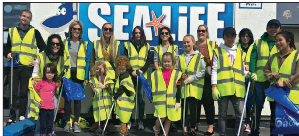
A Bray Sealife Centre clean up

tic job of keeping our town and our coastal areas clean and beautiful. I must say in the 34 years of living in Bray I have never seen it looking so clean and beautiful. This, as I say, is a group effort. The young lads who work along the promenade during the summer months do a fantastic job of keeping on top of any stray litter. Well done!"