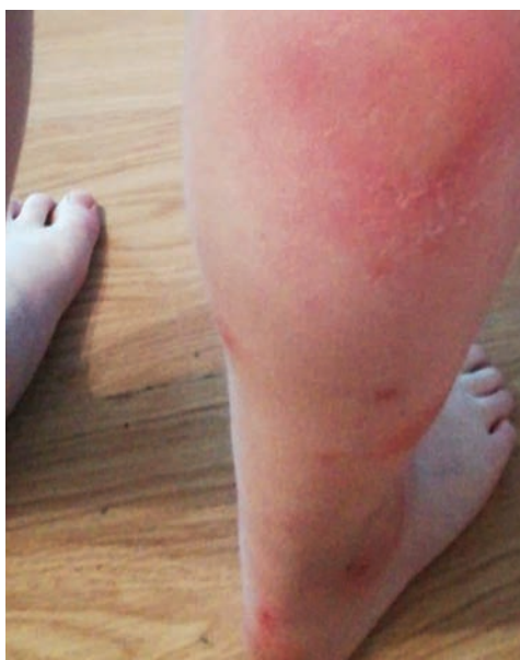
There were severe burns on the girl's legs