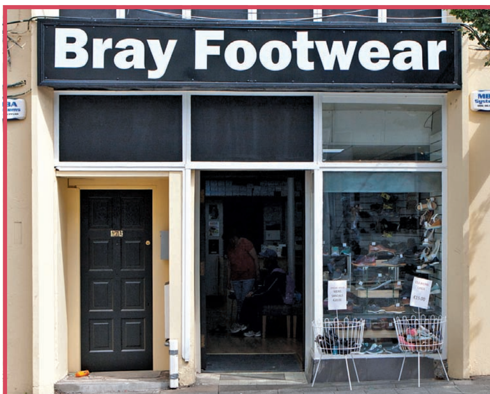
Newly opened Bray Footwear on Bray Main Street.

All our properties are listed on www.myhome.ie and www.daft.ie