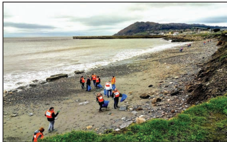
One of the many businesses out cleaning up Bray's North Beach with An Taisce and the Clean Coasts initiative