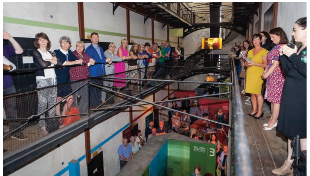
Hundreds attended the launch of the 'Gates of Hell' virtual reality experience in Wicklow Gaol.