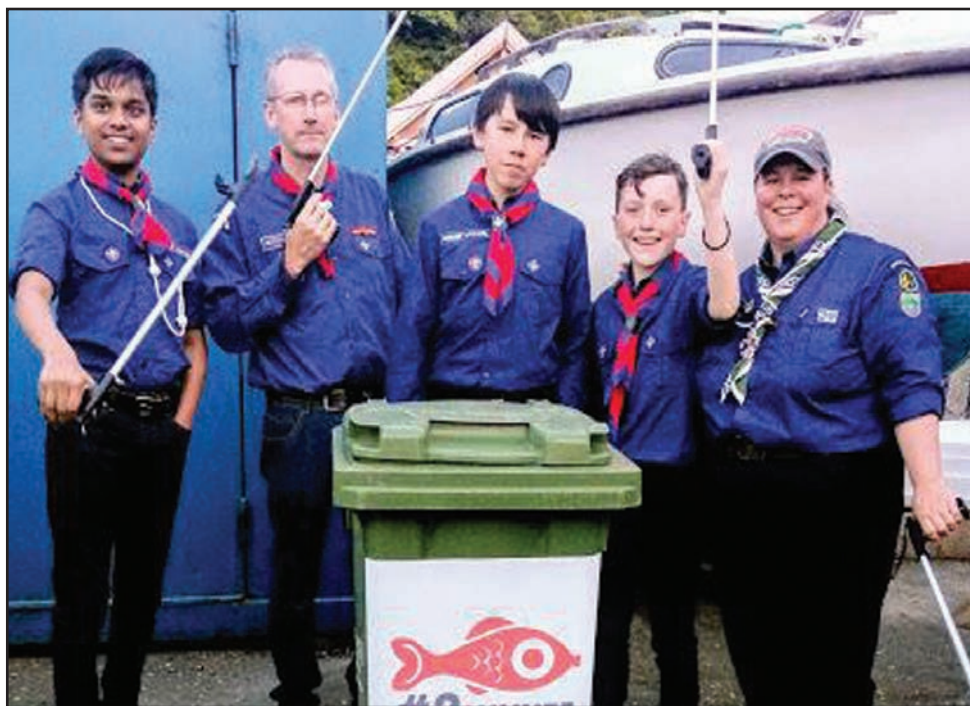
A Scouts group cleaning up Bray Harbour

"Another group that play a big role in keeping Bray clean is Bray Tidy Towns who do trojan work around the town. I am delighted that they are back up and running and they are a great bunch of people with only Bray's best interests at heart."