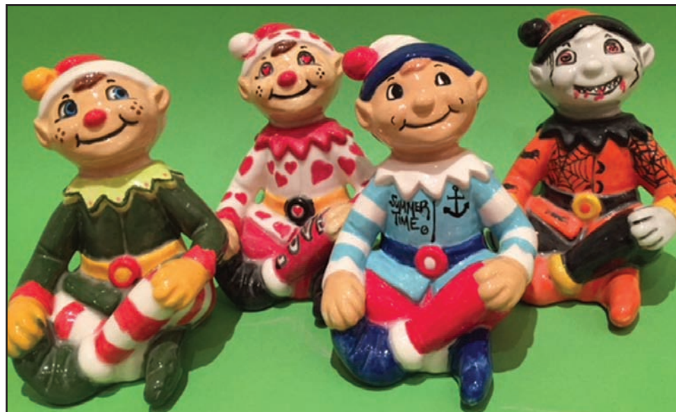
Alfie the elf in his array of outfits; Winter Spring, Summer and Autumn. Alfie is currently wearing his blue summer-time outfit