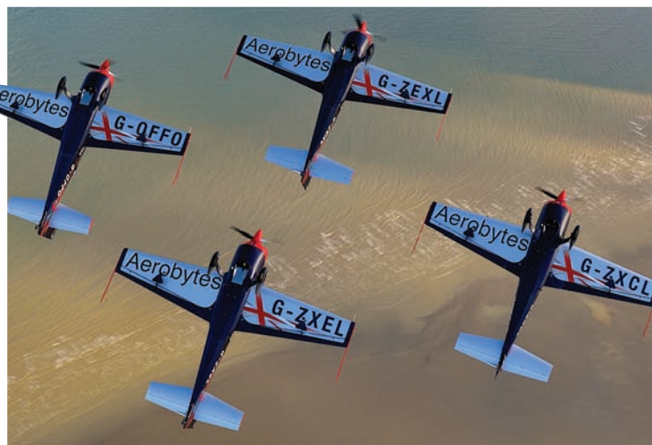
The Blades will perform at the Bray Air Display