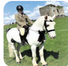
ZERO TO HERO page 4