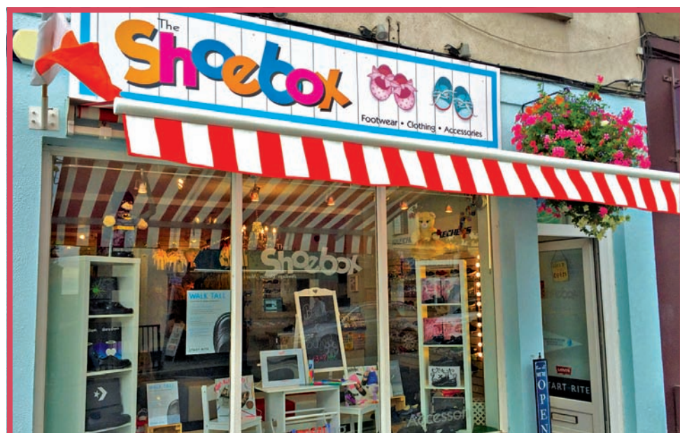
The Shoebox, Wicklow Town.

delighted by the support shown to him and his team since taking the plunge to open his own business last year. He told Wicklow Times that the