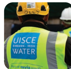
WATER WORKS page 14