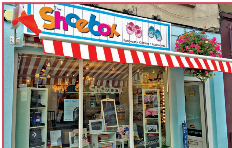
The Shoebox, Wicklow Town.

delighted by the support shown to him and his team since taking the plunge to open his own business last year. He told Wicklow Times that the