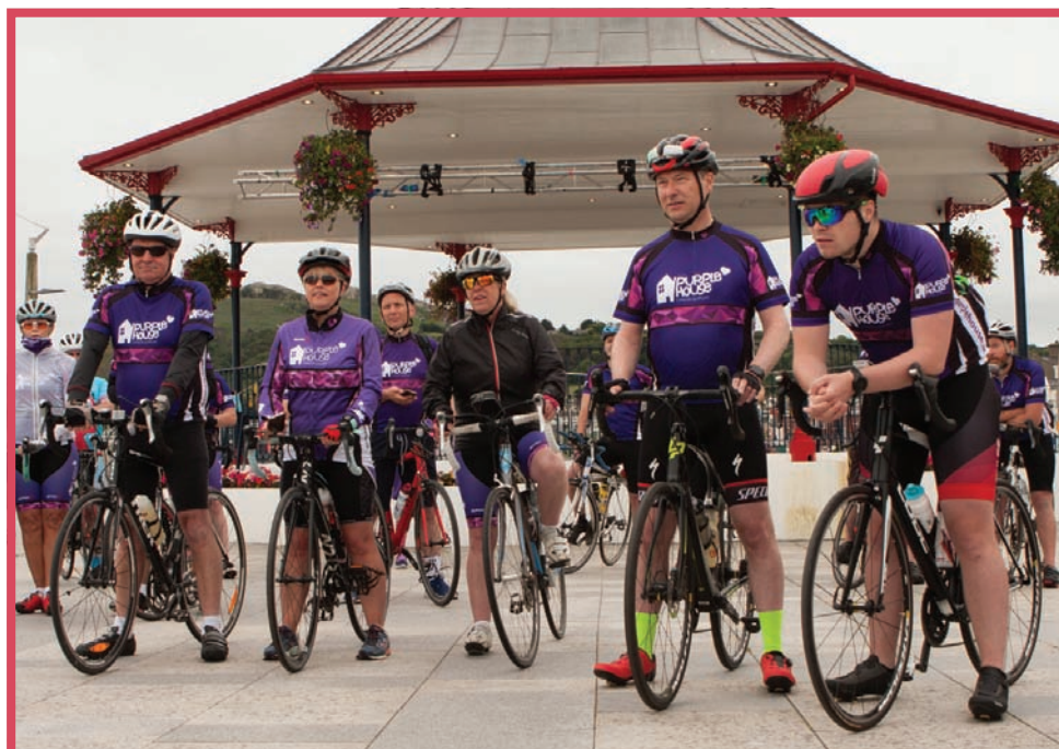
Cyclists are pictured at Bray Bandstand, the starting point of the Coast to Coast Cycle for Purple House Cancer Support.