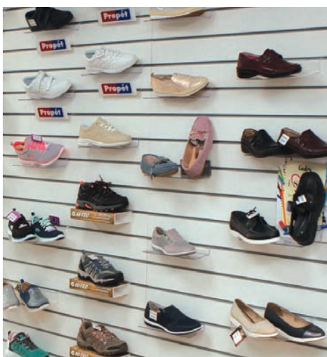
Ladies footwear at Bray Footwear