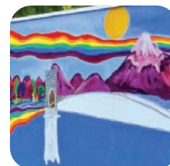
ROUNDWOOD MURAL page 18

NORTH EDITION DELIVERED TO HOMES & BUSINESSES IN: SHANKILL, ENNISKERRY, BRAY, GREYSTONES, DELGANY, KILCOOLE, NEWCASTLE, KILQUADE, ASHFORD, KILPEDDER, NEWTOWNMOUNTKENNEDY, KILMACANOGUE, LARAGH, MONEYSTOWN, ROUNDWOOD.