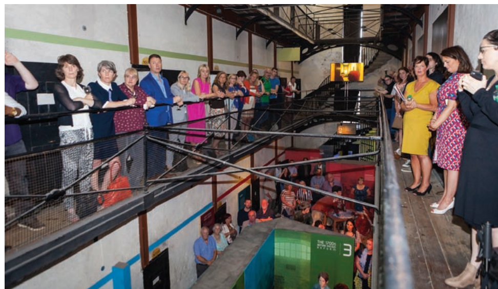
Hundreds attended the launch of the 'Gates of Hell' virtual reality experience in Wicklow Gaol.