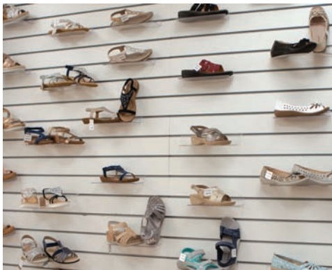
A selection of the summer sandals on offer