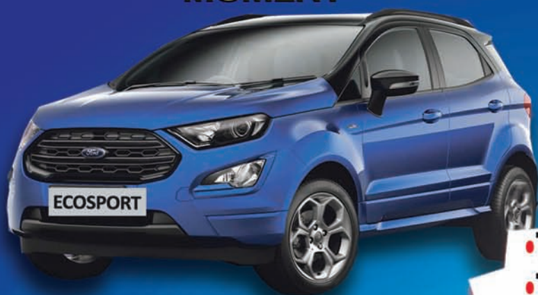
NEW FORD ECOSPORT FROM €23,525