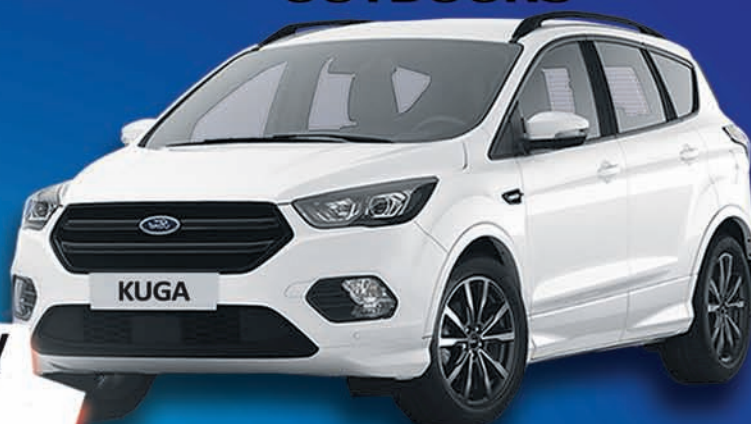
NEW FORD KUGA FROM €28,850

• 7 YEARS WARRANTY • 7 YEARS ROADSIDE ASSISTANCE • LOW RATE APR FINANCE PLUS 1 YEARS FREE ROAD TAX ON THE NEW FORD KUGA & ECOSPORT