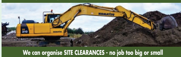
We can organise SITE CLEARANCES - no job too big or small