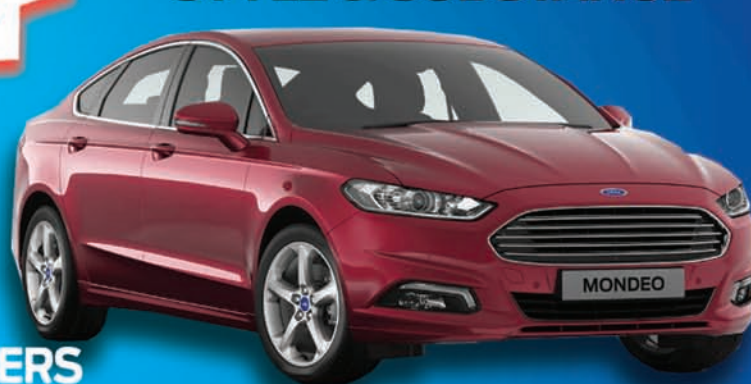
NEW FORD MONDEO TITANIUM FROM €33,330

Plus OTHER AMAZING OFFERS ACROSS THE FULL 192 RANGE!