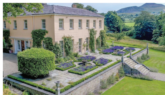
Bushy Park, Enniskerry

Bushy Park, the Enniskerry home of Chris de Burgh, has gone up for sale at a price of €12.5 million.