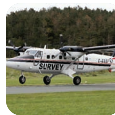
AIRBORNE SURVEY page 14