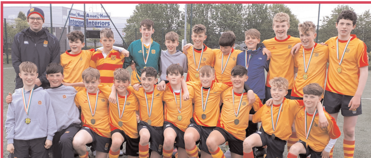
Pictured is Temple Carrig Greystones 1st year soccer team who won the school's first ever Leinster Champions League title after a 5-3 win against a very strong St Ciaran's College, Kells.