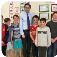
BLUE STAR PROJECT page 12