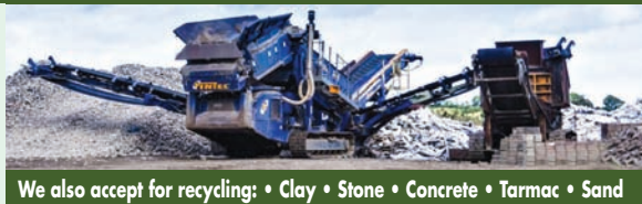
We also accept for recycling: • Clay • Stone • Concrete • Tarmac • Sand