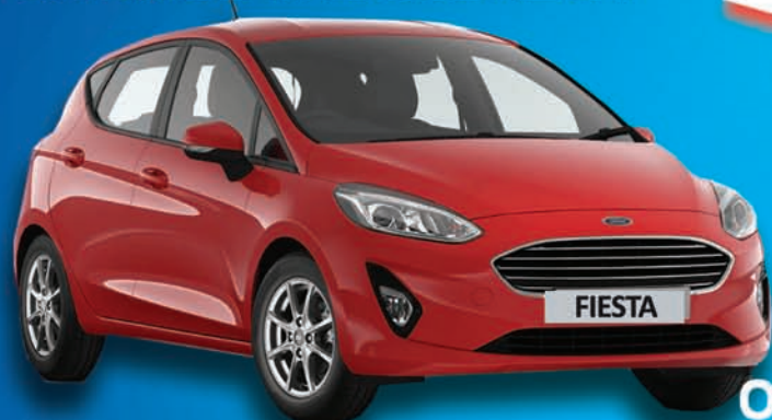
NEW FORD FIESTA TITANIUM FROM €18,212