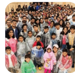
INDIANS VISIT page 18

SOUTH EDITION DELIVERED TO HOMES & BUSINESSES IN: RATHNEW, WICKLOW, GLENEALY, BRITTAS BAY, AVOCA, WOODENBRIDGE, ARKLOW, SHILLELAGH, TINAHELY, REDCROSS, BALLINACLAGH, AUGHHRIM, RATHDRUM, DONARD, DUNLAVIN, CARNEW, COOLATTIN, BALTINGLASS, BLESSINGTON.