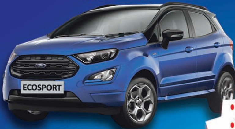
NEW FORD ECOSPORT FROM €23,525