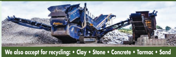
We also accept for recycling: • Clay • Stone • Concrete • Tarmac • Sand