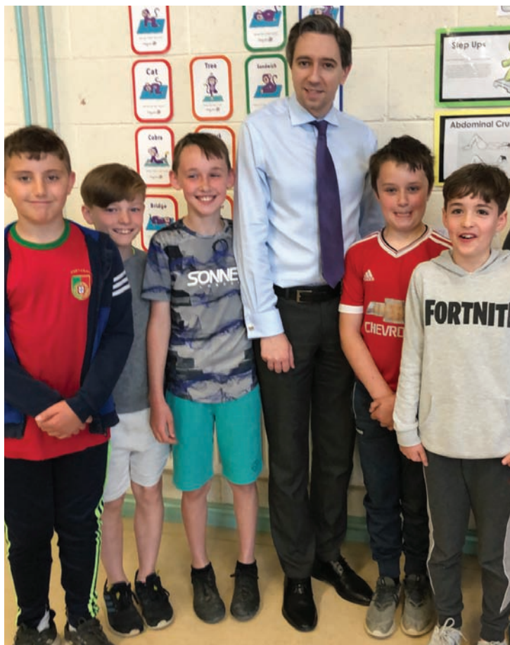
Minister Simon Harris with pupils of Carysfort National School in Arklow.

is so important we teach the next generation about the importance of the EU, how it works and how citizens can interact with it," concluded Minister Harris.