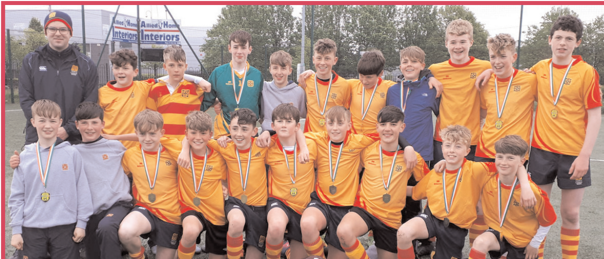
Pictured is Temple Carrig Greystones 1st year soccer team who won the school's first ever Leinster Champions League title after a 5-3 win against a very strong St Ciaran's College, Kells.