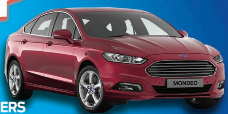
NEW FORD MONDEO TITANIUM FROM €33,330

Plus OTHER AMAZING OFFERS ACROSS THE FULL 192 RANGE!