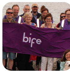
DIP IN THE SEA page 4