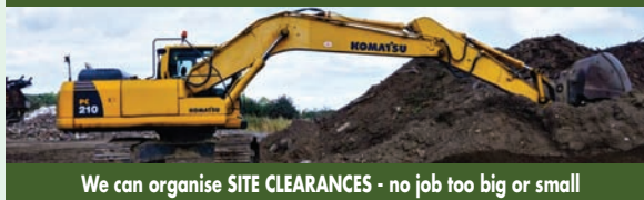
We can organise SITE CLEARANCES - no job too big or small