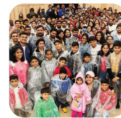
INDIANS VISIT page 18

NORTH EDITION DELIVERED TO HOMES & BUSINESSES IN: SHANKILL, ENNISKERRY, BRAY, GREYSTONES, DELGANY, KILCOOLE, NEWCASTLE, KILQUADE, ASHFORD, KILPEDDER, NEWTOWNMOUNTKENNEDY, KILMACANOGUE, LARAGH, MONEYSTOWN, ROUNDWOOD.