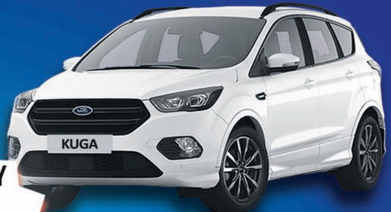
NEW FORD KUGA FROM €28,850