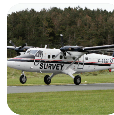
AIRBORNE SURVEY page 14