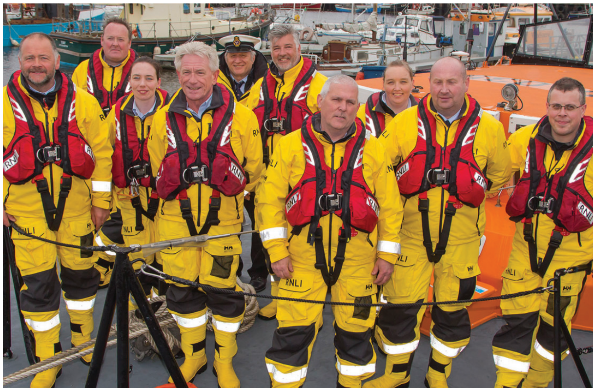
The Wicklow RNLI crew say goodbye to their beloved lifeboat Annie Blaker, the last Tyne Class lifeboat in the RNLI's fleet.