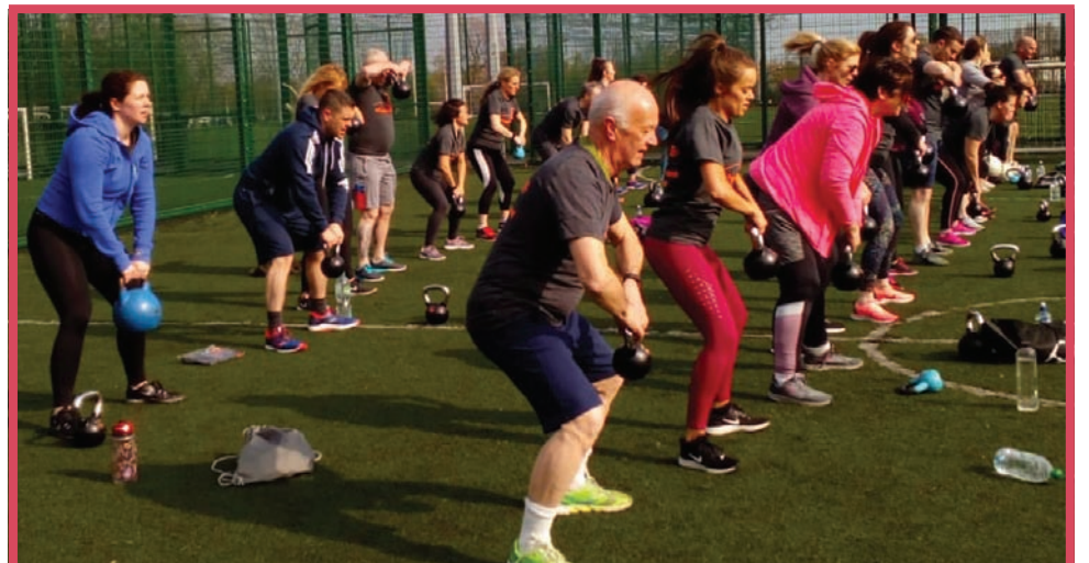
The recent 1000 Rep Kettlebell Challenge at Shoreline Leisure Centre in Bary helped to raise vital funds for the LalaLynn Foundation.