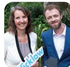
YOUNG ENTREPRENEURS page 16

SOUTH EDITION DELIVERED TO HOMES & BUSINESSES IN: RATHNEW, WICKLOW, GLENEALY, BRITTAS BAY, AVOCA, WOODENBRIDGE, ARKLOW, SHILLELAGH, TINAHELY, REDCROSS, BALLINACLASH, AUGHRIM, RATHDRUM, DONARD, DUNLAVIN, CARNEW, COOLATTIN, BALTINGLASS, BLESSINGTON.