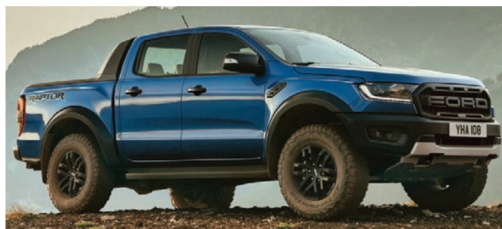
The Ford Ranger Raptor

The Ford Ranger is Europe's best-selling pick-up. Ford sold 13,600 units in the first quarter of 2019, an increase of 15 per cent compared with the same period the previous year.