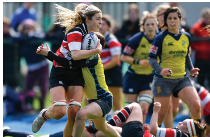
Wicklow RFC taking on Clondalkin in the Paul Flood Plate Final match, which Wicklow won 17-15.

on the Girls from Wicklow went further ahead on the score sheet with the Wicklow backs playing some fantastic rugby. Eight of the girls were playing in their last game in under age rugby and the coach's and management would like to thank the girls for the commitment to the team and wish them all the best as they move on to senior rugby next season.