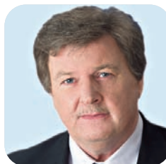
CULLEN NOT RUNNING page 11