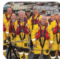
FAREWELL ANNIE page 12