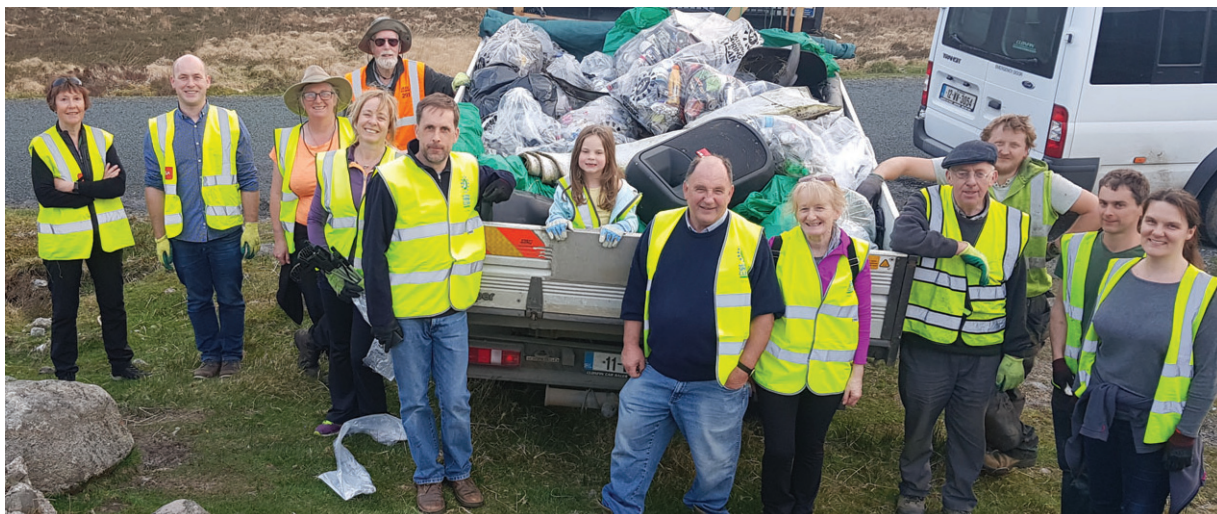
Volunteers at the recent Uplands Council litter pick in the Sally Gap.

Kelly concluded "If the council has concerns about what people are disposing in the bins, there are different types of bins that could be used. Some bins have a small opening to restrict what can be put in and these should be utilised. We will continue to work with the council to ensure that all the bins that have been removed will be replaced."