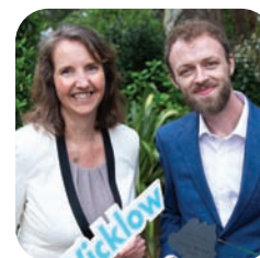
YOUNG ENTREPRENEURS page 16

NORTH EDITION DELIVERED TO HOMES & BUSINESSES IN: SHANKILL, ENNISKERRY, BRAY, GREYSTONES, DELGANY, KILCOOLE, NEWCASTLE, KILQUADE, ASHFORD, KILPEDDER, NEWTOWNMOUNTKENNEDY, KILMACANOGUE, LARAGH, MONEYSTOWN, ROUNDWOOD.