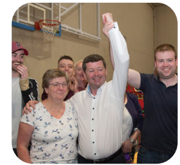
ELECTION ROUNDUP pages 10-13

SOUTH EDITION DELIVERED TO HOMES & BUSINESSES IN: RATHNEW, WICKLOW, GLENEALY, BRITTAS BAY, AVOCA, WOODENBRIDGE, ARKLOW, SHILLELAGH, TINAHELY, REDCROSS, BALLINACLASH, AUGHIRM, RATHDRUM, DONARD, DUNLAVIN, CARNEW, COOLATTIN, BALTINGLASS, BLESSINGTON.