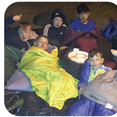
SCHOOL SLEEP OUT page 2