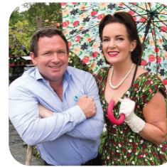
BLOOM MEDALS page 4