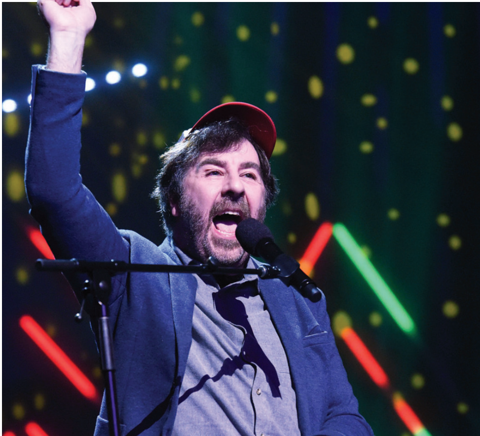
David O'Doherty will perform at the Mermaid in Bray on June 21st