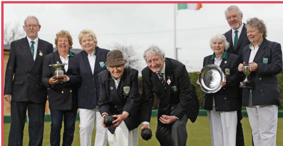
Two Wicklow organisations, the Centre for Creative Practices and Greystones Lawn Bowling Club (pictured), have beaten off stiff competition to be named amongst the thirty-six community groups, sports clubs and organisations from all over Ireland that were announced as regional winners and finalists in the National Lottery Good Causes Awards 2019. The Centre for Creative Practices will be in the Arts & Culture category while Greystones Lawn Bowling Club will be in the sports category for the awards grand final.

Speaking at the launch Minister Harris said, "It is great to see the expansion of the Rural Transport Programme in this region and in Co. Wicklow particularly. I am keenly aware that the primary objective of the Rural Transport Programme is to provide a quality nationwide community based public transport system in rural Ireland which responds to local needs and today we see an important step in that direction for Wicklow."