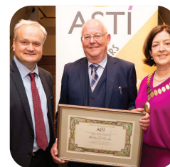
ASTI AWARDS page 6