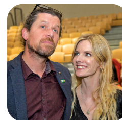
ELECTION ROUNDUP pages 10-13

NORTH EDITION DELIVERED TO HOMES & BUSINESSES IN: SHANKILL, ENNISKERRY, BRAY, GREYSTONES, DELGANY, KILCOOLE, NEWCASTLE, KILQUADE, ASHFORD, KILPEDDER, NEWTOWNMOUNTKENNEDY, KILMACANOGUE, LARAGH, MONEYSTOWN, ROUNDWOOD.