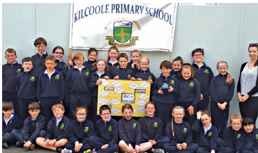
4th class pupils from Kilcoole Primary School were winners in the Irish Young Philosopher Awards