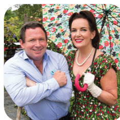
BLOOM MEDALS page 4