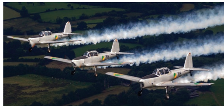
Chipmunk and Stearman aircraft from the Irish Historic Flight Foundation will bring some old world glamour to the Bray Air Display this summer.