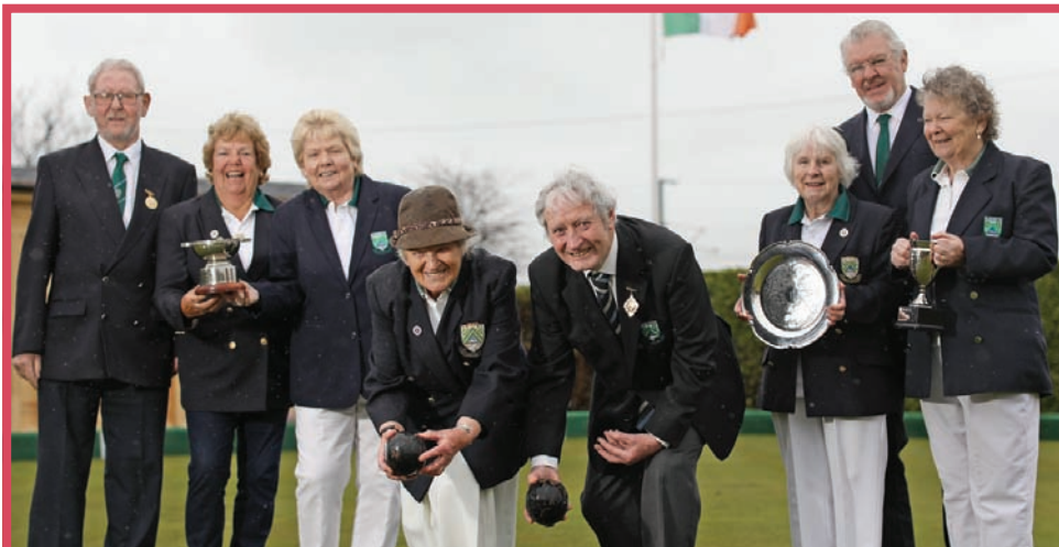
Two Wicklow organisations, the Centre for Creative Practices and Greystones Lawn Bowling Club (pictured), have beaten off stiff competition to be named amongst the thirty-six community groups, sports clubs and organisations from all over Ireland that were announced as regional winners and finalists in the National Lottery Good Causes Awards 2019. The Centre for Creative Practices will be in the Arts & Culture category while Greystones Lawn Bowling Club will be in the sports category for the awards grand final.

Speaking at the launch Minister Harris said, "It is great to see the expansion of the Rural Transport Programme in this region and in Co. Wicklow particularly. I am keenly aware that the primary objective of the Rural Transport Programme is to provide a quality nationwide community based public transport system in rural Ireland which responds to local needs and today we see an important step in that direction for Wicklow."