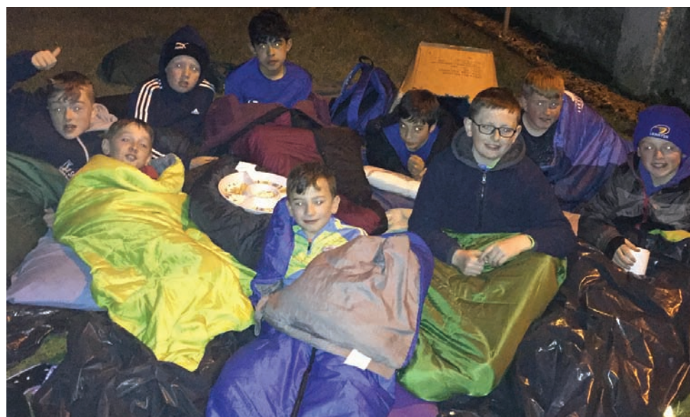
Pupils from Tynock National School sleeping out to help fight homelessness.

"We hope that if other Primary School's across Ireland see that we can do it, they will be encouraged to challenge homelessness too."