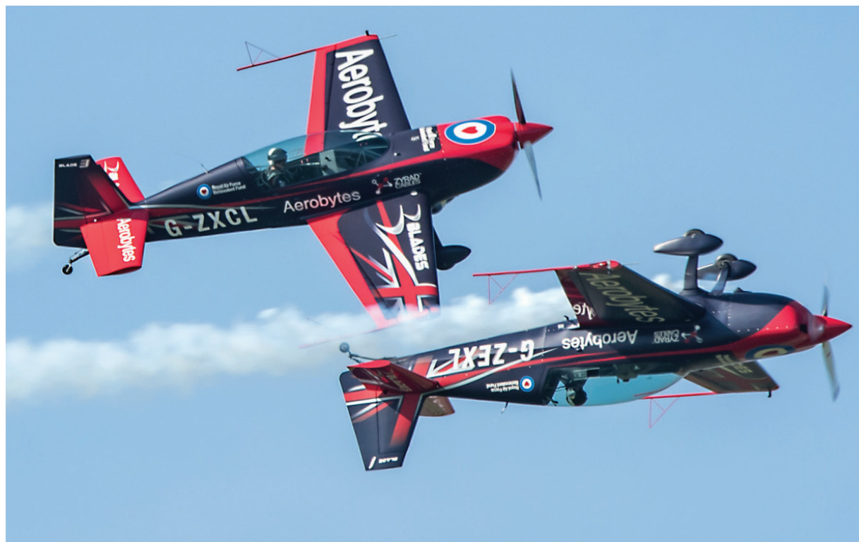
The Blades, a team comprised of former Red Arrow pilots, including Kirsty Murphy - the first and only female former Red Arrow pilot who flies alongside her husband Ben - will be part of the Bray Air Display 2019 lineup

Organisers of the 14th annual Bray Air Display have announced the line-up for this year's show on July 27th and 28th. Some of the best display teams and individual acts from around the world will showcase their aerobatic skills and perform to thousands of spectators at the free weekend.