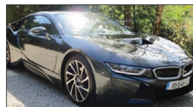
*151 BMW i8 , Full Option, auto, pristine, grey met., black lthr, 43km, 20" turbine wheel upgrade, stunning, 4WD, surround panoramic cameras, Harman Kardon sound upgrade, heated elec seats, prof widescreen sat. nav, bluetooth/audio music streaming, music storage with DVD player, Park dist, tax only €170, €66,950