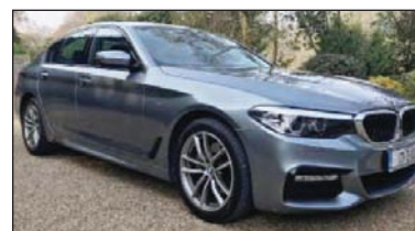
*171 BMW 520 M Sport , 2.0 Diesel, auto, grey, 186bhp, 39k miles, stunning, black lthr, Park dist., paddle shift, ph prep/music streaming, MFSW, cruise, Bi-Xenons, 2 keys, climate, FBMSH, completely as new, pro. widescreen sat. nav, €36,450