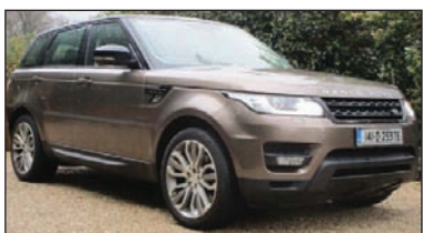
*141 Landrover Range Rover Sport HSE Dynamic , 3.0 Diesel Est, auto, gold, 57k miles, immaculate, Mocha lthr, Nara bronze met., ED headlights, f/fogs, phone prep with music streaming, elec heated seats, front and rear, climate, rev. camera, Park Dist, cruise, much more, 2 keys, NCT 04/20, €49,950