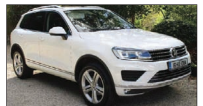
*161 Volkswagen Touareg 265BHP Business Utility , white 3.0 Diesel Commercial Auto, stunning, black lthr, 20" R Design alloys upgrades, Xenons, sat. nav, heat seats, rev. camera, Park dist., elec memory seats, cruise, MFSW, f/fogs, 2 keys, €30,853 + VAT