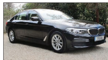
*171 BMW 520SE , 2.0 diesel, automatic, black, cream leather, 25k miles, stunning, 18" alloys, exterior chrome detail, prof widescreen sat. nav, BMW connected drive, cruise, park dist, dual exhausts, bluetooth ph prep, music stream, a/con, €34,450