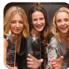
WOMEN IN BUSINESS page 19