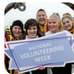
VOLUNTEER WEEK page 21

WEST & CENTRAL EDITION: DELIVERED TO HOMES & BUSINESSES IN: SHILLELAGH, TINAHELY, AUGHIRM, DONARD, DUNLAVIN, CARNEW, COOLATTIN, BALTINGLASS, BLESSINGTON