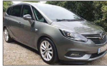
*162 Opel Zafira , 2.0, diesel auto, grey, stunning, 7 seats, unique, black lthr, 18" alloy upgrades, glass panor. roof, elec. roof blind, sat. nav, sports heated seats, climate, bluetooth/phone prep, music streaming, Park dist., cruise, privacy glass, NCT 11/20, €18,950