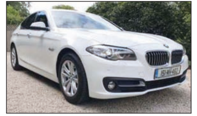
*151 BMW 520 SE , 2.0 Diesel, auto, alpine white, 35k miles, stunning, lthr, FBMSH, sat. nav, heated elec. seats, BMW bluetooth ph prep/music streaming, climate, cruise, Xenons, Park dist., 186bhp, tax 01/20, NCT 01/21, €21,950