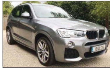
*151 BMW X3 2.0D XDrive M Sport , 4WD, 2.0 diesel, 44k, auto, immac. lthr sports uphol., sat. nav, dual climate, cruise, elec. tailgate, Park dist., auto lights/wipers, LED daytime lights, ph prep/music streaming, paddle shift, stunning, €29,950