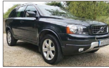
*141 Volvo XC90 4WD , 2.4 Diesel, grey, automatic, 102k miles, immaculate, FSH, black lthr, a/con, climate, cruise, elec. memory drivers seat, MFSW, alloy wheel upgrade, chrome roof rails, 163bhp, NCT 04/20, €22,950