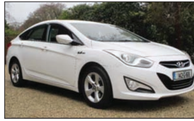
*142 Hyundai i40 1.7 Diesel , White, 84k miles, stunning, black upholstery, phone prep, MFSW, a/con, cruise, f/fogs, new clutch & flywheel just fitted, tax 06/19, NCT 09/20, 2 keys, €10,950