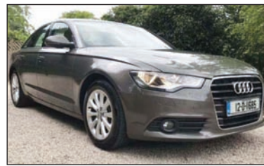
*12 Audi A6 3.0 TDI SE 204bhp , diesel, grey, 67k miles, stunning, tan lthr, FSH, 2 keys, leather heated seats, climate, cruise, bluetooth phone prep, lthr MFSW, Park dist., Chrome exterior detailing, fogs, NCT 02/20, €15,950