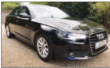
*12 Audi A6 , 2.0 Diesel, auto, black, 76k miles, pristine, lthr, sat. nav, heated elec seats, Park dist, auto headlights/wipers, MFSW, BOSE Sound system, new t-belt & water pump, 174bhp, 2 owners, 4-door, NCT 04/20, €13,950