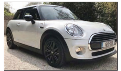
*161 Mini Cooper 1.5 , diesel, silver, 33k miles, stunning, half lthr sports seats, carbon black alloy wheel upgrade, sat. nav, iDrive system, climate, phone prep, 2 keys, much more, €15,450