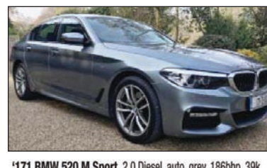
*171 BMW 520 M Sport , 2.0 Diesel, auto, grey, 186bhp, 39k miles, stunning, black lthr, Park dist., paddle shift, ph prep/music streaming, MFSW, cruise, Bi-Xenons, 2 keys, climate, FBMSH, completely as new, pro. widescreen sat. nav, €36,450