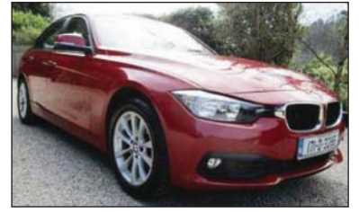
*171 BMW 320 SE , 2.0, red, 57k miles, diesel, immaculate, stunning, cream Dakota lthr, sat. nav, cruise, Park dist., bluetooth hone prep with music streaming, climate, a/con, MFSW, tax only €190p.a., 2 keys, NCT 03/21, €20,950