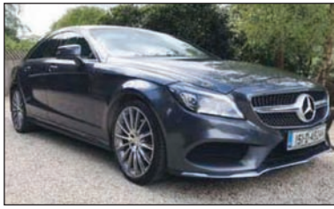
*151 Mercedes-Benz CLS 220D AMG Line Premium , 2.1 diesel, grey, auto, 49k, immaculate, lthr, FMBSH, widescreen sat. nav, s/r, heated elec. seats, touchscreen media with Mercedes bluetooth ph prep and music streaming, Xenons, 19" AMG alloys, privacy glass, Park dist, €29,950

Tel: 087 221 0600 or 01 274 3011 See more online: www.deerparkmotors.com