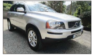
*11 Volvo XC90 , 2.4 Diesel, Estate, completely immaculate, 4WD, lthr heated seats, Xenons, a/con, cruise, elec. memory drivers seat, bluetooth ph prep, alloy upgrades and more, tax 08/19, NCT 02/21, €14,950