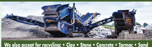
We also accept for recycling: • Clay • Stone • Concrete • Tarmac • Sand