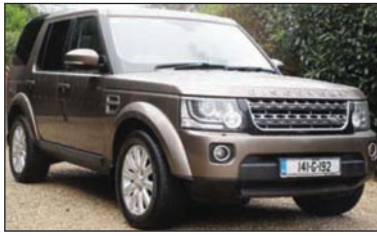
*141 Landover Discovery 5 Seat Business Utility , 3.0 diesel, 120km, bronze met., cream lthr, vehicle can be taxed €333 for business users, Park dist., ph prep, a/con, MFSW, f/fogs, privacy glass, Isofix, DOE 07/19, tax 06/19, €33,950 incl. VAT, €27,602