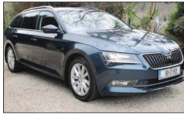
*161 Skoda Superb Estate 'Style' , 1.6 Diesel Estate, blue, 34k, stunning, Nappa lthr, 17" alloy upgrade, 'Smart link' conn, sat. nav, adaptive cruise, lane assist, climate, a/con, Xenons, reverse camera, elec memory heat seats, cruise, ph prep, Park dist., 2 keys, €19,950