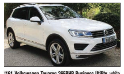
*161 Volkswagen Touareg 265BHP Business Utility , white 3.0 Diesel Commercial Auto, stunning, black lthr, 20" R Design alloys upgrades, Xenons, sat. nav, heat seats, rev. camera, Park dist., elec memory seats, cruise, MFSW, f/fogs, 2 keys, €30,853 + VAT