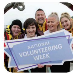
VOLUNTEER WEEK page 21

NORTH EDITION DELIVERED TO HOMES & BUSINESSES IN: SHANKILL, ENNISKERRY, BRAY, GREYSTONES, DELGANY, KILCOOLE, NEWCASTLE, KILQUADE, KILPEDDER, KILMACANOGUE