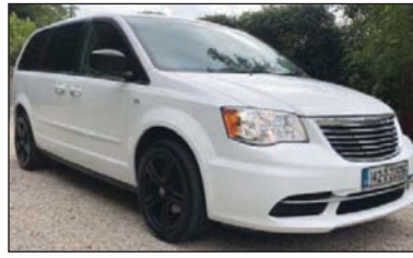
*142 Chrysler Grand Voyager , 2.8, diesel, auto, immaculate, low miles only 12k, Limited Stow 'n' Gof 7 seater, alloy upgrades, 3rd row seating, twim elec. sliding doors, elec. tailgate, dual climate, privacy glass, DVD/Video entert. consoles, NCT 07/20, €24,950