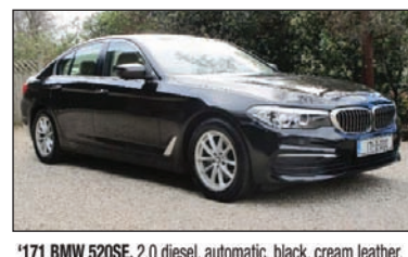
*171 BMW 520SE , 2.0 diesel, automatic, black, cream leather, 25k miles, stunning, 18" alloys, exterior chrome detail, prof widescreen sat. nav, BMW connected drive, cruise, park dist, dual exhausts, bluetooth ph prep, music stream, a/con, €34,450