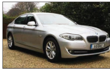
*11 BMW 520D SE , 2.0 Diesel, manual, silver, 123k miles, stunning, black lthr, exterior chrome detailing, heated seats, bluetooth ph prep, Park dist., f/fogs, cruise, MFSW, climate, 2 keys, NCT 10/19, service history, €9,950