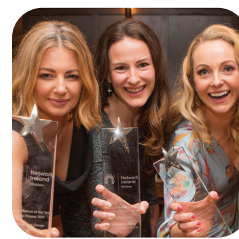
WOMEN IN BUSINESS page 19