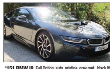
*151 BMW i8 , Full Option, auto, pristine, grey met., black lthr, 43km, 20" turbine wheel upgrade, stunning, 4WD, surround panoramic cameras, Harman Kardon sound upgrade, heated elec seats, prof widescreen sat. nav, bluetooth/audio music streaming, music storage with DVD player, Park dist, tax only €170, €66,950