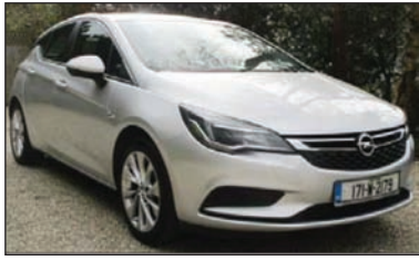
*171 Opel Astra 1.6 SC , 110bhp, Diesel, stunning, silver, a/con, bluetooth ph, Park Dist., auto lights/wipers, cruise and much more, only €180 road tax, 2 keys, 109bhp, 5-door, NCT 03/21, €13,950