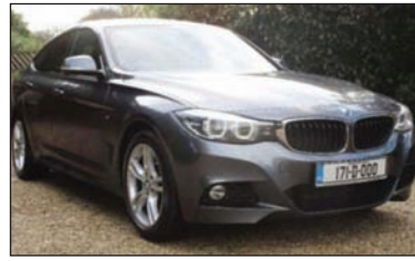
*171 BMW 320 GT M-Sport Grand Turismo , 2.0, diesel, 63km, auto, grey, black lthr, sat. nav, cruise, Xenons, climate, sports transmission, privacy glass, sat. nav, e/m, ambient lighting, much more, 2 keys, €27,950