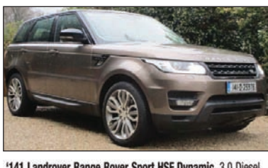
*141 Landover Range Rover Sport HSE Dynamic , 3.0 Diesel Est, auto, gold, 57k miles, immaculate, Mocha lthr, Nara bronze met., ED headlights, f/fogs, phone prep with music streaming, elec heated seats, front and rear, climate, rev. camera, Park Dist, cruise, much more, 2 keys, NCT 04/20, €49,950