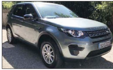
*152 Landover Discovery Sport , 2.0 diesel, grey, 33k miles, pristine, 4WD, 7 seats, 1 onr, black lthr, full glass panoramic moonroof, touchscreen media, bluetooth ph prep, music streaming, Park dist, 2 keys, a/con, NCT 11/19, €28,950