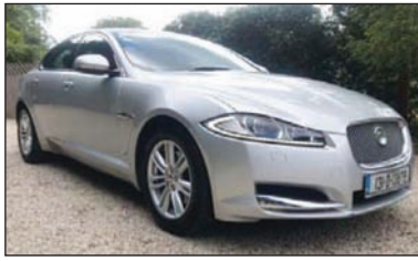
*131 Jaguar XF Luxury , 2.2 diesel, 35k miles, silver, FJSH, meticulously maintained, lthr, sat. nav, touchscreen media, bluetooth ph prep, USB interface, dual climate, MFSW, Park dist., Bi-Xenon headlights, tax 01/20, €280p.a., NCT 03/21, €16,950