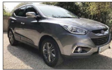
*141 Hyundai ix35 1.7 Diesel Premium , grey, 35k miles, black lthr, panoramic glass s/r, heated seats, rev. camera, dual climate, bluetooth and media player, LED daytime running lights, Park Dist., Isofix, 114bhp, NCT 04/20, €15,950