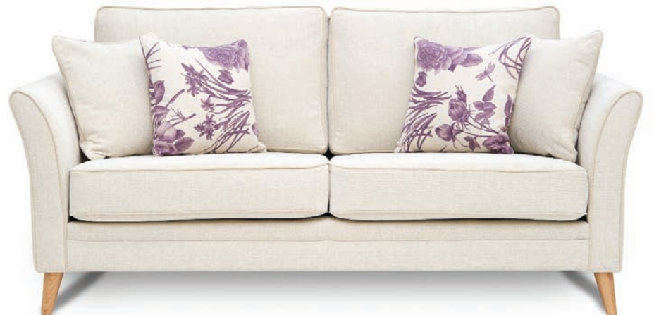
Isla Small & Medium Sofa Suite SHOW MODEL WAS €1895 NOW €1295 SAVE €555