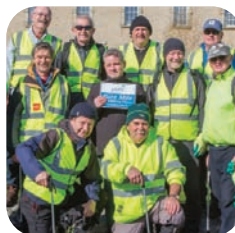
PURE CLEANUP page 8