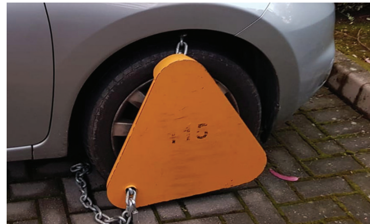
One of the cars that was clamped at Riversdale last week

In a statement to Wicklow Times , NCPS said "Some cars were clamped in error and they were released free-of-charge. We apologise for any inconvenience caused."