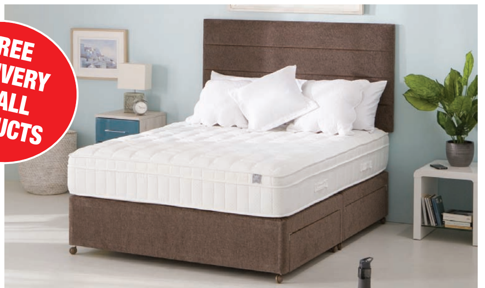
King Koil Spinal Elite King Size Bed + Base & Headboard SHOW MODEL WAS €1595 NOW €995 SAVE €600

Bray Retail Park, Bray, Co. Wicklow. Tel: 01 2813338 www.flanagankerins.ie