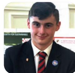
RATHDRUM STUDENT PRAISED page 14