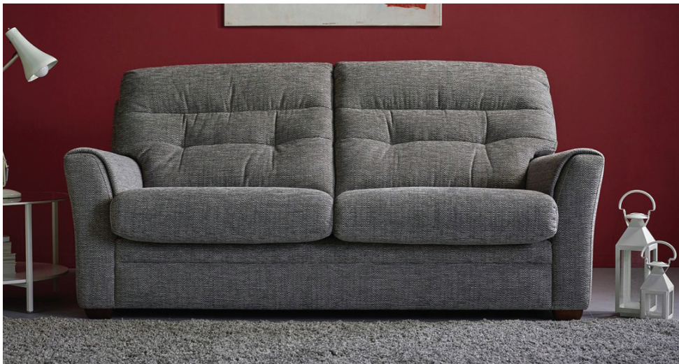
Panzano 3-1-1 SHOW MODEL WAS €4450 NOW €1950 SAVE €2500

FOLLOWING RENOVATIONS WE HAVE MANY DISPLAY MODELS REDUCED!