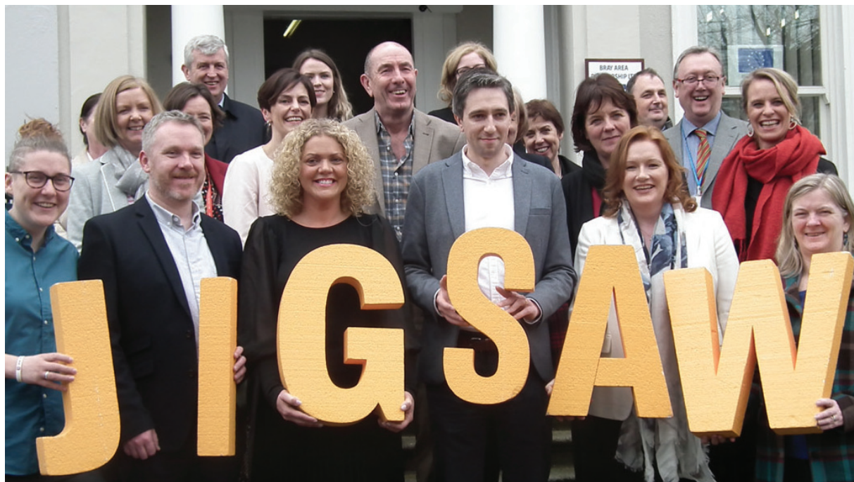
Minister Simon Harris outside Bray Area Partnership for the announcement of the Jigsaw service for Co. Wicklow, with representatives from the Bray Area Partnership, the HSE, Children and Young People Services Committee, Be Well Bray, Youthreach, Cairdeas Clubhouse, Child and Adolescent Mental Health Services (CAMHS), and St. John of God.

Local stakeholders gathered in Bray on Friday to meet Minister Simon Harris and representatives from Jigsaw and hear the much anticipated news regarding a new service for Co. Wicklow. The meeting provided Minister Harris and Jigsaw with the opportunity to confirm that Bray has been selected to be the site of the next Jigsaw Youth Mental Health Project.