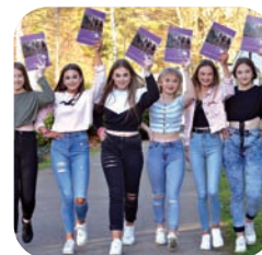
DRINKING CULTURE page 17

SOUTH EDITION DELIVERED TO HOMES & BUSINESSES IN: RATHNEW, WICKLOW, GLENEALY, BRITTAS BAY, AVOCA, WOODENBRIDGE, ARKLOW, SHILLELAGH, TINAHELY, REDCROSS, BALLINACLASH, AUGHRIM, RATHDRUM, DONARD, DUNLAVIN, CARNEW, COOLATTIN, BALTINGLASS, BLESSINGTON.