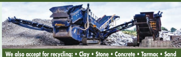
We also accept for recycling: • Clay • Stone • Concrete • Tarmac • Sand